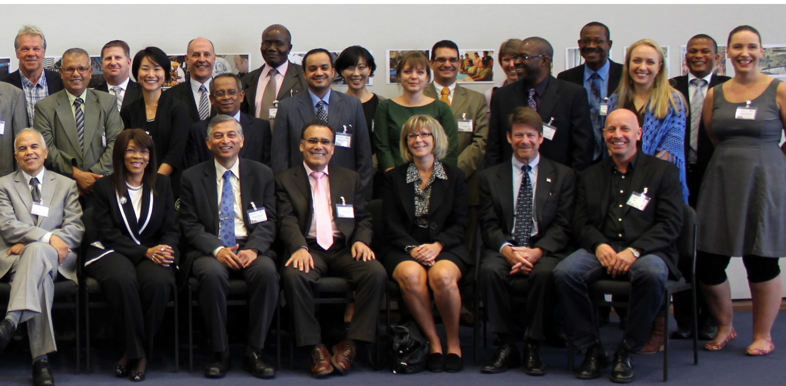
Participants and staff pose for a group photo taken during the Meeting of UNEVOC Cluster Coordinators