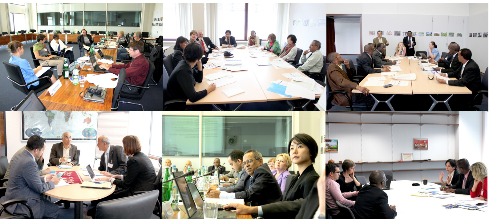
Presentations and working group discussions

A cluster's Coordinating UNEVOC Centre will thus be responsible for regularly informing the UNESCO-UNEVOC International Centre about relevant activities organized by the Centres, and facilitating the information flow between the International Centre and the regions. The Coordinating Centre will also develop a strategic relationship with the other Centres in the cluster and the UNESCO Regional and Field Offices.