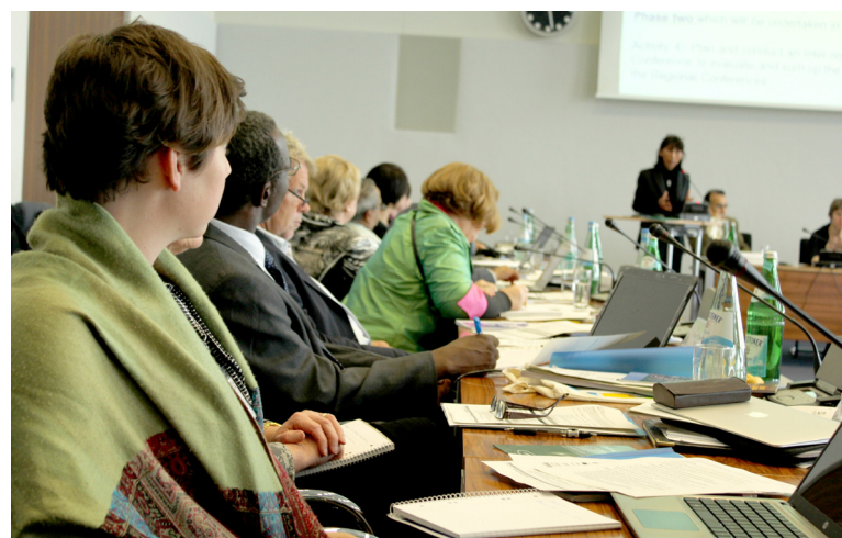
Participants listen during presentations

In 2013-2014, with the financial support of UNESCO-UNEVOC's German partners to execute two projects in Asia and Africa, the International Centre has proposed the following: