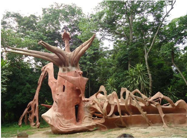
A UNESCO World Heritage Osun Grove, Osogbo, Osun State, South West Nigeria. site.

In order to place culture in its rightful position as the foundation of nation building, a National Cultural Policy was promulgated in 1988 with a view to utilizing culture as the bedrock of development. Prior to the 1988 Policy, Culture was generally relegated to the lowest ebb in nation building. However, with the 1988 Cultural Policy, there were still the challenges of inadequate sensitization and safeguard of the country's tangible and intangible cultural heritage. These factors,