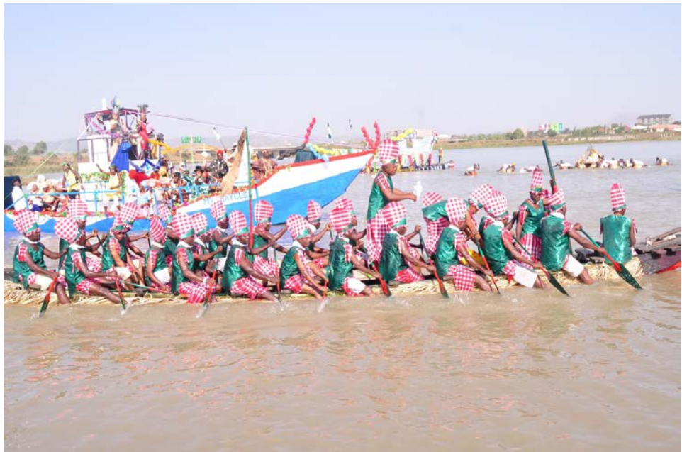
Abuja Carnival 2011.

UNESCO Abuja's strategic cooperation framework included support to the government of Nigeria to address the challenges of literacy and policy reform in education; the contribution of culture to development; the promotion of freedom of expression and information; strengthening media pluralism; promoting the role of STI in national socio-economic development and supporting the review of the STI policy.