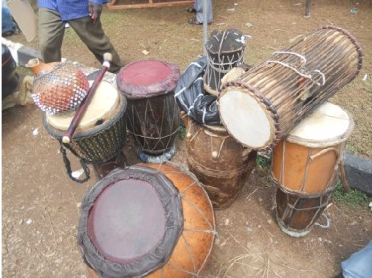
Drums and traditional musical instruments as cultural communication tools.

a database (cultural statistics) of the various cultural goods and services across the country and their locations; train and retrain cultural administrators; operationalize/domesticate the UNESCO Cultural Conventions in the country - all of which Nigeria has ratified; form innovative partnerships; create awareness among Ministries, Departments and Agencies, including the UN agencies on the importance of culture to development.