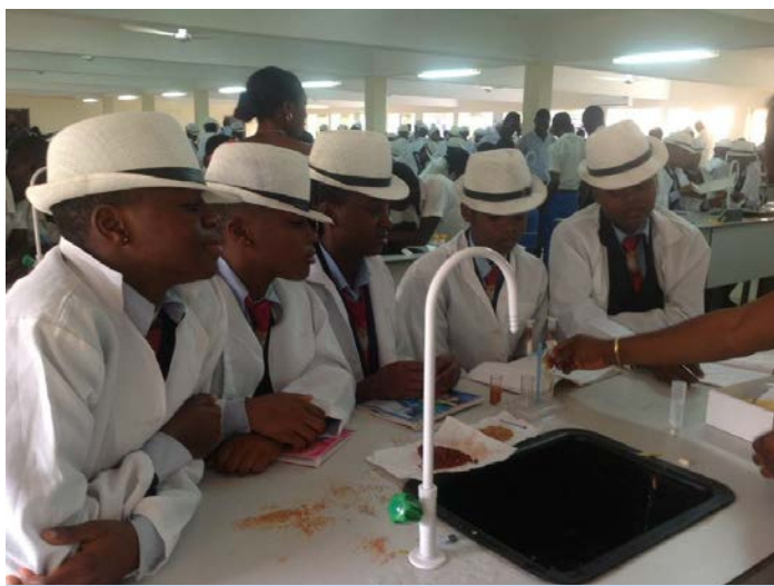
Demonstrating the use of Microscience kits to female science students during the UNESCO-ICTP-UNN Science Fair & Mobile Learning Training Workshop at the University of Nigeria, Nsukka, 17 – 21 June 2013.

In the last biennium, UNESCO, in collaboration with the Science Teachers Association of Nigeria (STAN) and other stakeholders, developed audio visual educational resource materials on step by step guide to Physics, Chemistry and Mathematics for Junior and Senior Girls secondary schools to enhance gender mainstreaming in science and engineering courses for increased participation of female students in Nigeria. The UNESCO science educational resource materials promoted and enhanced the utilization of Science and Technology/ICT - (interactive resource materials) to sensitize and popularize