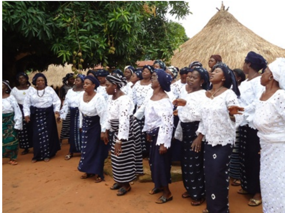
Communication 4 Development: Women of Korinya community in Benue State, rehearsing traditional songs co-produced by UNESCO Abuja/CI to disseminate HIV/AIDS message.

Nigeria as an independent nation for 52 years has developed several policies anchored on development of rural communities, but rural areas are still not developed and the quality of life of people in these areas continues to suffer. The slow implementation of the Freedom of Information Act by the government remains an issue as information/ records of activities of public institutions and other organizations using public funds are not readily available for public access.