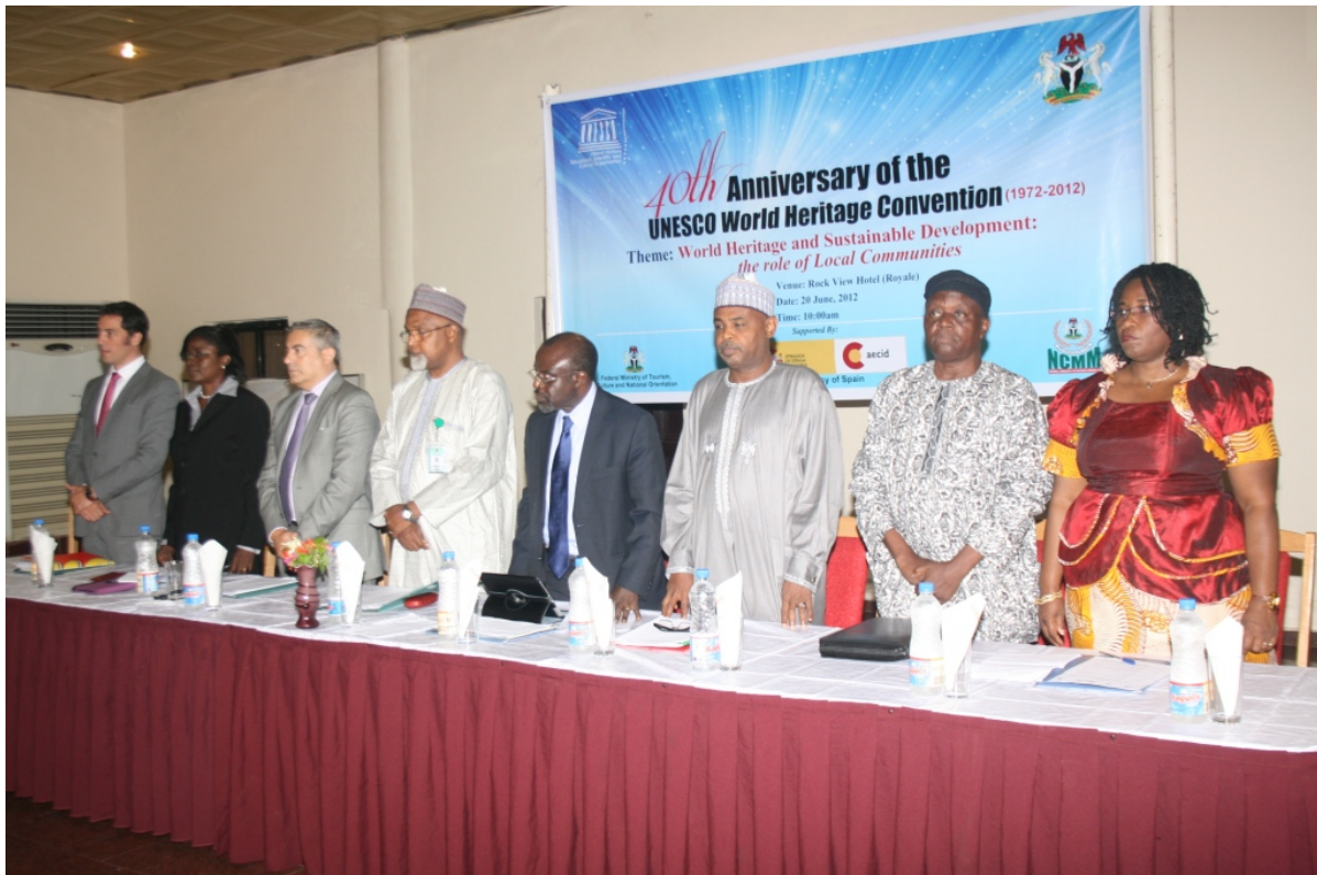
A cross-section of the high table at the Seminar to mark the 40 th anniversary of the UNESCO World Heritage Convention in Abuja.