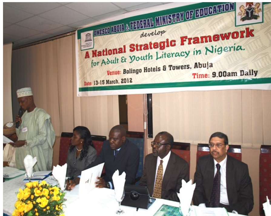
A cross-section of the high table at the National workshop on the development of a national strategic framework for adult and youth literacy in Nigeria.

The introduction of the Federal Teachers Scheme, the Special Teachers Upgrade programme (STUP) and the restructuring of the teacher education programme to be focused on specialist teachers according to the national policy on teacher education instead of the usual one-size-fits-all approach. All these are in the bid to remedy teacher shortage and quality and achieve the EFA and the education related MDGs.