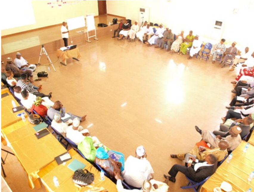
A cross-section of participants at a training of Radio/TV producers and scriptwriters on mainstreaming of HIV/AIDS education in radio/TV production under UBRAF.

It is worthy of note that as developed as the media industry is in Nigeria, the development is lopsidedly tilted in favour of mainstream commercial media at the detriment of community media whose main purpose is to give voice to the rural dwellers and promote their development and