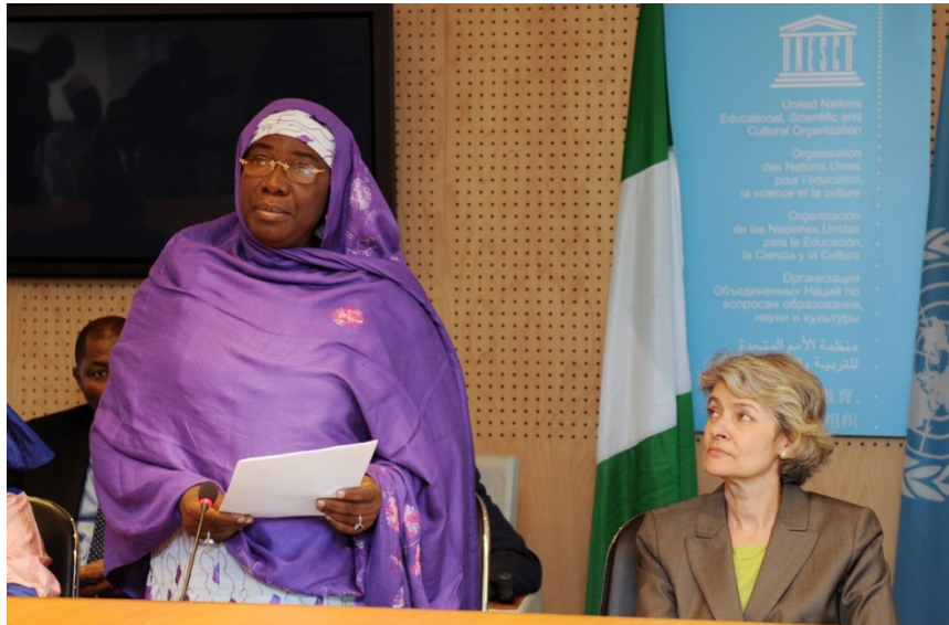
(L-R) Nigeria's Minister of Education, Prof. (Mrs) Ruqayyatu Ahmed Rufa'i and Director General UNESCO, Ms Irina Bokova, at the UNESCO headquarters, Paris.

thirty-six States and the Federal Capital Territory have realistic and well-costed credible strategic education plans in place using the EPSSim model. The process of developing the sector plans not only provided opportunities for learning to the States mobilized; it also contributed to initiating changes in the ways in which people work. These include team work, evidence-backed activity planning, engaging with stakeholders, improved