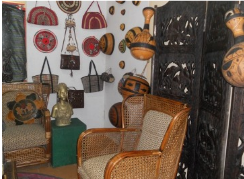
Some artifacts of the cultural industry in Nigeria.

Nigeria, a country with an estimate of over 400 languages and 250 ethnic groups, is divided into six geo-cultural zones; North/West, North/Central North/East, South/West, South/South and South/East. Each of the six geo-cultural zones is endowed with a variety of resources that make up Nigeria's rich cultural and natural heritage. Despite the abundance of cultural and natural resources available in the Nigeria, the contributions of the nation's cultural goods and services to the Gross Domestic Product (GDP) is low and unimpressive due to under-utilization of the potentials emanating from cultural goods and services. These could be used to link culture with all sectors of the society for socio-economic development, especially in a country with over 160 million people, many who are unemployed youth.