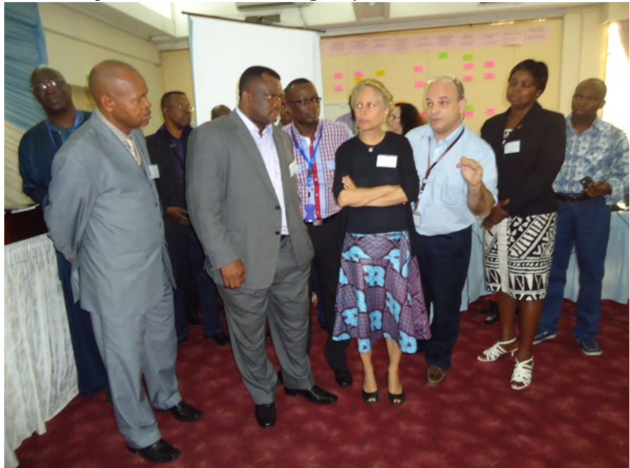
A cross-section of participants at the UBRAF HIV/AIDS and sexuality education training in Dakar, Senegal.

The reviewed STI policy which was implemented under the Nigeria/UNESCO STI reform initiative was launched in 2012. The policy lays emphasis on innovation which has become a global tool for fast tracking sustainable development. The new policy also demonstrates Nigeria's renewed commitment to ensure that its Research and Development engagements enhance new business development, encourage employment generation and proliferation of small scale enterprises to translate research outputs into goods and services in the market place.