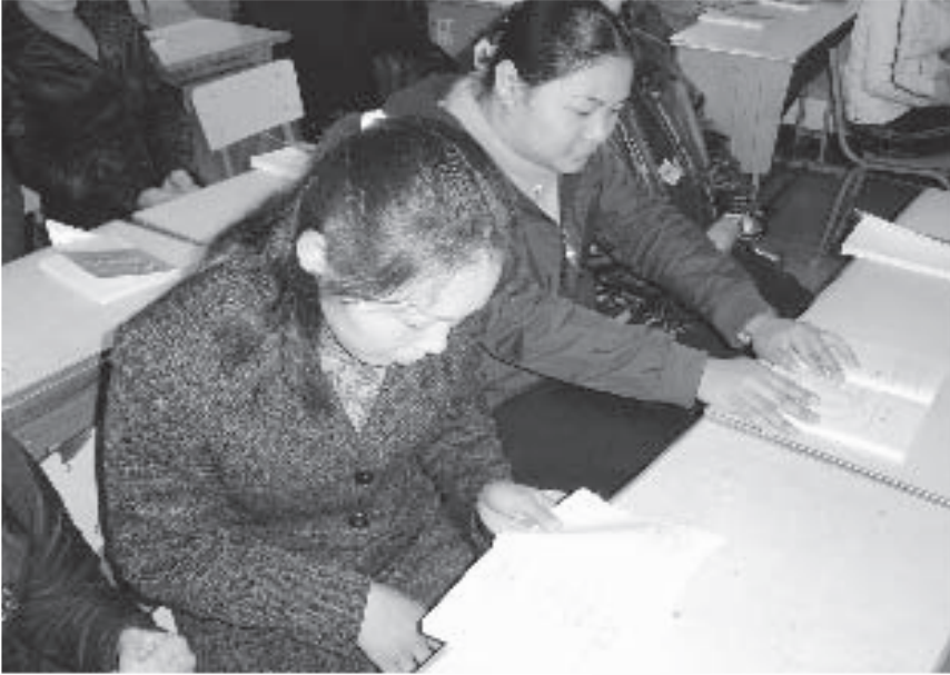
Training for migrants in Shanghai, 2004