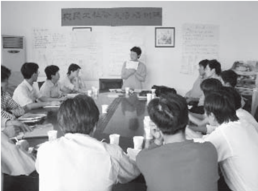
Training for migrants in Chengdu, 2004