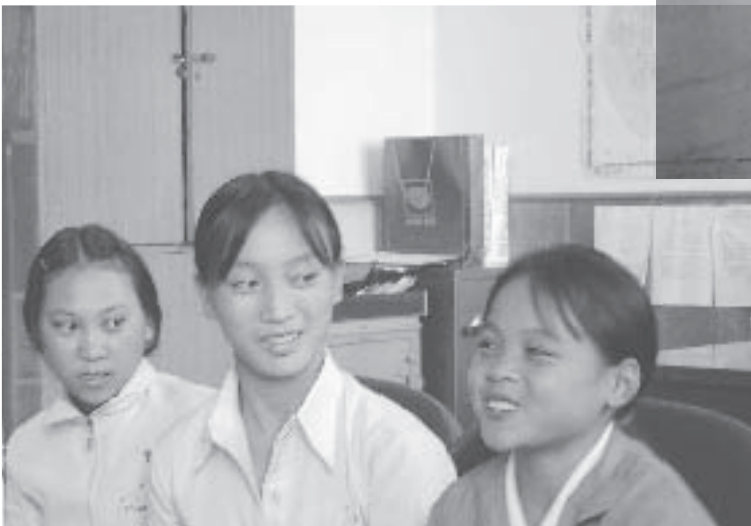
Migrant girls from Lincang county, 2003