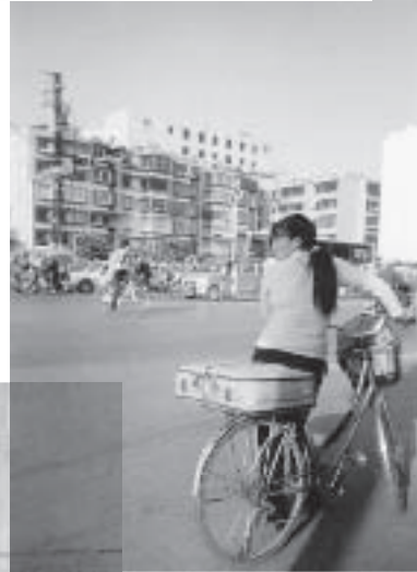
Migrant in the street in Kunming, 2003