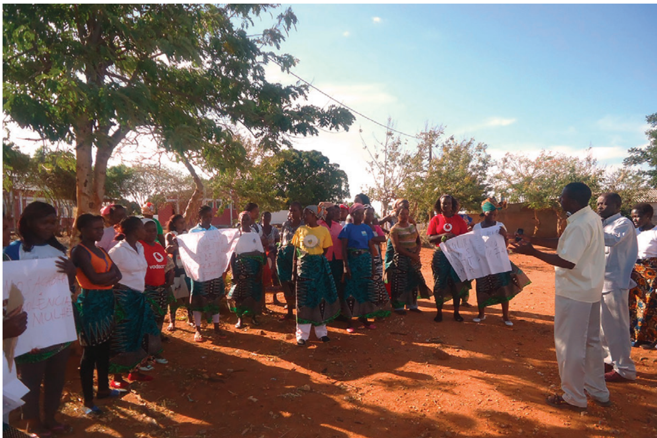
A moment from the campaign against domestic violence lead by Progresso learners

The portable libraries are managed by the literacy facilitator with the support of his/her supervisor.