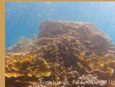
Rock Islands, Palau