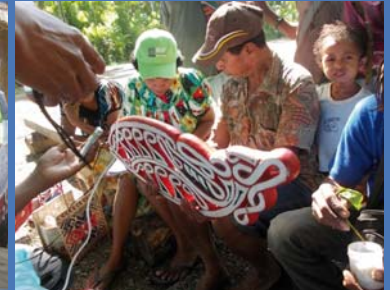
Inventorying Balu , Decorative Wood Carving for Lopo , Traditional Canoe, Alotau, PNG