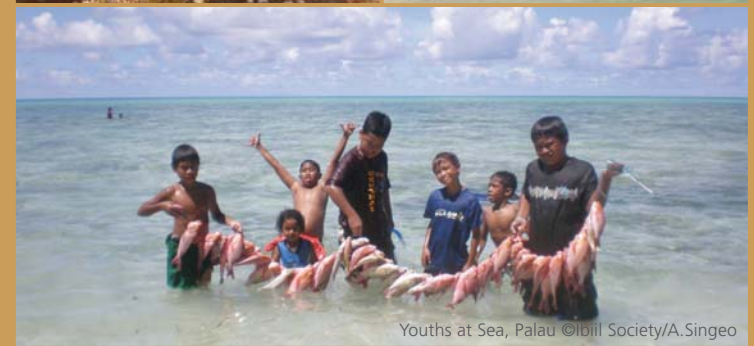
Youths at Sea, Palau