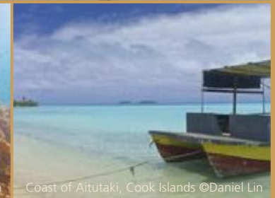
Coast of Aitutaki, Cook Islands