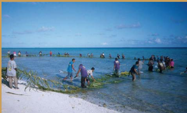
Traditional Fishing Method with Coconut Fronds, Marshall Islands

Several traditional fishing control practices have been put in place in the Pacific through different types of customary marine tenure. These practices include limiting access, closing fisheries during certain seasons, establishing no-catch zones, and enacting species-specific prohibitions. Examples include the no-fishing or tabu areas of Fiji, Vanuatu, and Kiribati; the ra'ui in Cook Islands; the masalai in Papua New Guinea; and the bul in Palau. These traditional fishery-management practices have served as measures for sustainable resource management and ecosystem protection. They have also constituted important living food reserves for communities.