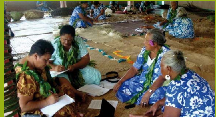
ICH Inventoring in Solosolo Village, Samoa