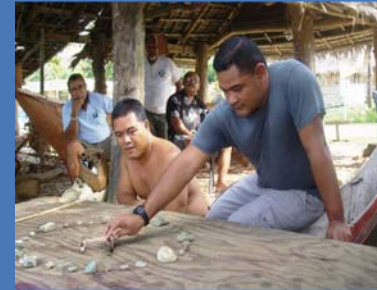
Demonstration of Traditional Navigation, Yap