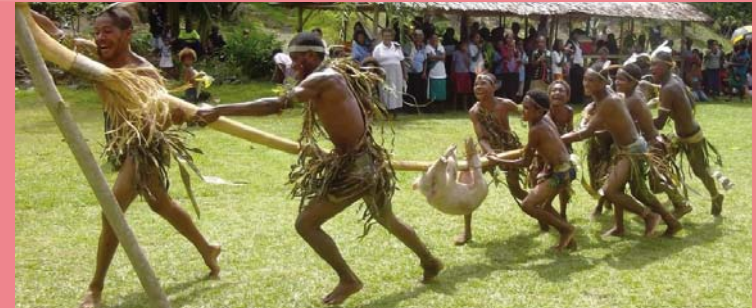
Epawepawe , Traditional Children's Game of Ealeba, Milne Bay Province, Papua New Guinea

Traditional support systems in communities are vital mechanisms for resilience. In the Pacific, this can take many guises, including reciprocal exchanges and the trading of valuables among communities and islands, the history of which predates European contact. Traditional feasts and ceremonies were also organized not only for the consumption of existing stock but also for the production of extra supplies. On such occasions, the role of traditional chiefs was primarily to ensure redistribution of traditional wealth, such as vegetables, pigs, mats, bark cloth, and shell money, among community members and families. The organization of these events provided opportunities for cooperation within and among communities and islands.