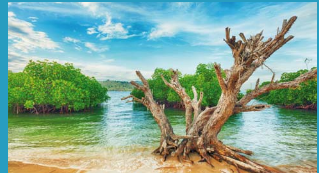
Coastal Erosion