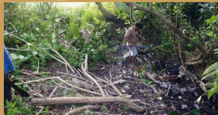
Clearing of Taro Pit and Replanting, Marshall Islands

The Federated States of Micronesia (FSM) became party to the ICH Convention in 2013. The first ICH workshop in FSM was hosted in Yap State in February 2013.