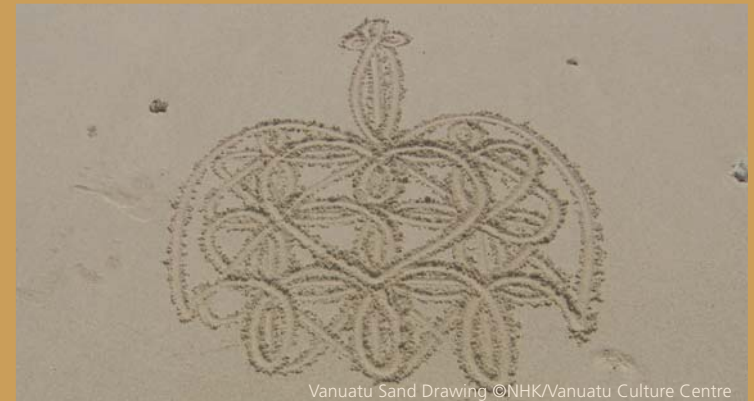
Vanuatu Sand Drawing