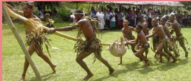
Epawepawe, Traditional Children's Game of Ealeba, Milne Bay Province, Papua New Guinea

Published jointly by UNESCO Office for the Pacific States P.O. Box 615, Matautu-uta, Apia, Samoa