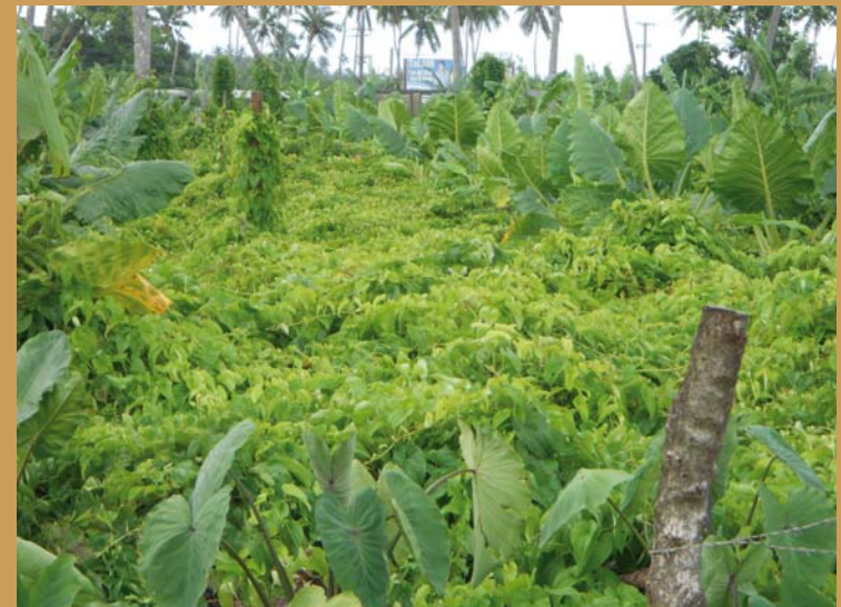
Yam Plantation, Tonga

The names of the months in the Tongan calendar are based on the relative growth, development, and cultivation of yams, the most valued food crops in Tonga. Some rural farmers still operate according to these lunar cycles despite the acceptance and adoption of the Western calendar in Tongan society.