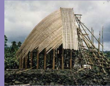
Fale Under Construction Using Traditional Methods, in Asau, Savai'i, August 1978 ©Trustees of the British Museum, Oc,A36.58, AN510422

There are many examples of traditional building methods in Pacific islands. Due to the frequency of natural disasters in the region, many building styles demonstrate adaptations to environmental hazards. Examples include the traditional Samoan fale tele , which is mounted on a high stone foundation to prevent flooding and storm surges. It has a high dome ceiling to combat humidity and has open sides to allow winds to pass through. Such traditional dwellings incorporate architectural styles that enable them to withstand extreme weather and strong winds. Even in the event of the structure failing, replacement materials are readily available and sustainable, and the collapse generally would not injure the inhabitants. Many of the traditional aspects of vernacular housings in the Pacific have eroded with the introduction of Western building techniques and materials, including corrugated iron and concrete. Construction is often unregulated, and buildings are not built according to proper building standards and codes. This makes the Western-style buildings more vulnerable to environmental hazards and more dangerous to inhabitants.