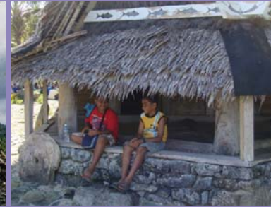
Traditional Men's House, Yap

In Samoa, the builders of houses were also the architects who belonged to an ancient guild of master builders, tufuga fau fale . The Samoan word tufuga denotes the status of master craftspeople or Living Human Treasures. The Post-Disaster Needs Assessment following Cyclone Evan that hit Samoa in December 2012 recommended revitalizing the skills of the master craftspeople through appropriate incentives and encouragement. Revitalizing these skills will enhance the resilience of communities by reinvigorating the positive features of traditional buildings in Samoa. 3 This will be particularly relevant as cyclone intensity is predicted to increase in the region due to climate change.