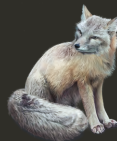
Vulpes corsac in winter