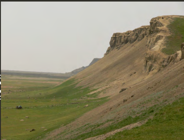
Transition zone of BR (former island Kokaral)

alternative activities, resource-conserving and resource-restoring technologies. The Coordinational Council of biosphere reserve consists of representatives of state agencies (territorial agency of forestry and hunting, oblast territorial agency of fishery), state nature reserve, Akimat (department of land resources, agriculture, etc.), local NGOs and land users, and is necessary in providing collaboration and problem-solving opportunities for all stakeholders.