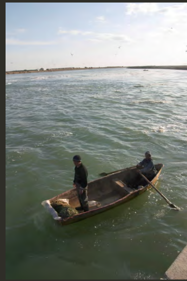
Sailor in Small Aral Sea

The rural population living in villages in the delta is mainly engaged in fishing. Fishing villages appeared positioned away from fishing areas, fishing camps or camp did not have a permanent location, in connection with the unstable hydrological regime of the sea. To replace the widely held in the 1990s, species Pleuronectes (Platichthys) flesus luscus 16 species of fish have been restored to the level of fishing at the moment in the Small Aral Sea.