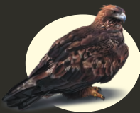
Barsakelmes Biosphere Reserve

Data Book of Kazakhstan ( Scirpus kasachstanicus and Nymphoides peltata ), that in other areas of the reserve is not found, and nowhere more than in Kazakhstan are not protected; 85 species of zooplankton including 4 rare and 2 endemic; - 250 species of birds, consists of about 100 nesting (including 40 rare and endemic), 27 species inserted into Red Data Book of vertebrates and 13 species from the IUCN Red List. Wetlands of Small Aral Sea plays an important role as a place of rest and stop on the migratory routes of birds, linking Siberia to their wintering places in South Asia and Asia Minor and Africa, so they are included in the international list of Important Bird Areas in Kazakhstan (IBA). During migration 20-50 thousand of waterbirds stops here, so it meets international standards (A1 A4i b A4ii), according to which the Small Aral Sea and new Syrdaria delta were included in the list of the Ramsar Convention as a globally significant wetlands of international importance; - 18 species of fish (from 20), inhabiting in Small Aral Sea including 3 rare species from Red Data Book of Kazakhstan: ( Barbus brachycephalus brachycephalus ), ( Chalcalburnus chalcoides ), ( Abramis sapa aralensis ).