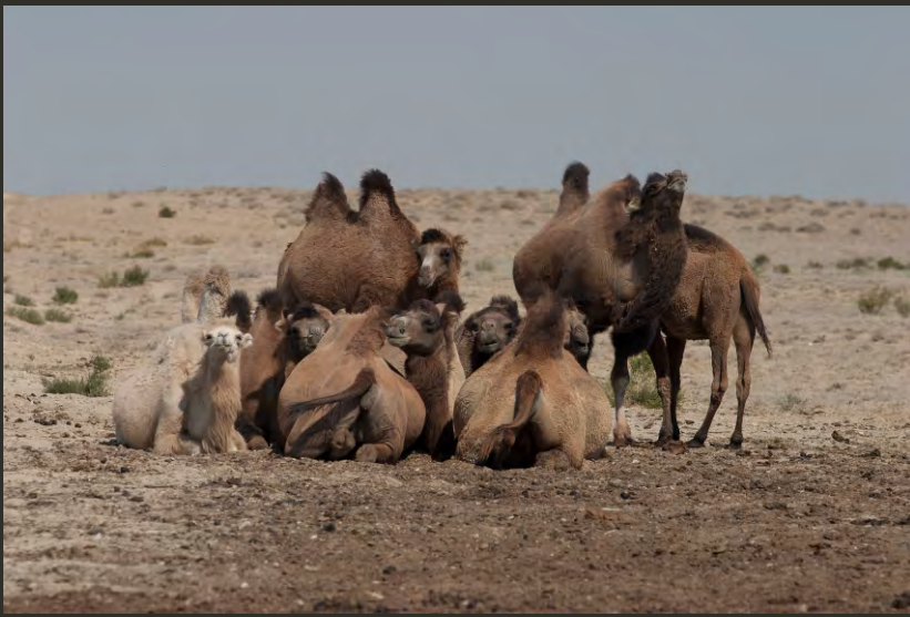
Wild Baktrian Camel, Camelus bactrianus