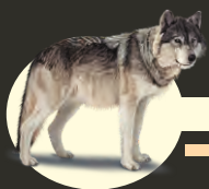
Barsakelmes Biosphere Reserve

The current goal for core and buffer zone is formulated as follows: to provide monitoring observations of succession processes in wild nature ecosystems as well as to protect some wild species of animals and plants against climate change impact.