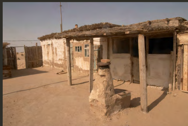
Living house in transition zone of BR

plant communities; habitat restoration and the number of wild animals; land use for arrangement of tourist attractions and tourists devices nurseries for artificial breeding, cultivation, breeding of endemic, rare and endangered plant species and animals, as well as construction of office buildings (cordons) to stay BR employees, providing them with official land plots.