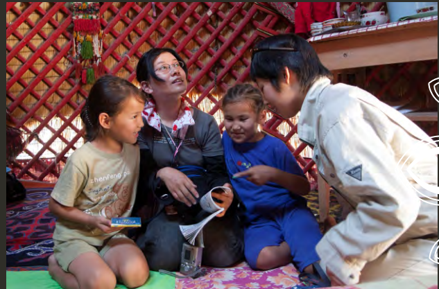
Japanese students read a book with local girls