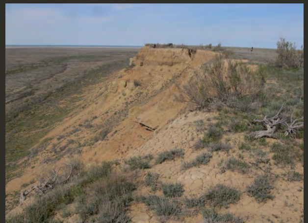
Core zone of BR (former island Barsakelmes)