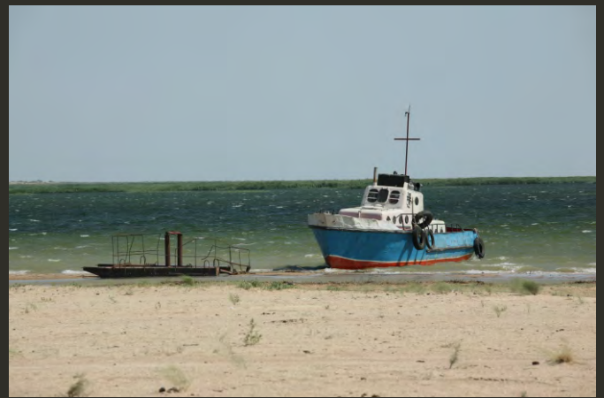
Transition zone of BR (coast of Small Aral Sea)

The biosphere reserve is managed through Barsakelmes Biosphere Reserve Coordinational Council created in 2014. Before that the territory of the core and buffer zone was managed by Scientific-Technical Council of the Nature Reserve (until 2014). Coordinational Council is a collegial public body created to introduce policies of effective management and sustainable use of biosphere reserve's resources,