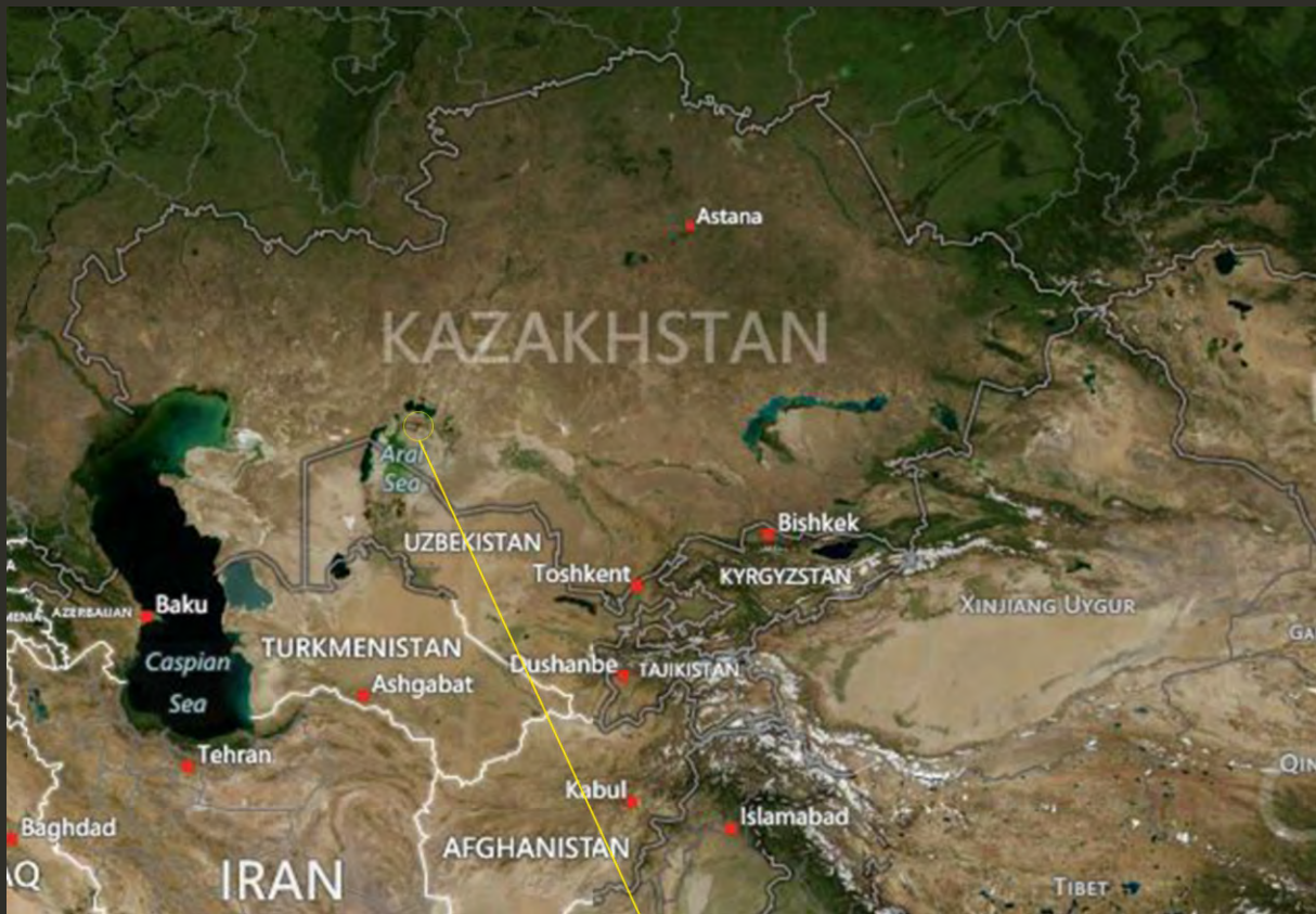
Biosphere Reserve Barsakelmes

Total area of the territory of Barsakelmes Biosphere Reserve is 407 132 ha. The main core zone (territory of Barsakelmes State Nature Reserve) is 160 826 ha, buffer zone is 46 306.34 ha, development zone – about 200,000 ha.