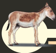
Barsakelmes Biosphere Reserve

The main area is located in a desert landscape temperate zone.