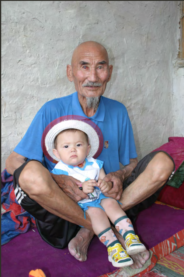
Former sailor with his grandson, Karateren Village