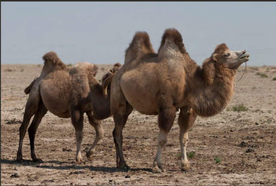
Male of the Wild Bactrian Camel in watering place