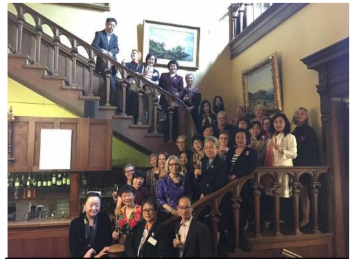
Dir/ODG/GE with all the participants of the Forum