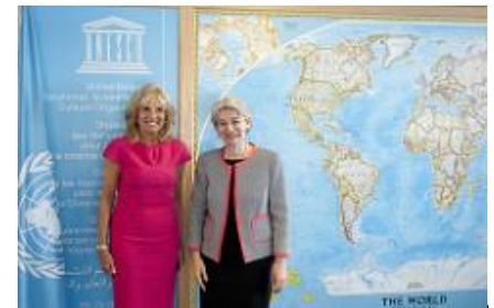
Dr Jill Biden and DG during the launch