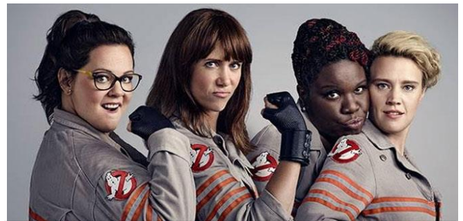
From left to right: Melissa McCarthy, Kristen Wiig, Kate McKinnon and Leslie Jones

2016 Ghostbusters movie: The new Ghostbusters film is a remake following the release of Ghostbusters II , which originally debuted in 1989. The Sony production company decided to replace the original male cast with an all-female one. The 2016 version stars Melissa McCarthy, Kristen Wiig, Kate McKinnon and Leslie Jones. They are the lead roles who play scientists and engineers instead of supporting characters like love interests. The decision to feature an all-female cast created some controversy among media outlets; however, there has also been acclaimed praise for innovating the roles women play in mainstream films. This is a win for the Bechdel test , featured in the last edition of Gender Wire, which measures whether a work of fiction features at least two women who talk to each other about something other than a man. Ghostbusters II shows a promising change in the right direction, let's see how 2016 goes for women in the film and entertainment industry.