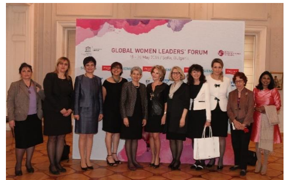
The Director-General, Dir/ODG/GE and distinguished guests at GWLF