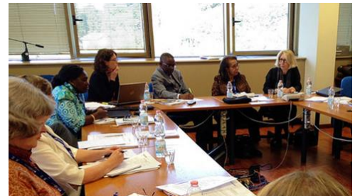
Dir/ODG/GE (far right) speaking at GenderInSITE Steering Committee meeting