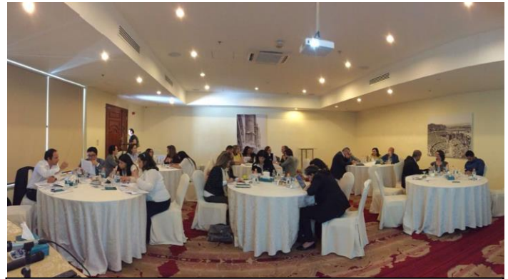
Participants at the Amman Training sharing ideas

In collaboration with the Amman Office, training was provided to all staff members of Amman and Iraq offices as well as selected program specialists from the offices of Beirut, Doha and Ramallah. In total, 47 staff members participated to the GE training in Amman, including the Directors/Heads of Amman (and Iraq), Doha and Ramallah offices. Upon request, special sessions were also organized for the Gender Focal points of other UN agencies and principals of the UN agencies present in Amman.