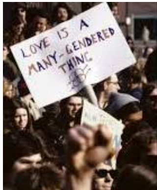
Scene from Two Spirits , documentary

was seen as fluid, which bridged the gap between the temporal and spirit worlds.