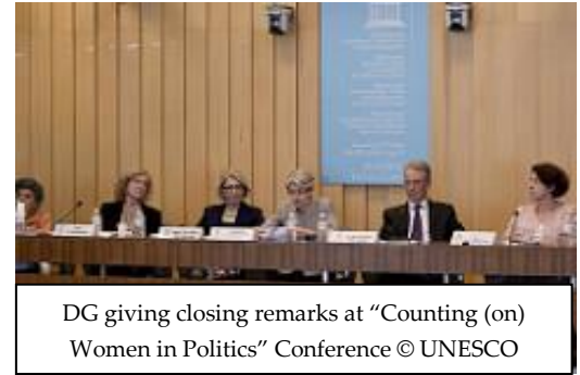
DG giving closing remarks at “Counting (on) Women in Politics” Conference

together to discuss the results that emerged from the extensive research. The Director General joined the final discussion and gave the closing remarks. A synthesis report based on the final reports from each country and the Conference will be published in October 2016 to release the findings and recommendations.