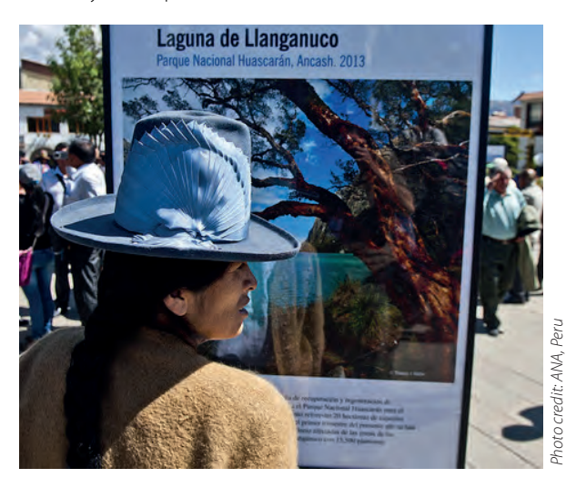
Visualization of scientific data and access of the public to such information is vitally important.

creation of platforms of exchange will not only strengthen the communication between the scientific community and policy makers, but also increase the awareness and the acceptance of adaptation projects by the local population.