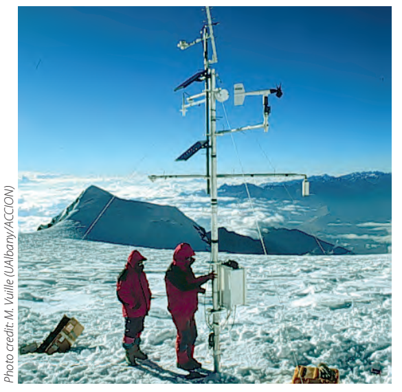
Long –term monitoring of climate change and glacier recession are fundamentally important.

design, quality and efficiency between monitoring networks are equally a challenge.