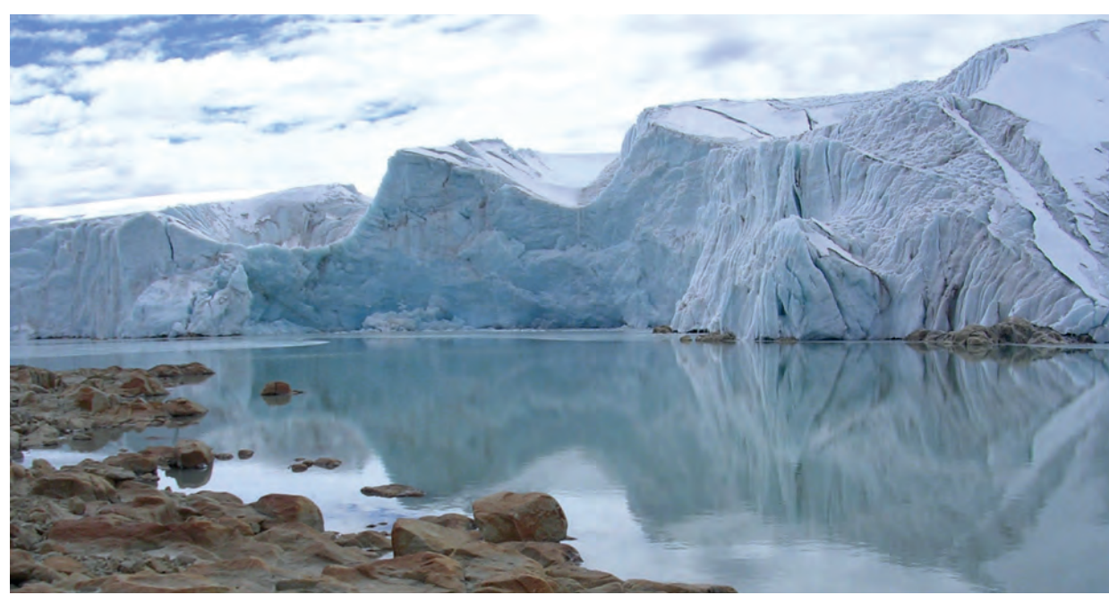
Quelccaya ice cap in Peru.