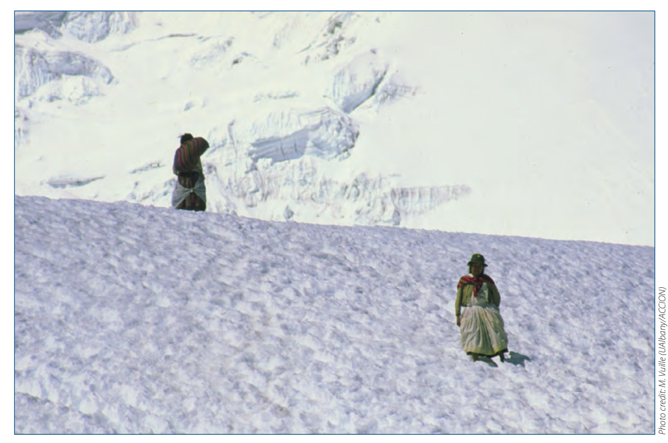
Glaciers in the Andes have important economic, environmental, social, cultural and spiritual meaning for local Andean populations.

The objective of this policy brief is to synthesize the current scientific information regarding climate change, glacier retreat and their impacts on water resource availability in the Tropical Andes. It summarizes the discussions and outcomes from a series of meetings that were held on this topic between 2012 and 2014 in Santiago, Chile; Lima, Peru and Quito, Ecuador.