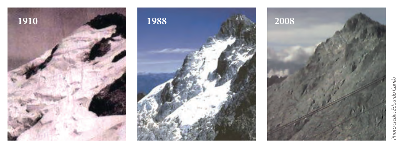
Glacier Espejo Pico Bolivar (5002 m), Venezuela

Glaciers along the entire tropical Andes are in a state of retreat. The rate of retreat is accelerating. Many smaller and lower-elevation glaciers have already disappeared and many more will likely disappear over the coming decades. The current retreat is unprecedented since at least the mid-17th century.