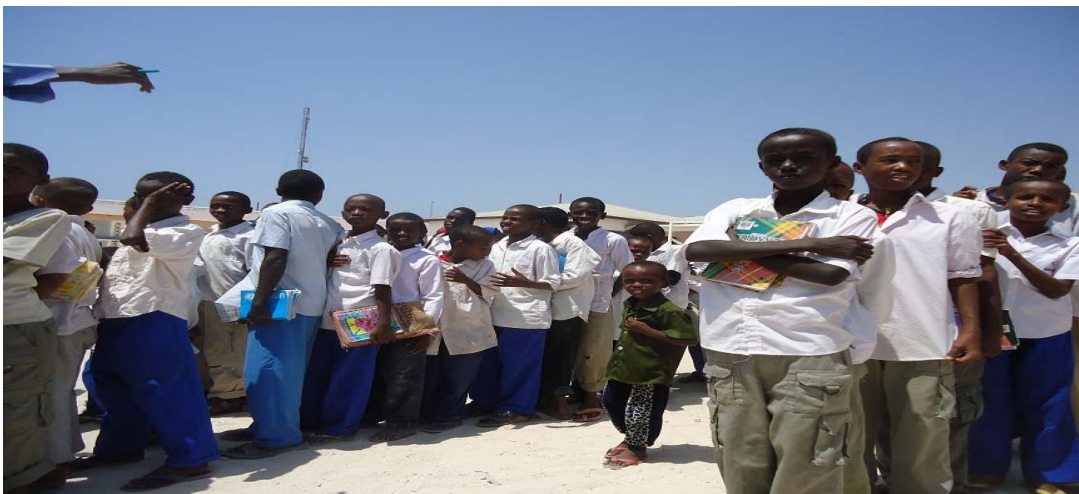
Mohamud Mire school students preparing for class

Department of School Facilities and Educational Infrastructure