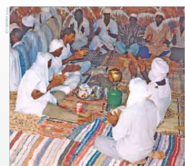
Participants in the first session of the Intangible Heritage Committee in Algiers enjoyed a performance of the Ahellil of Gourara, a music and dance tradition proclaimed a Masterpiece in 2005.

In her welcoming speech, H.E. Ms Khalida Toumi, Minister of Culture of Algeria, emphasized that ICH is "always a work in progress, evolving, cumulative and structured", concluding that "intangible heritage is to the identity of peoples what the DNA map is to the human genome". All 24 States Members of the Committee participated; 16 States Parties, 20 Member States non-States Parties, and 3 NGOs were admitted as observers. Ms Toumi was elected as Chairperson by general acclamation. (cont'd to page 2)