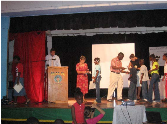
Poster Competition - Prize giving ceremony

Please report all sea turtle related activity to the St. Kitts Sea Turtle Hotline at 764-6664. Visit www.stkittsturtles.com for more info!