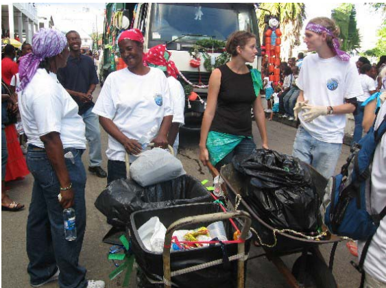
“Clean-Up” Carnival Troupe