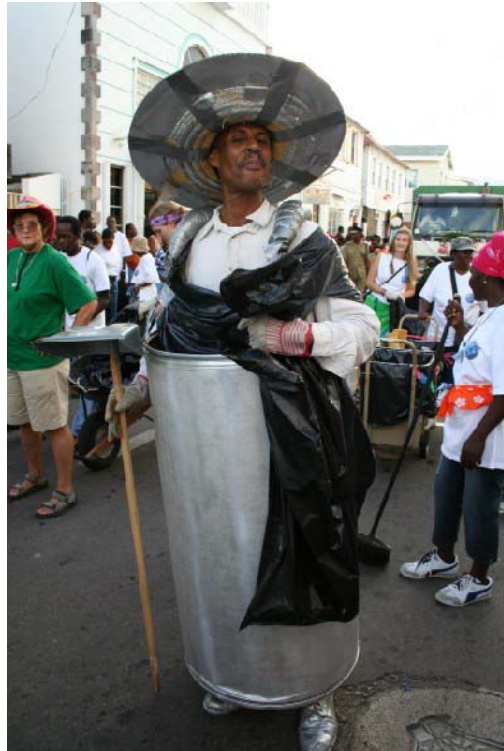
“Clean-Up” Carnival Troupe