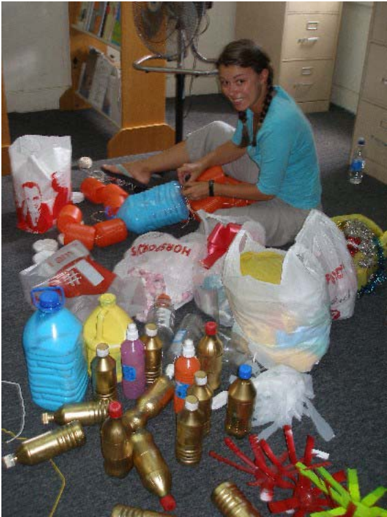
“Clean-Up” Carnival Troupe - Preparation