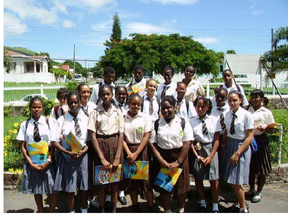
“Back chat” students