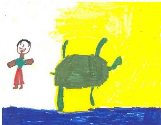
Poster Competition - Other Entry