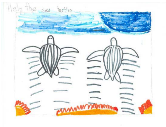
Poster Competition - Other Entry