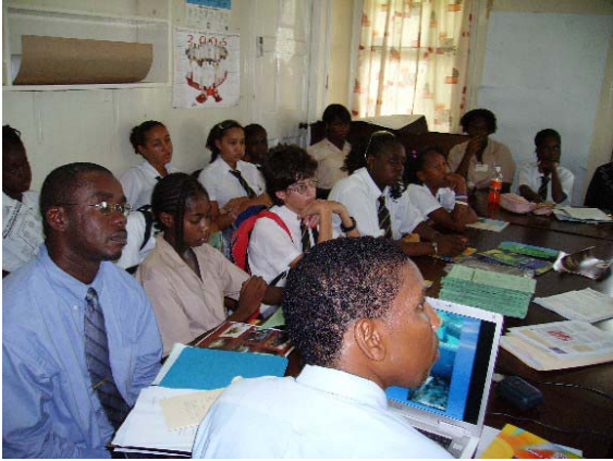
“Back chat” students