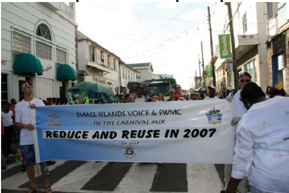
“Clean-Up” Carnival Troupe