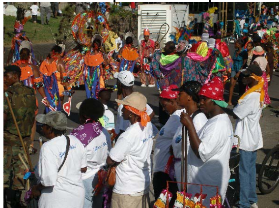
“Clean-Up” Carnival Troupe