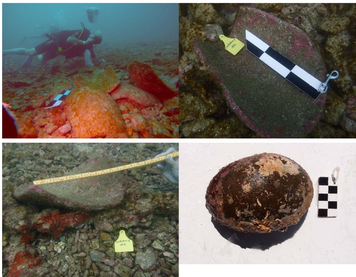
Figure 2.3. Contadora 1 site - Fragments of ceramic recipients. Scale of the upper images: 30 cm. Bottom-right photo: Boulder that could have been part of the ballast of a vessel. Scale: 5 cm.