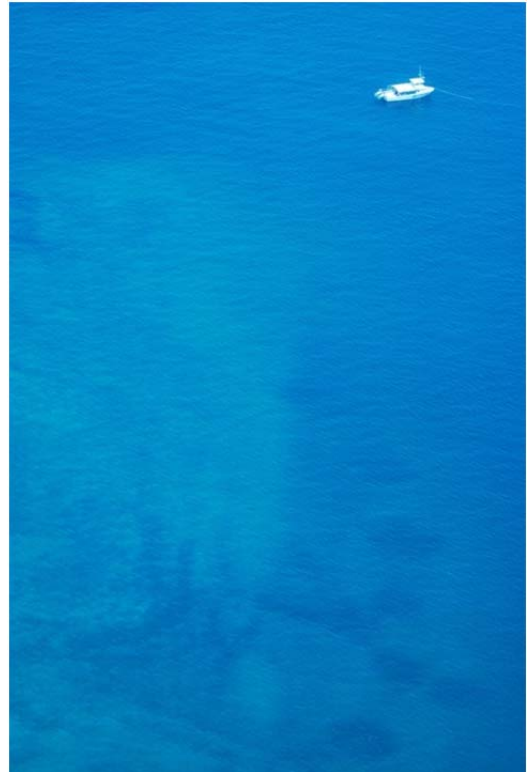
Figure 2.5.b. Right: Aerial view showing the circular depressions left in the seabed after the use by IMDI of the propeller deflectors, which produce powerful jets of water.