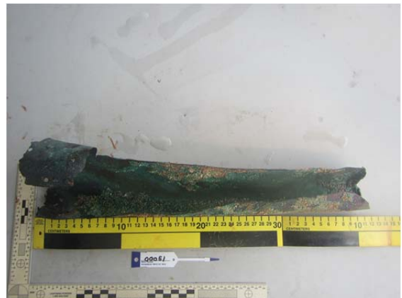
Figure 2.8. Piece 00051, attributed to the galleon San José .

2.43 Hence, the threaded pieces mentioned above (00415 and 00414), as well as other iron fittings and fastening elements attributed to the galleon San José , which appear to have been made of bronze or some other copper