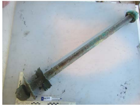
Figure 2.7.b. Piece 00414. IMDI, report of November 2014.

A direct inspection of these pieces would need to be undertaken, but if the threads are of the industrial type, they could not have come from the galleon San José (or any other vessel from that period).