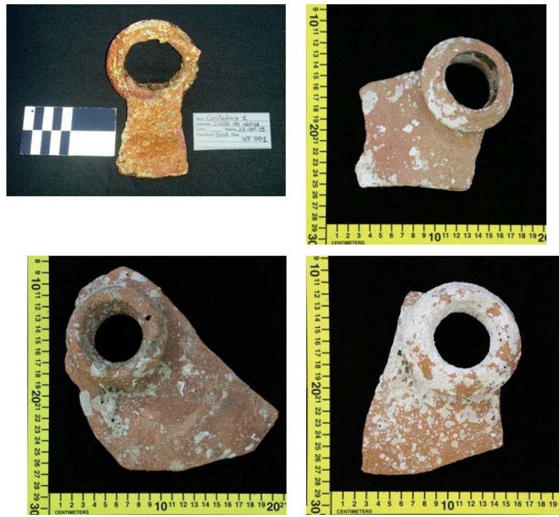
Figure 2.2. Top left: Contadora 1 site - Piece No. 001. Neck of a ceramic container made from reddish paste. Rest of images: Similar pieces removed by IMDI from the site attributed to the galleon San José . Clockwise: 00101, 00501 and 00328 (IMDI reports).