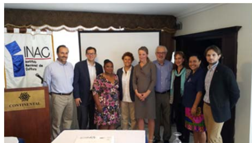
Figure 1.1: The members of the Mission with representatives of the Panamanian authorities.