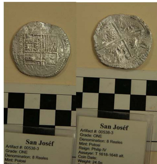
Figure 2.6. Front and back of a hammered silver Spanish coin (piece No. 538-3). To the naked eye, details such as the year of issue and the mintmark cannot be seen, however the general design corresponds to the period in which the galleon San José floundered.

2.41 Until well into the 18th century, threaded iron fittings were made by hand. These bolts might be occasionally found joining pieces of carpentry in the cabins or in lightweight bulkheads of ships, however, threaded bolts only began to be used in shipbuilding after the advent of the mechanical lathe towards the end of the 18th century, which made it possible to perform combined rotation and feed movements to work metals in