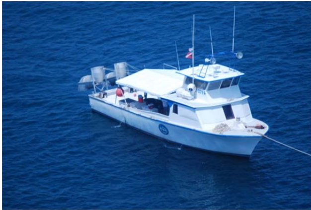
Figure 2.5.a. Top: The Blue Water Rose boat used by IMDI. The propeller deflectors used in the excavation of the site attributed to the San José wreck can be seen on the stern.