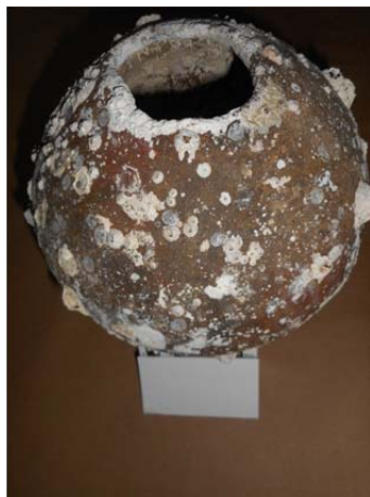
Figure 2.4. Example of one of the ceramic objects recovered by IMDI from the site attributed to the galleon San José , which has not received adequate conservation treatment. Note the abundant presence of buildups of biotic origin, known as biofouling, which are still on the surface of the materials © Photos UNESCO-STAB.

2.33 Another important aspect that was not complied with in the work carried out by IMDI concerns the competence