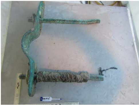
Figure 2.7.a. Piece 00415 - IMDI, report of November 2014.

this way 43 . In other words, this type of threaded bolt came after the European industrial revolution, and its use became more widespread from the nineteenth century.