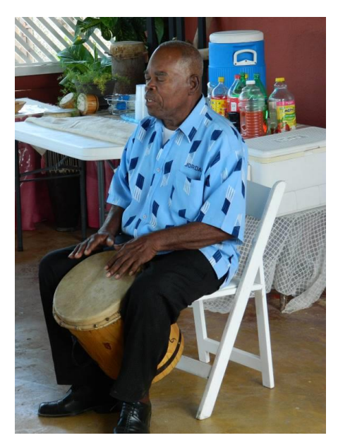
Figure 8: Traditional Tambu practitioner demonstrating 'drumming for rain' ( Museo di TAmabu Shon Cola )