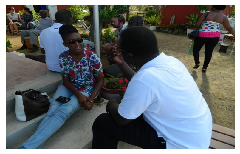
Figure 6: Participants utilising various documenting skills in interviewing practitioners, inventory workshop