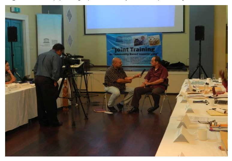
Figure 2: Documenting a benta musician as part of training activities, inventory workshop, Curaçao