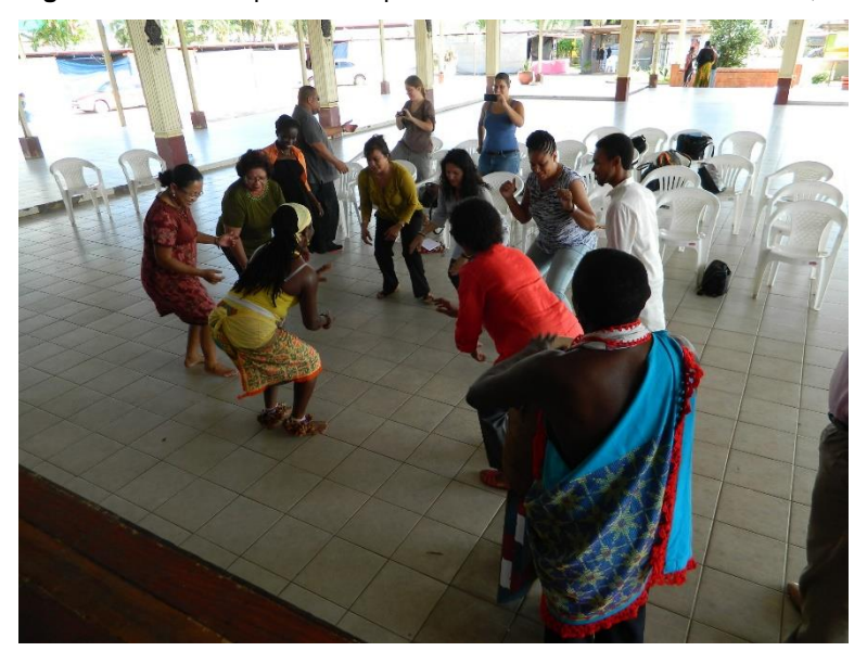
Figure 12: Participants learning the awasa dance of purity done by female Maroons, Suriname