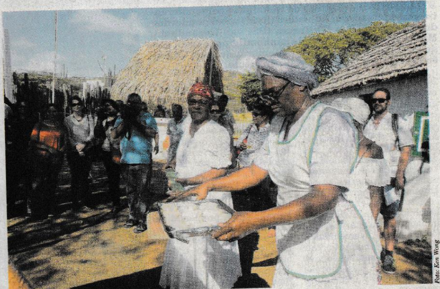
De delegatie trok onder meer naar het Tula Museum en naar Kas di Pal'i Maishi.