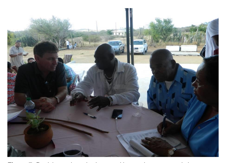
Figure 7: Participants interviewing practitioners, inventory workshop