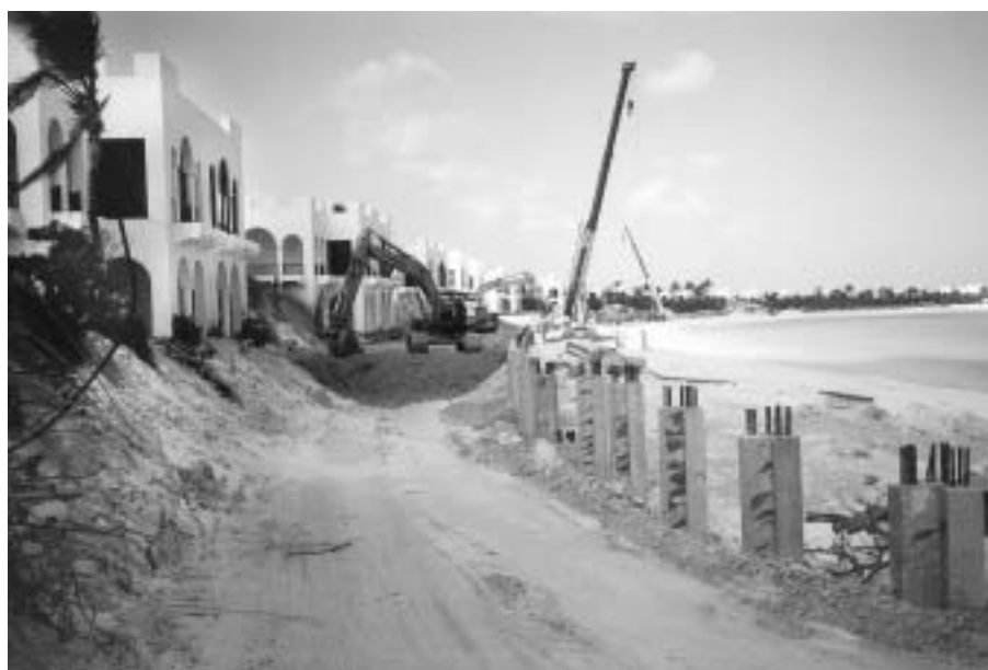
Photo 2. Seawall under construction, Maunday's Bay, Anguilla. September 2000.

Awareness about beach changes, hurricane impacts and coastal development is an area that needs continual emphasis as beachfront development continues in Anguilla. The narrow sandy barriers separating salt ponds from the sea are prime sites for development. During Hurricane Lenny many of these barriers were breached illustrating their fragility, their vulnerability and their unsuitability for permanent buildings.