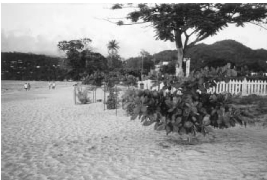
Photo 6. Replanting efforts at Grand Anse, Grenada. September 2001.

Responding to this concern, a visit was made to Grenada two weeks after Hurricane Lenny to assess the damage and make recommendations for rehabilitation. (This visit was funded by the CDB-UNESCO project and the Organization of American States.) Following several meetings, a report was produced (Cambers 1999a) advising the Grenadian authorities not to rush to construct remedial structures, but rather to wait for natural beach recovery. After the visit, a committee was organized comprising the Board of Tourism, the Forestry Department, the NSTC, the Organization of American States, several hoteliers and others, to implement the recommendations of the report which included a beach planting programme and the removal of certain damaged structures. As predicted, the beach recovered following the hurricane; this can be seen visually and in the monitoring data, although more time will be required to determine whether the beach fully recovers to its pre-hurricane size.