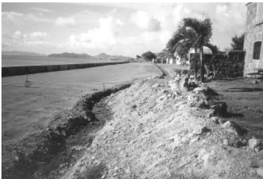
Photo 8. Reclaimed land at Charlestown, Nevis. September 2000.

base have also been installed at the Department of Planning and Development and two persons there trained in its use.