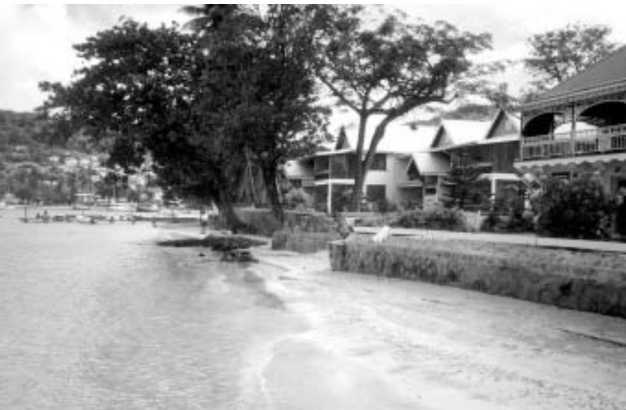
Photo 11. Retaining wall, Port Elizabeth, Bequia, St Vincent and the Grenadines. November 2000.

Another coastal problem in St Lucia relates to beach sand mining, which again has become a serious issue. Sand mining is under the jurisdiction of the Ministry of Communications and Works. Considerable efforts were made in the early 1990s to ensure that this Ministry was fully aware of the adverse impacts of beach sand mining. However, with a very high staff turnover at this Ministry, such efforts have to be continued, so that the impacts of activities such as sand extraction at river mouths are fully understood and remedied.