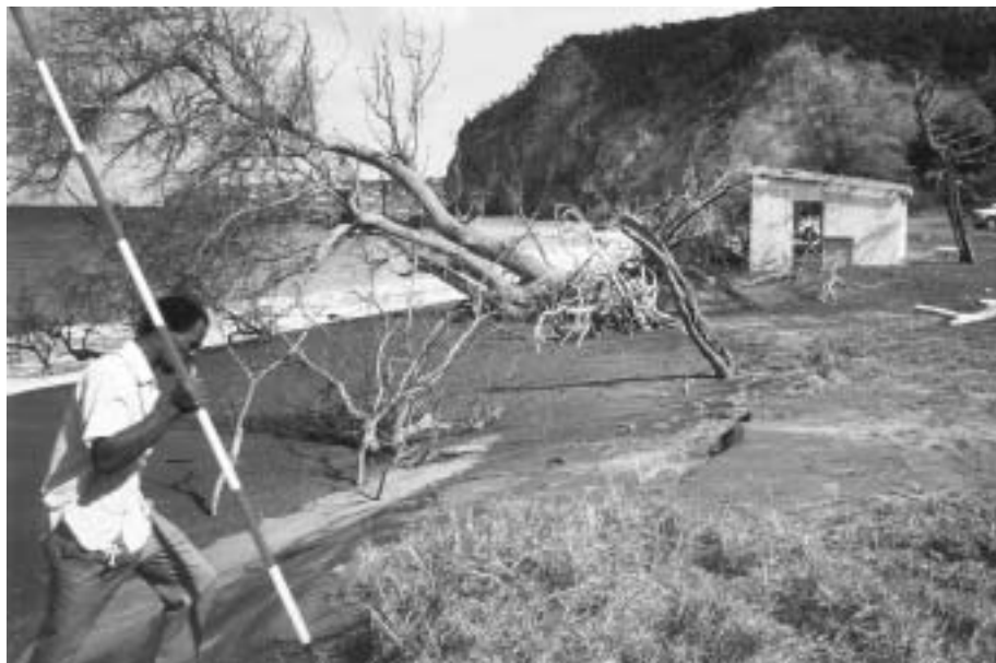
Photo 7. Foxes Bay, Montserrat, one month after Hurricane Lenny. December 1999.

The beach-monitoring database was used by the Physical Planning Unit during the period 1992–1995, when a programme was established to stop the mining of beach sand at all beaches except Farms Bay, and to use quarry sand for all construction purposes except the final plastering/finishing of buildings. 6 However, due to the