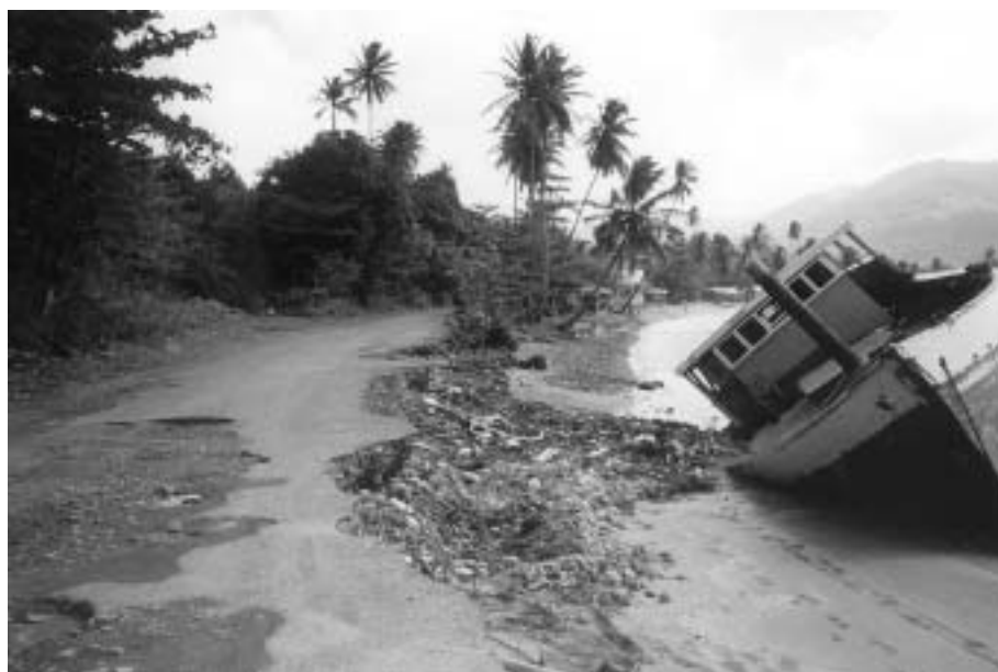
Photo 5. Evidence of the ravages of recent hurricanes, Prince Rupert Bay, Dominica. February 2000.

petent in the use of the 'Beach Profile Analysis' programme and two will require further training. The software and database were also demonstrated to officers from the Physical Planning Unit, who readily perceived its relevance