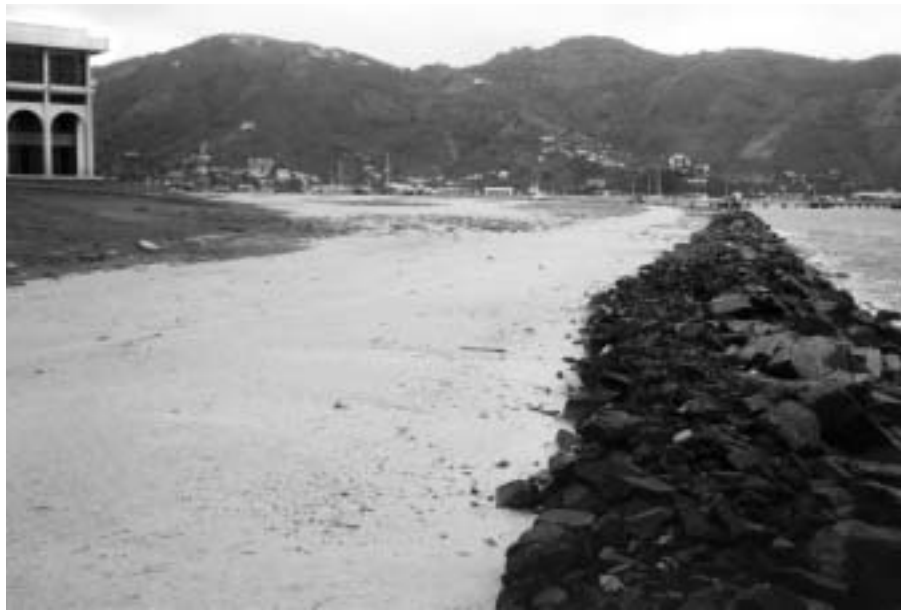
Photo 4. Rock revetment protecting the Government Administration Building, Road Town, Tortola, British Virgin Islands. May 1998.

tion and assessment of new structural developments, changing beach uses, restriction of beach access, nature of beach dynamics etc. So officers involved in monitoring become knowledgeable about all aspects of their island's beaches and can