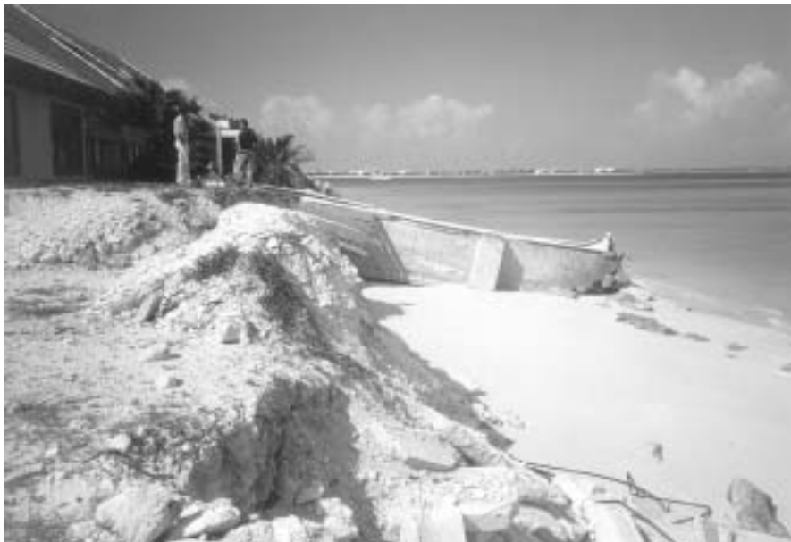
Photo 12. Collapsed pool deck, Pelican Beach, Providenciales, Turks and Caicos Islands. July 2001.

Monitoring was started in the Turks and Caicos Islands in 1995 (in Grand Turk and Providenciales); however, the activity has not been continued and only two data sets exist (one set for 1995 and one set for 1997). As a result of