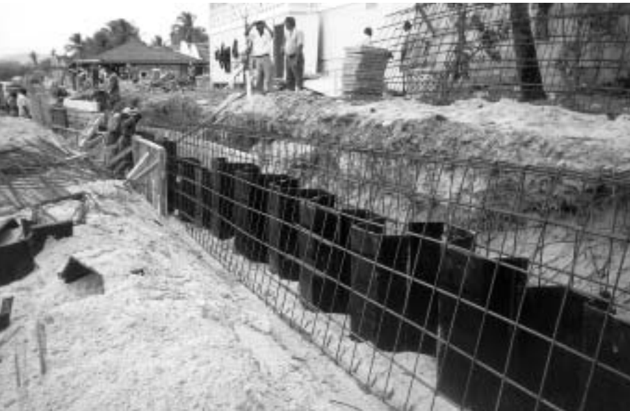
Photo 10. Seawall under construction, Reduit Beach, St Lucia. April 2000.