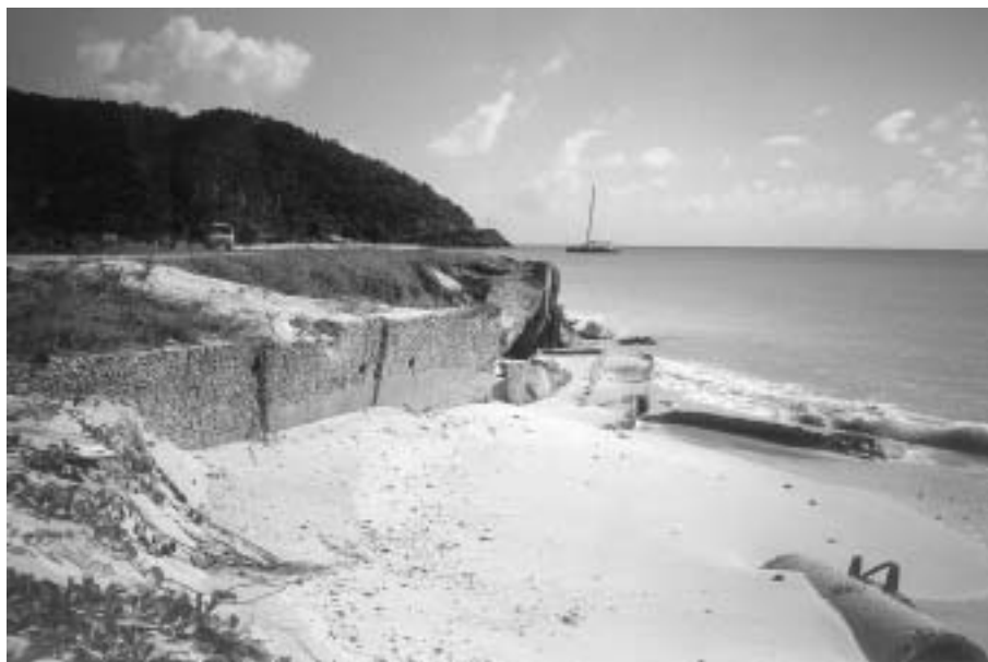
Photo 3. Undermined roadway, Darkwood Beach, Antigua. November 2000.