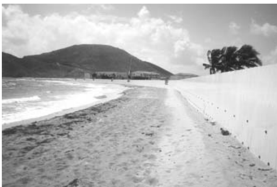
Photo 9. Seawall at North Frigate Bay, St Kitts. February 2000.

The main partner agency in St Lucia is the Department of Fisheries (DF). This agency has been monitoring several beaches in St Lucia since 1990 with the assistance of various NGOs, e.g. the Soufriere Marine Management Area and the St Lucia National Trust. However, it is very difficult to get sustained assistance from other agencies, and the data received is often not continuous and/or unreliable. The officer in charge of the monitoring programme was away on study leave (from the end of 1999 until the end of 2000), so during this period, monitoring ceased. However, the monitoring has since restarted from the beginning of 2001. During this CDB-UNESCO project, the 'Beach Profile Analysis' programme was installed on computer at the DF and demonstrated to two other officers from the Department. The beach-monitoring database dates back to 1990. A second beach-monitoring database, focusing only on the northwest coast, was established as one of the activities of the Northwest Coastal Conservation Project (Phase 2). Three years data were collected by this project, which terminated