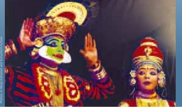
The Kutiyattam Sanskrit Theatre. Masterpiece proclaimed in 2001. Renowned for its striking facial expressions and gestures, the Kutiyattam has survived as India's oldest living theatrical tradition. This blend of Sanskrit texts (left) and local customs is performed in Hindu temples in the southernmost Kerala province.