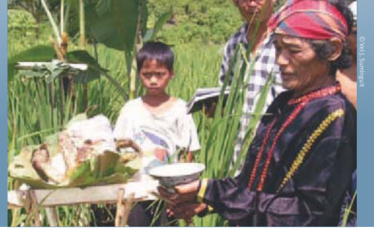
(Top) A Subanen man (Philippines) performing a ritual before entering a site, asking permission from the Unseen for documentation.