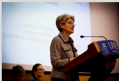
Irina Bokova, Director-General of UNESCO, at the opening of the Second UNESCO Forum on GCED