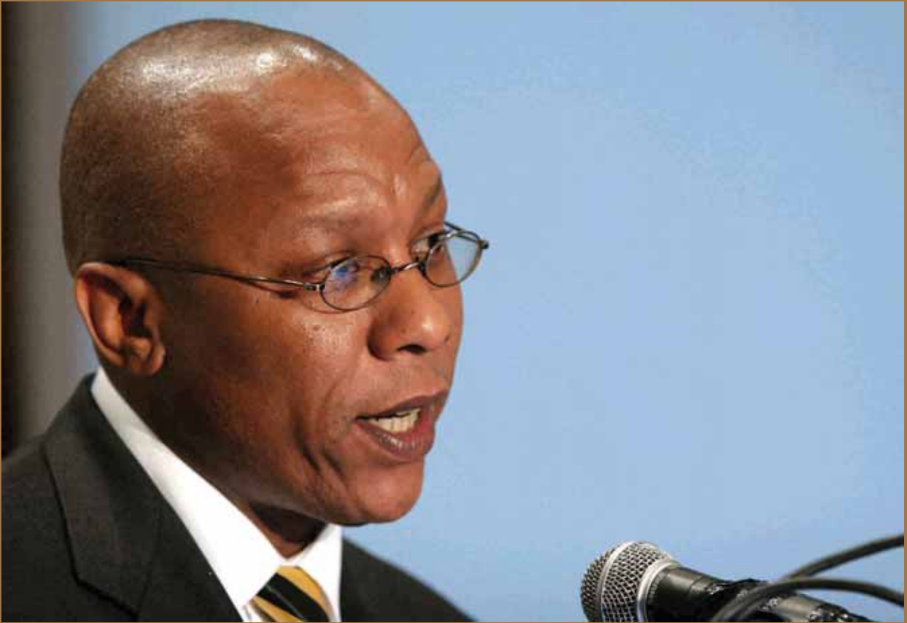
THEMBA WAKASHE, Deputy Director General, Heritage, Archives and Libraries at the Department of Arts and Culture, South Africa

"I am passionate about the African World Heritage Fund. It is living in the context of the renewal of the African continent, the African renaissance. Africa must take a lead in resolving challenges facing the continent. African leadership needs to be there. The AWHF has to be led by Africans and the solutions have to come from Africa.