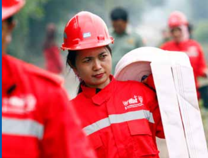
Firefighter during a fire drill in Garantung village, Palangkaraya (Indonesia)

Qualitative analyses show that women's involvement in the management of water resources and water infrastructure can improve efficiency and increase outputs