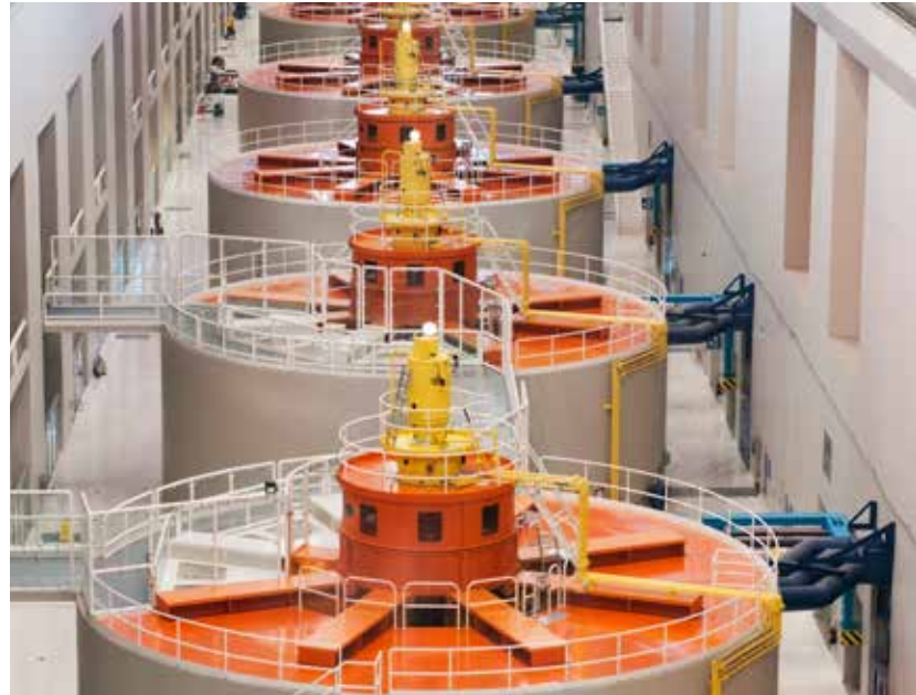
Hydroelectric power generators

Industry is an important source of decent employment worldwide and account for a fifth of the world's workforce. Industry and manufacturing account for approximately 4% of global water withdrawals and it has been predicted that by 2050, manufacturing alone could increase its water use by 400%. As industrial technology and understanding of the essential role of water in the economy and of the environmental stresses placed upon the resource improve, industry is taking measures to reduce its water use per unit produced, thereby improving industrial water productivity. Increased attention is being directed to water quality, particularly downstream. Industry is also putting efforts to reuse and recycle water, matching water quality to use and moving towards cleaner production, with possible benefits in terms of better paid jobs (for more highly trained employees) within industry as well as treatment equipment suppliers.