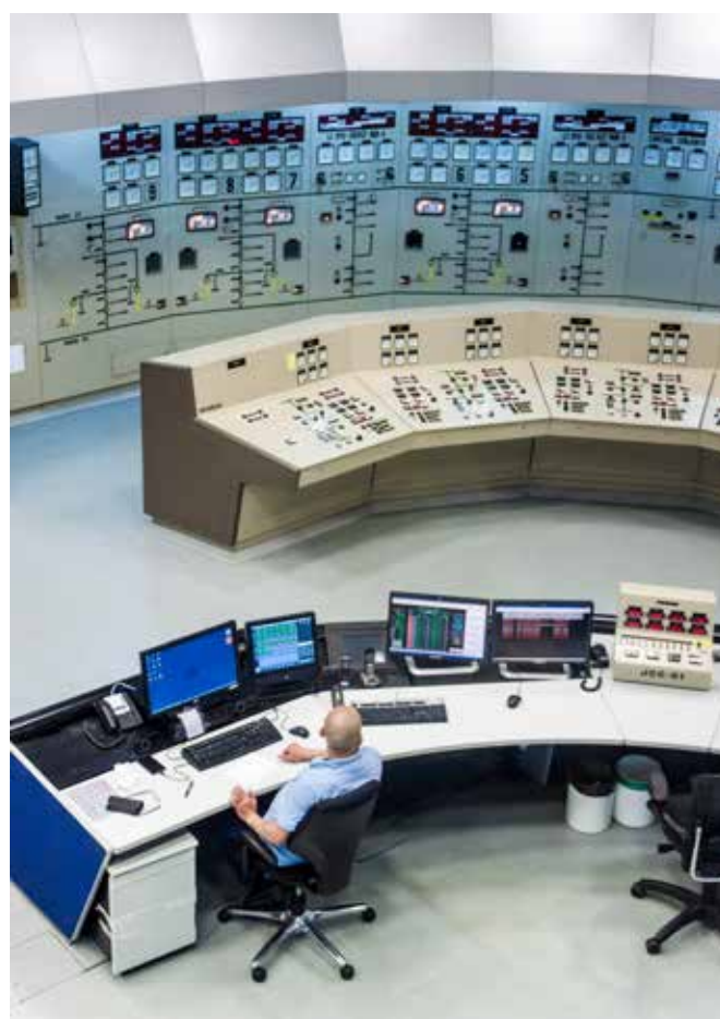
Command room of hydroelectric energy plant

It is essential to plan water investments in conjunction with relevant sectors, such as agriculture, energy and industry in order to maximize positive economic and employment results. Within a suitable regulatory framework, public-private partnerships (PPPs) offer prospects for much needed investment in water sectors, including building and operating infrastructure for irrigation and water supply, distribution and treatment. With a view to promoting economic growth, poverty reduction and environmental sustainability, consideration must be given to methods that mitigate job loss or displacement and maximize job creation that may result from the implementation of an integrated approach to water management.