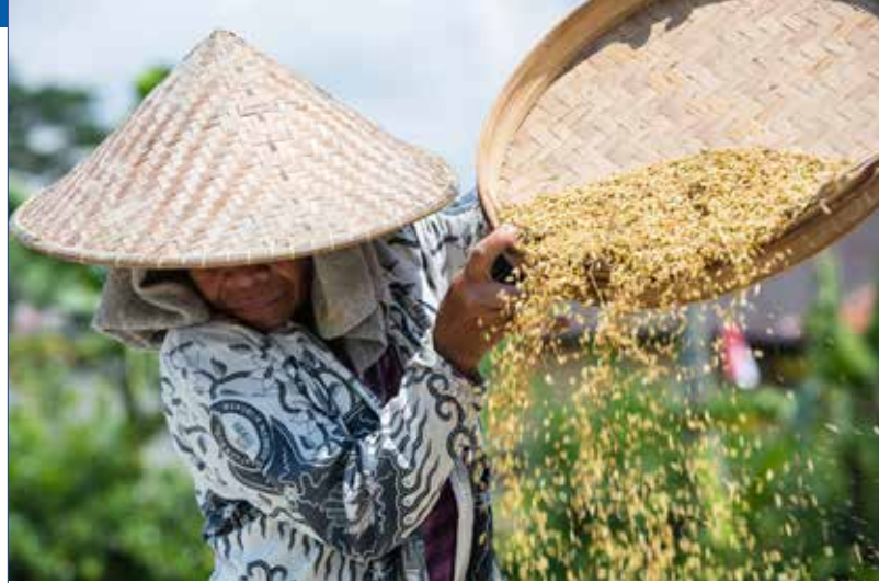
Rice farmer in Ubud, Bali (Indonesia)

In essence, 78% of jobs constituting the global workforce are dependent on water.