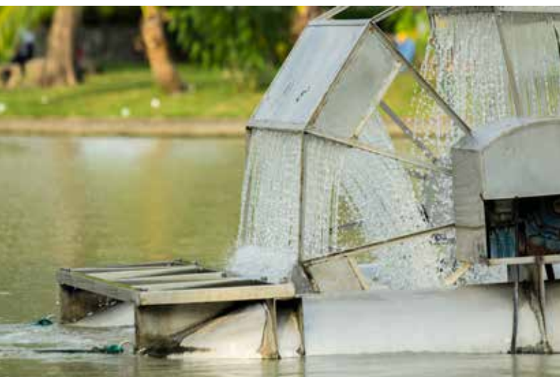
Chaipattana water turbine in public park (Thailand)

The demand for energy is increasing, particularly for electricity in developing and emerging economies. The energy sector, with growing water withdrawal that currently accounts for about 15% of the world's total, provides direct employment. Energy production, as a requirement for development, enables direct and indirect job creation across all economic sectors. Growth in the renewable energy sector leads to growth in the number of green and non-water-dependent jobs.