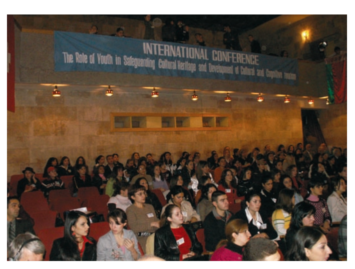
Conference "The Role of Youth in Safeguarding of the Heritage and Development of Cultural Tourism", 2006