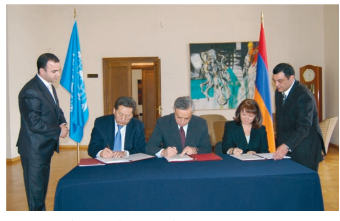
Ceremony of signing the UCPD for Armenia, Yerevan, 20 March 2008

In October 2006 the Office organised a fact finding mission to Armenia in order to assess the potential