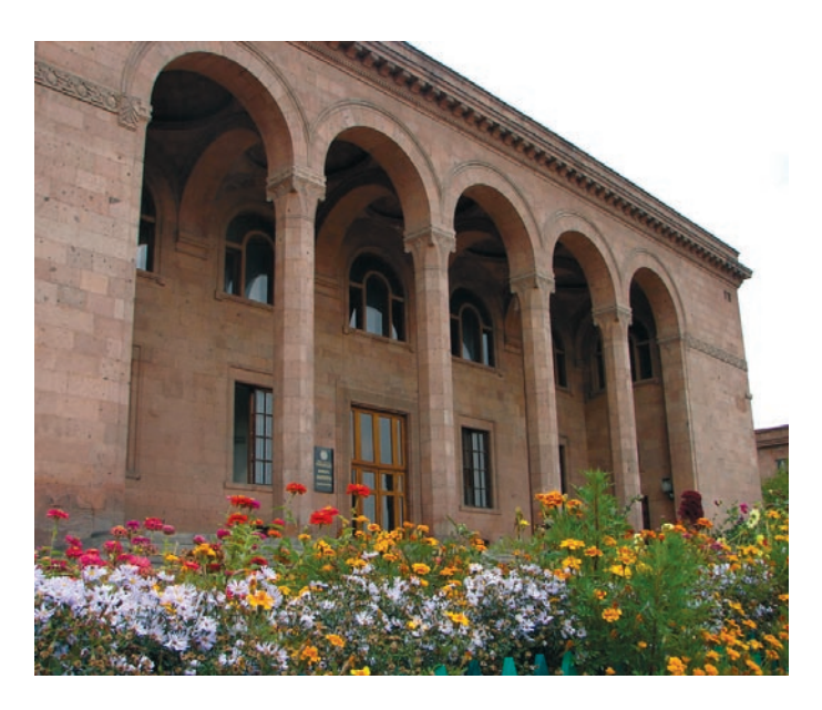
National Academy of Sciences of Armenia

Within the UNDAF, the UNESCO MOS will focus, in particular, on addressing on-ground implementation of EFA, UN Decade of Education for Sustainable Development, World Summit Outcomes and international development goals, including the Millennium Development Goals, within UNESCO's mandate and comparative advantages, and on promoting country programme activities and the integration of UNESCO priorities into the UN programming framework at the country level.