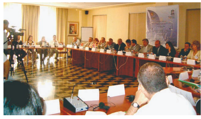
International Conference "Bioethics aspects of the Human rights in educational programmes", 2006

Promotion of the systematic and comprehensive ethics and human rights approach & UNESCO strategies' integration in policy and curriculum was the main theme of the International Conference