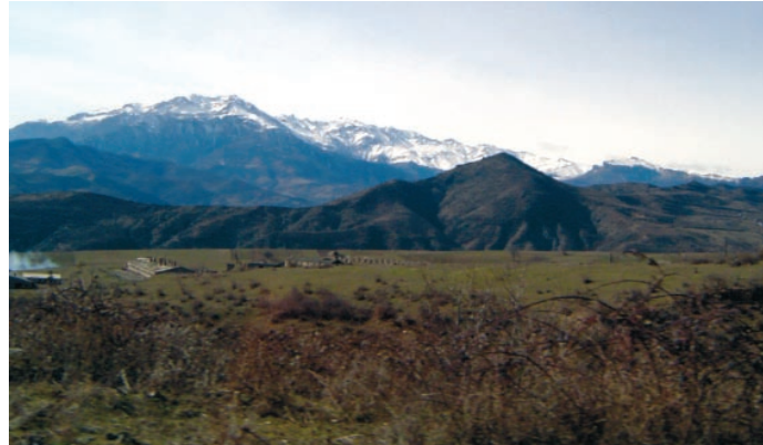
Towards the establishment of the first biosphere reserve in Armenia

for coordinating the contributions and activities of bilateral and multilateral donors. In 2004, in an effort to directly link the PRSP with the broader goal of reaching the international development goals, including the MDGs, the Government established a joint monitoring system for the PRSP and MDGs, which includes country specific MDG indicators. The PRSP revision process has started in 2006.