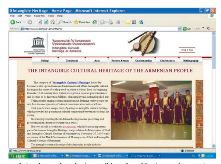
Website devoted to the intangible cultural heritage of Armenia

"Bioethics aspects of the Human rights in educational programmes" held in 2006. It assisted to attract a public attention in the RA to bioethics as a new interdisciplinary science and to its place in general system of human rights as well as promotion of the UNESCO Universal Declaration on Bioethics and Human Rights.