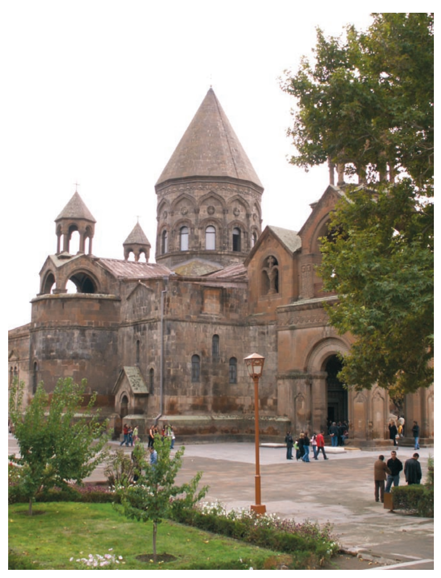
World Heritage in Armenia: Mother Cathedral of Echmiatsin

a) Facilitated dialogue and cooperation between local authorities, civil society and the private sector in order to integrate environmental issues into local and national development agendas.