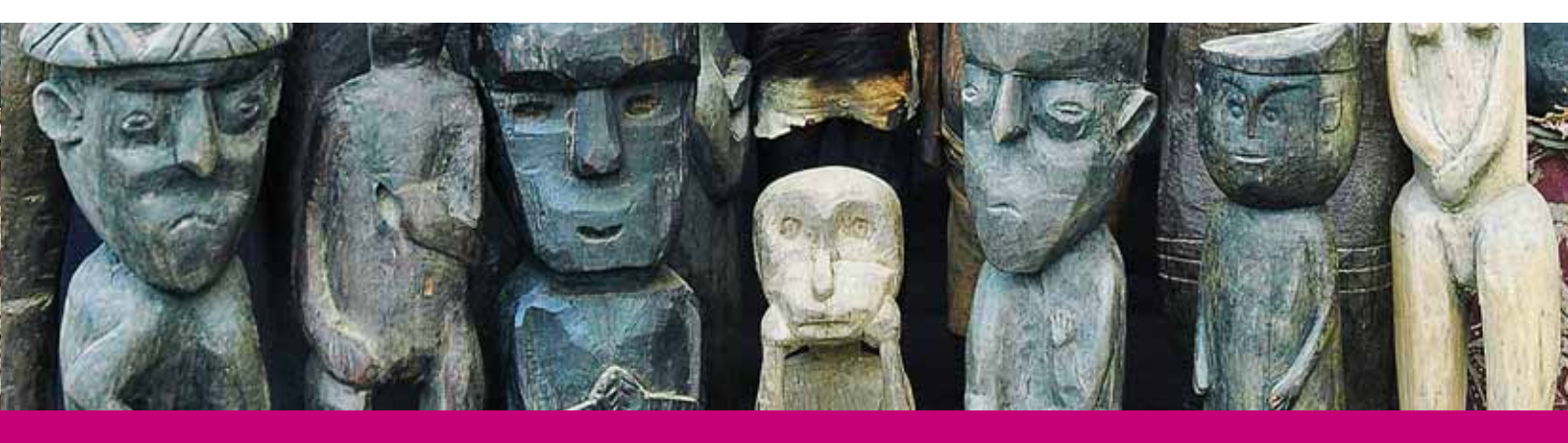
Photo documentation of traditional textiles (tais) and woodcarvings. This project, undertaken in 2007 with the Timor-Leste Photographers Association (TiLPA), aimed to preserve and promote these examples of Timor-Leste's cultural heritage by documenting and showcasing them on posters, calendars, postcards and banners.