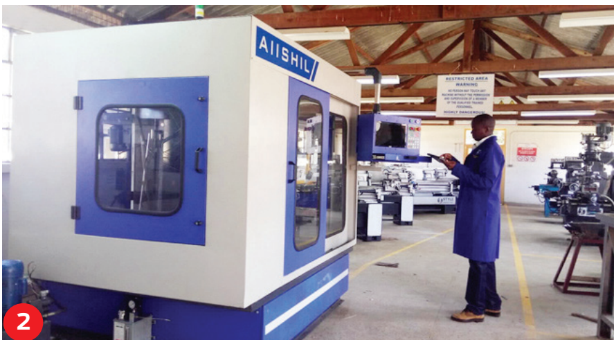
2. A technician tries out the latest state of the art computerized CNC machine used for training in the mechanical engineering workshop at RVTTI.