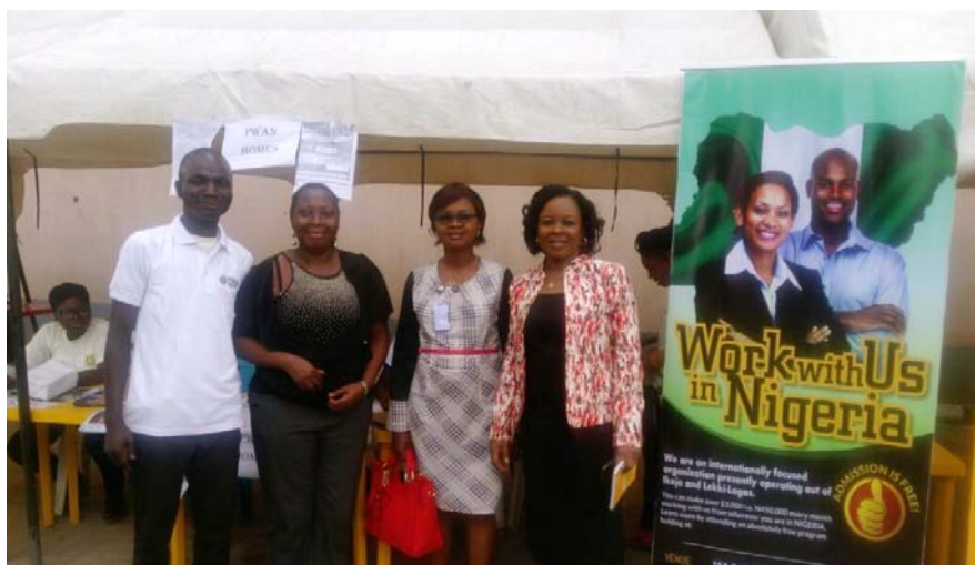
Pix – Exhibition by invited Companies/Organizations