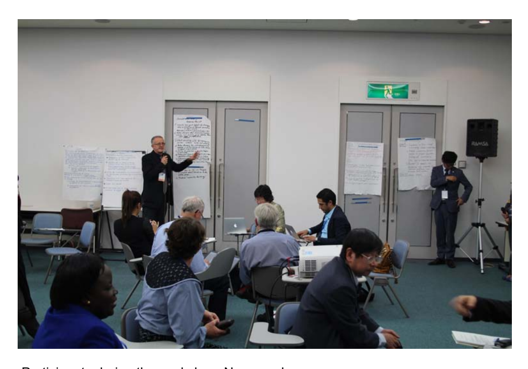
Participants during the workshop, Nagoya, Japan

However, it was found that the current education systems do not dedicate due importance to the resource. In fact, the beginning of agriculture, and indeed evolution, was closely tied to water. There are successful examples of co-management of the resource through customary law, in places where it is scarce (such as semi-desert oasis locations in North Africa), illustrating the importance of cooperation to achieve a sustainable use of the resource. This approach, however, does not work in modern states, where economic issues, elites, power gradients and external policies define how water is supplied, distributed and managed, all of which can also result in conflict.