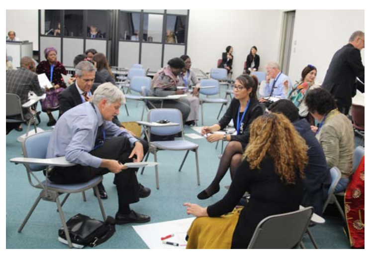
Participants at the workshop, Nagoya, Japan

This is true especially regarding the rural-urban flows which place urban infrastructures under strain.