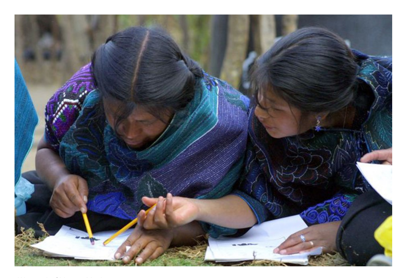
Women in Chiapas, Mexico

The GAP on ESD has five priority areas: (1) advancing policy to mainstream ESD into both education and sustainable development practices; (2) transforming learning and training environments to integrate sustainability principles into their settings; (3) building capacities of educators and trainers to more effectively deliver ESD; (4) empowering and mobilizing youth to act for sustainable development and disseminate practices that sustain ESD; and (5) accelerating sustainable solutions at the local level, engaging communities, stakeholders and media professionals. These priority areas were central to the structure and development of the workshop "Water Education and Capacity Building: Key for Water Security and Sustainable Development".