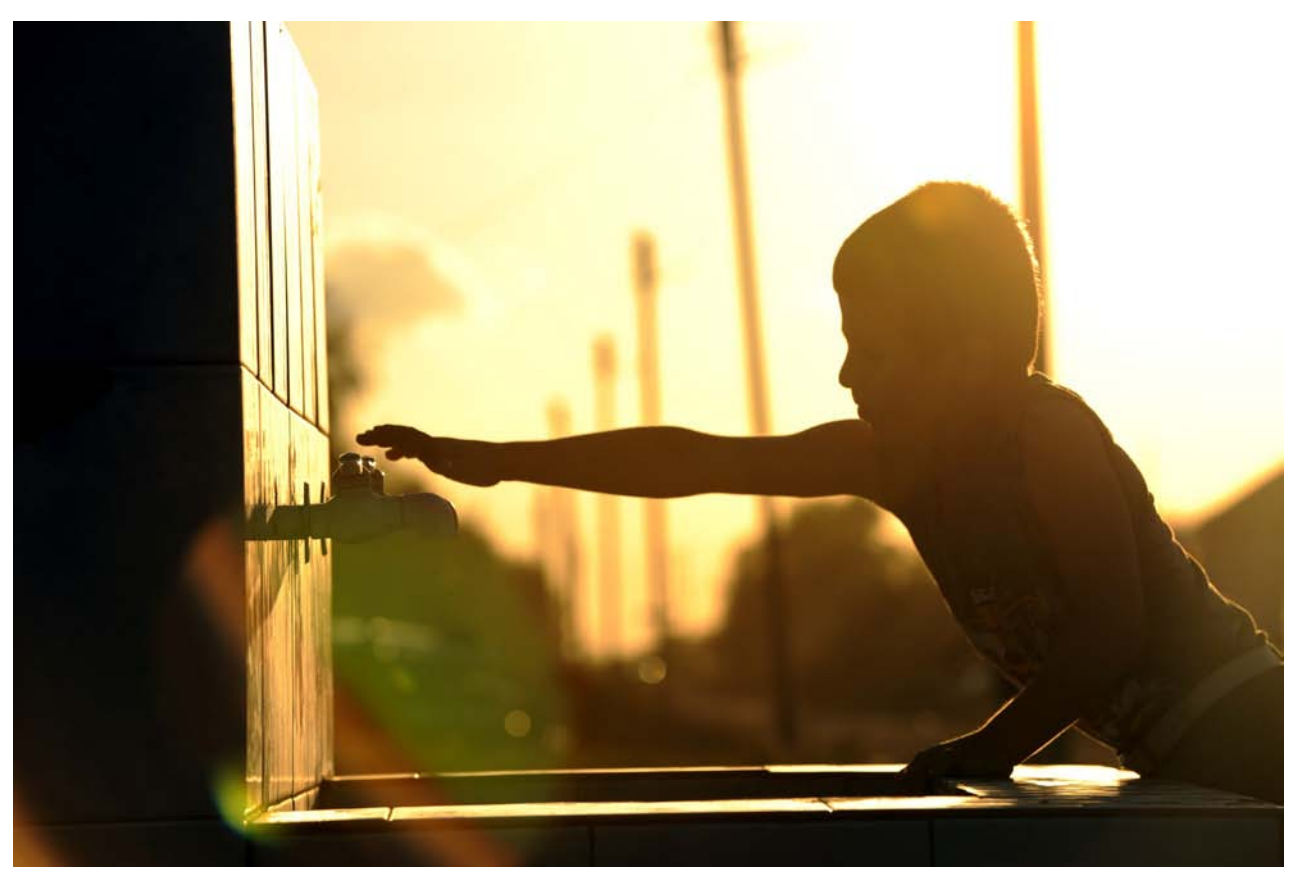
Water and sanitation services to rural parts of Azerbaijan