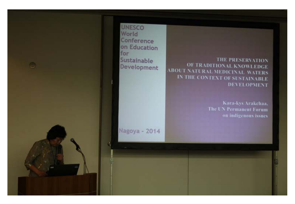
Presentation on the importance of considering indigenous knowledge in water education, Nagoya, Japan

Other suggestions were given, such as creating economic incentives to decrease the consumption of energy and water. For example, higher taxes could be charged on the consumption of energy at night, so people see in numbers and money the impact of their standards on the use of resources. Though this method is less successful in raising one's awareness of the importance of acting sustainably, it can be a successful starting measure that will initially change the way people act and cause positive change. Awareness, values and knowledge can then follow.