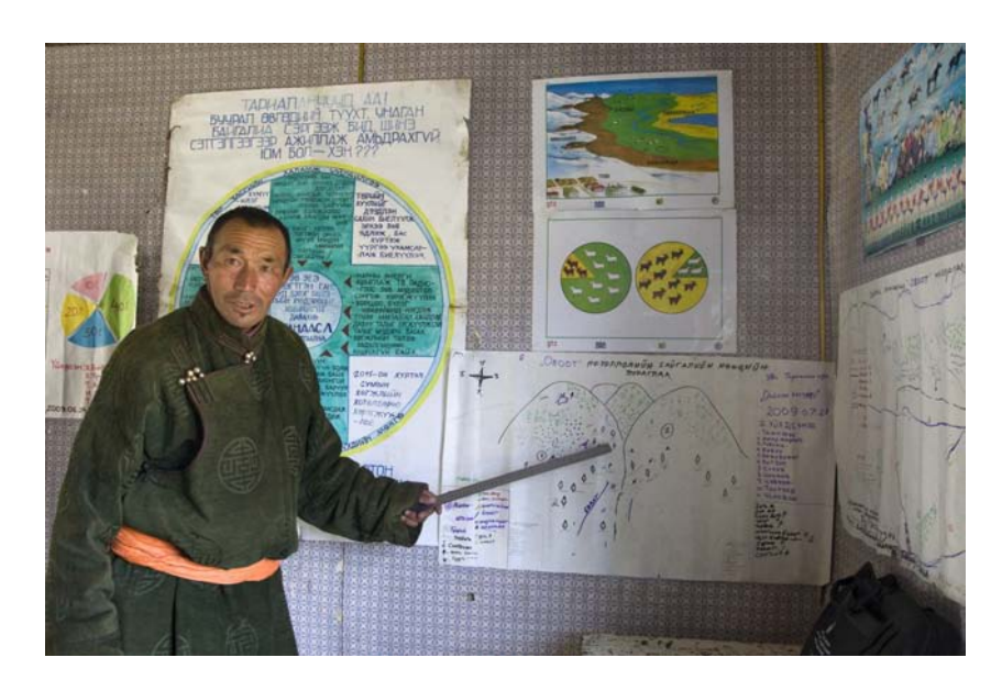
Mongolian Herders Practice Sustainable Resource Management

As part of the preparations for the GAP, the UNESCO World Conference on Education for Sustainable Development was held from 10 to 12 November 2014 in Aichi-Nagoya, Japan. Among its objectives, the conference aimed to assess the current status of ESD and discuss future actions, which address the priority action areas of the GAP. In the case of water, the GAP priority action areas are interconnected with the objectives of the eighth phase of the International Hydrological Programme (IHP-VIII, 2014-2021), targeted at improving water security in response to local, regional, and global challenges. The current report is based on the main outcomes of the Conference workshop on "Water Education and Capacity Building: Key for Water Security and Sustainable Development" coordinated by the UNESCO International Hydrological Programme (IHP) and the UNESCO Chair on Water, Women and Decision-making in Morocco. The conclusions of these processes, several of which are shared in this publication, can provide a valuable perspective on how to advance water education and capacity building as critical instruments to reach water security and sustainable development.