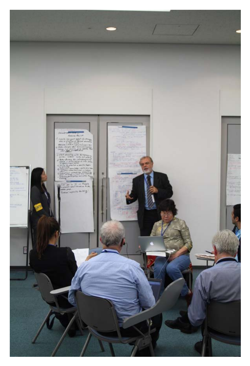
Roundtables on Water Education, Nagoya, Japan