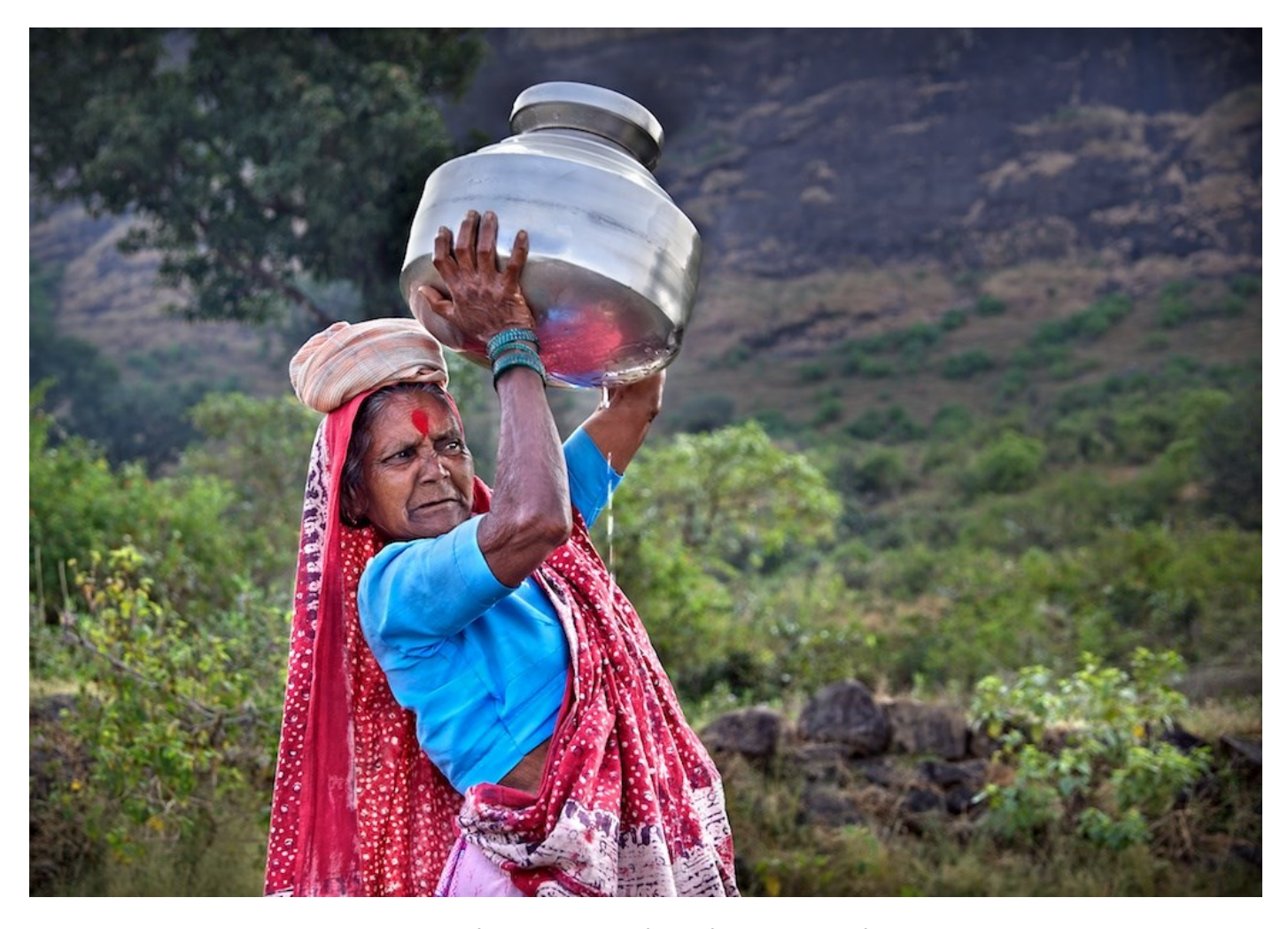
Methgharkila village, Maharashtra, India. Relief is coming in the form of a water tower for the village.

The GAP is global and multidisciplinary in nature, aiming to include all sorts of stakeholders, regardless of their influence or power. It is our best plan of action to conduct the desirable systemic changes necessary to build the future we want.