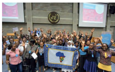
Young reporters and producers from local radio stations celebrate the World Radio Day at the UN Office in Nairobi

13 February 2015, Nairobi – UNESCO partnered with Media Council of Kenya (MCK), United Nation Information Centre (UNIC) and Kenya Broadcasting Corporation (KBC) to mark the World Radio Day 2015 celebrations at the United Nations Complex in Nairobi, Kenya, themed "Youth and Media". The 2-day event aimed at increasing the level of participation of young people in radio taking into account media ethics as producers of radio contents with media literacy skills and mobilizing and encouraging main stream media and community radios to promote access to information, freedom of expression and youth empowerment through their programs.