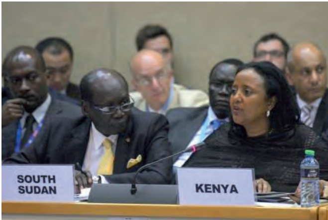
Amina Mohamed, Kenya Cabinet Secretary for Foreign Affairs addresses the Member States on Kenya’s effort in working with the international community to take measures to improve the humanitarian condition in South Sudan

“We need to ensure that our humanitarian groups on the ground are able to move. Since the onset of the conflict the situation has worsened. What we saw during our visit to the region was devastation and destruction as well as a desperate need for food, water, education and health care.” - Valerie Amos, UN Under-Secretary-General for Humanitarian Affairs and Emergency Relief Coordinator