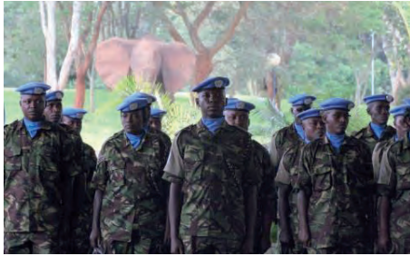
UN Peacekeepers from Kenya Defense Force at the UN compound in Nairobi pay tribute to those who continue to serve as peacekeepers around the world