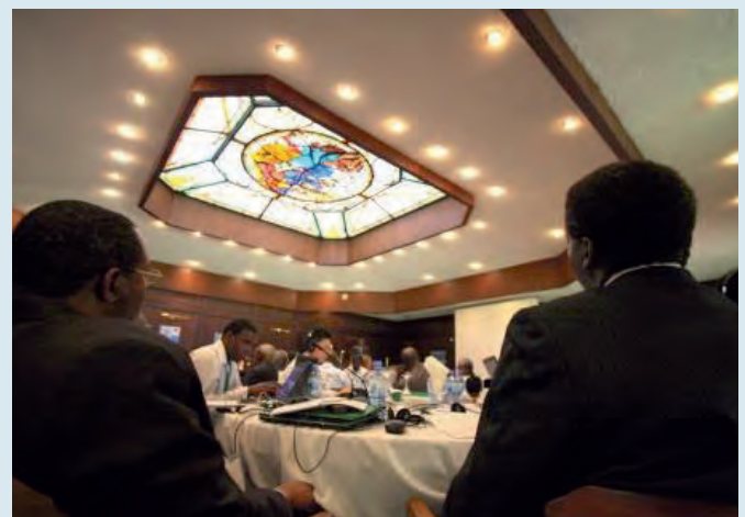
Participants discuss the work plan and prioritize activities on ocean and coastal management issues @Masakazu Shibata