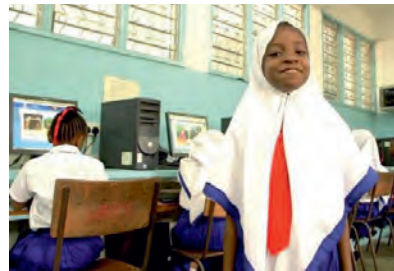
ICTs in education promoted in East Africa among young girls through the uptake of Women in African History: An E-Learning Tool

13 February 2015, Kigali — The Sub-Saharan Africa Regional Ministerial Conference on Education Post-2015 took place on 9-11 February 2015 in Kigali, Rwanda. The conference provided an opportunity to review and assess progress made in attaining the Education for All (EFA) goals set in 2000. The aim was to prepare an African vision for the post-2015 education agenda. On top of that, the conference was also meant to define the education needs, obstacles, and priorities in the region to develop recommendations for the World Education Forum.