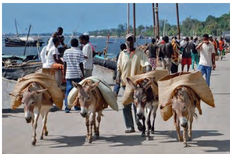
Lamu is the only one of the Swahili settlements and seaports that has constantly been inhabited for over 700 years.

UNESCO together with partners, supports the identification, protection and preservation of cultural heritage around the world considered to be of outstanding value to humanity.