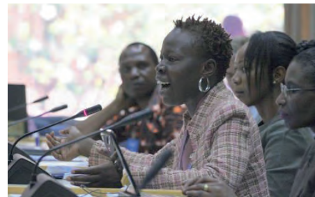
Panelists and students engage in discussion on existing laws, protocols and conventions combating modern forms of slavery, as this topic remains a taboo for the majority of the people in the Kenyan society.

23 March 2015, Nairobi - The 2015 theme for the International Day of Remembrance of the Victims of Slavery and the Transatlantic Slave Trade, "Women and Slavery" is aimed at: paying tribute to the many enslaved women who endured unbearable hardships from forced labour to sexual exploitation; paying tribute to those who fought for freedom from slavery and advocated for its abolition; to celebrate the strength of enslaved women, many of whom succeeded in transmitting their African culture to their descendants despite the many abuses that they endured.