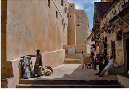
Lamu Fort was built between 1813 and 1821 providing a base from when the Omanis consolidated their control of the East African coast. Today it houses an environmental museum and a library, and is often used for community events.

A crossroad of Bantu, Arabic, Persian, Indian and European Cultures