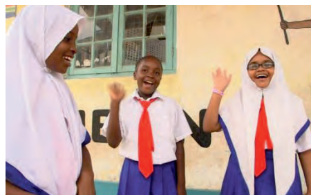
ICTs in education promoted in East Africa among young girls through the uptake of "Women in African History: An e-learning tool"

24 April 2015, Addis Ababa – In support of Girls in ICT day, UNESCO is rolling out its 2014 Gem-Tech award winning Open Educational Resource "Women in African History: An E-Learning Tool" across East Africa in partnership with Camara Education. The tool is an interoperable internet platform that consists of multimedia content and promotes the ICT competencies of young girls. It also represents a crucial step to expand and disseminate knowledge of the role of women in African history to counter prejudices and stereotypes.