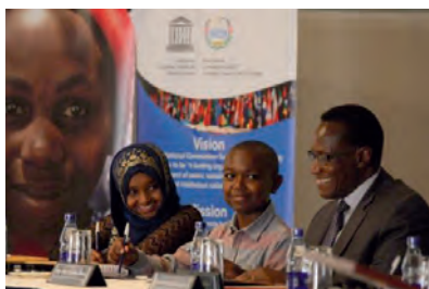
Prof. Jacob Kaimenyi, Cabinet Secretary, Ministry of Education, Science and Technology discuss issues on quality and equity in education with selected students at EFA GMR launch in Kenya.