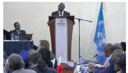
Hon. William Ruto, Kenya's Deputy President at the Opening Ceremony, assures Kenya's commitment to continue its collaboration with neighboring countries to address the problems of poverty, inequalities and related issues