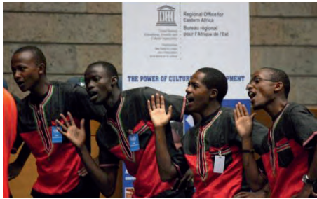
UNESCO Youth Group Choir performs at the UN Office in Nairobi for the World Day for Cultural Diversity celebration

19 May 2015, Nairobi – A Roundtable calling for further dialogue on Culture and Development and the mainstreaming of culture in national policy frameworks within the context of the Post-2015 Development Agenda took place on the occasion of the World Day for Cultural Diversity for Dialogue and Development at United National Office in Nairobi. The event was organized by UNESCO, in collaboration with the Kenyan National Commission for UNESCO, and the United Nations Information Centre (UNIC). More than 100 people from the heritage and cultural industry sector across Kenya participated in the Round Table. Participants included government officials from both central and county governments, cultural experts, academia, artists, creators/producers/practitioners, media and civil society organizations.