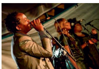
Above: Eric Wainaina, a popular singer-song writer, described jazz as a medium that allows him to communicate and investigate people's feelings on day-to-day issues