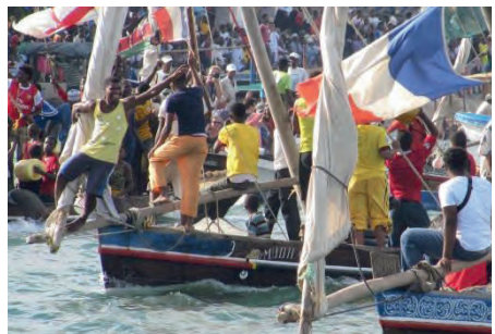
Dhow is commonly used in Lamu. In order to preserve and encourage the art of dhow sailing, the town's finest dhows are selected to compete, and race under sail through a complicated series of buoys, combining speed with elaborate tacking and maneuvering skill during Lamu Cultural Festival.