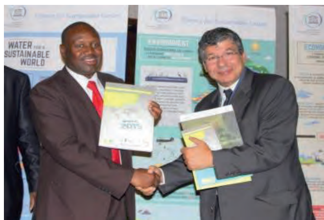
Participants share ideas related to sustainable water management issues during the discussion