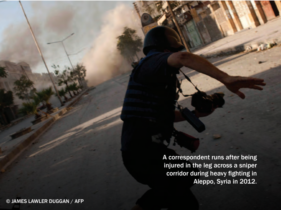
A correspondent runs after being injured in the leg across a sniper corridor during heavy fighting in Aleppo, Syria in 2012.