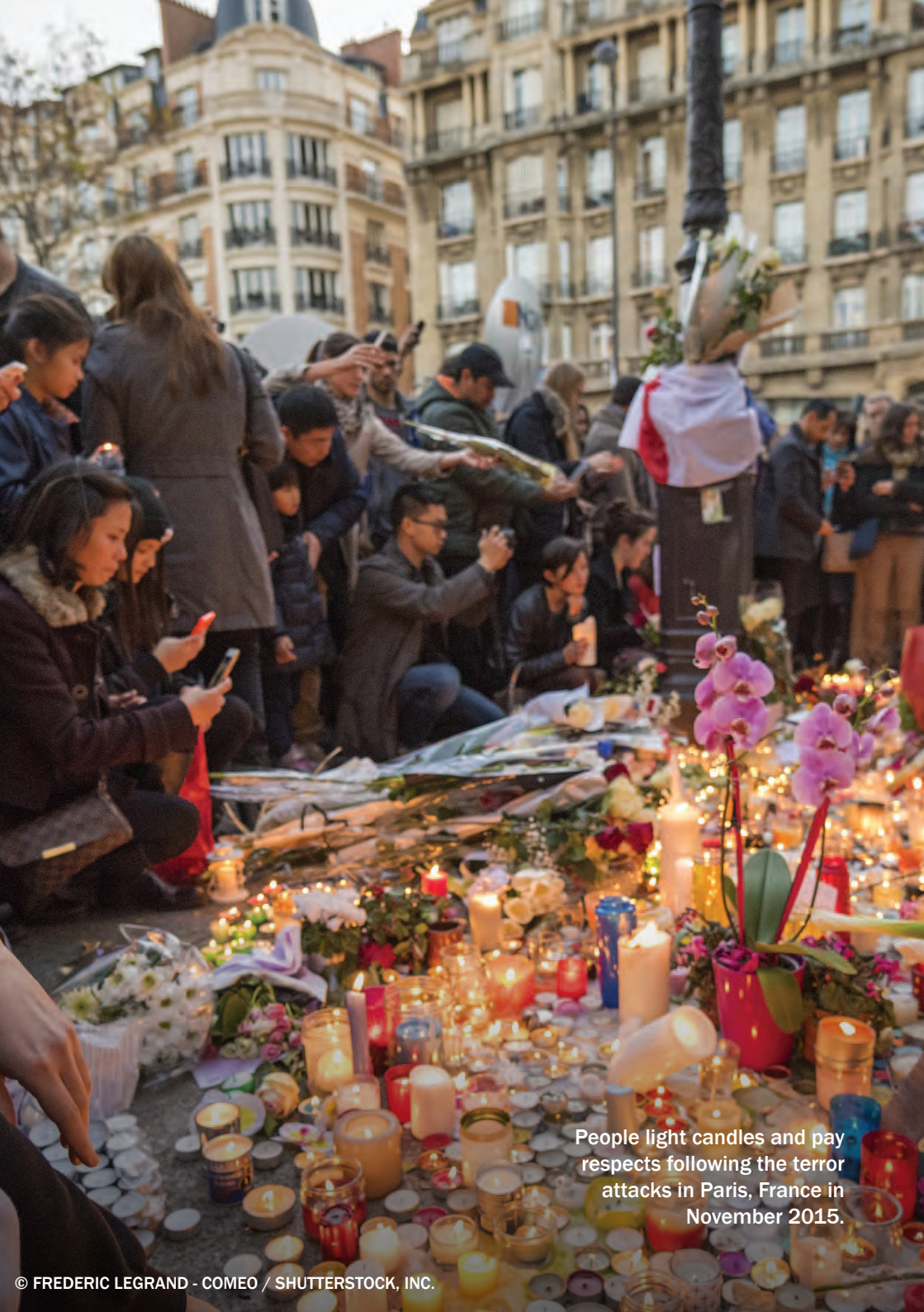
People light candles and pay respects following the terror attacks in Paris, France in November 2015.