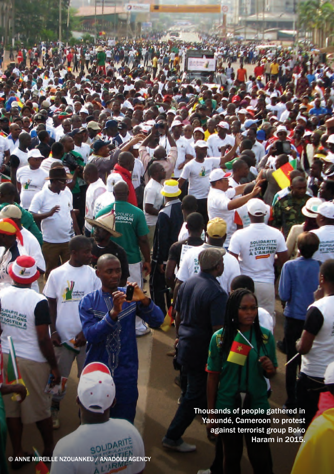
Thousands of people gathered in Yaoundé, Cameroon to protest against terrorist group Boko Haram in 2015.