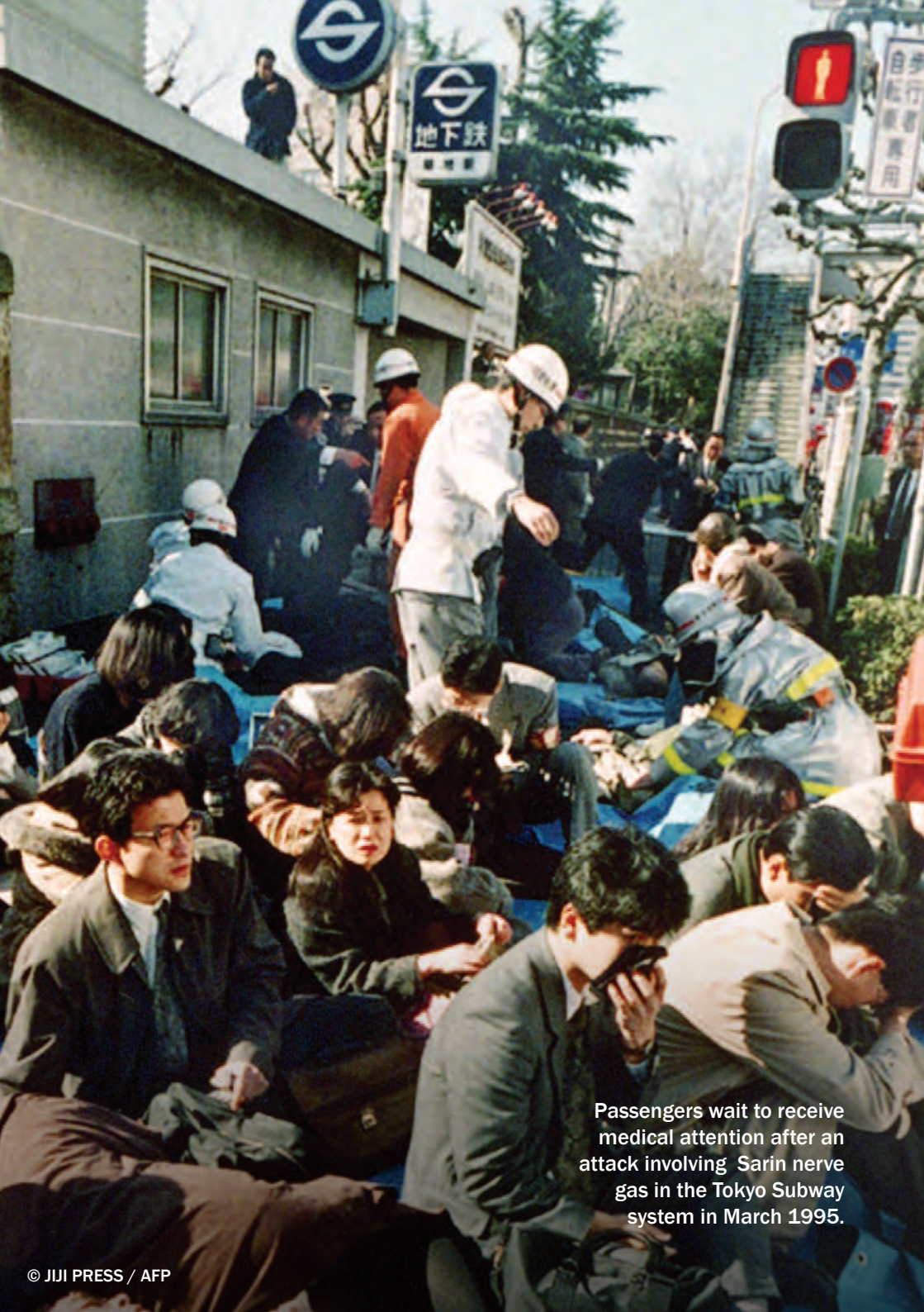
Passengers wait to receive medical attention after an attack involving Sarin nerve gas in the Tokyo Subway system in March 1995.