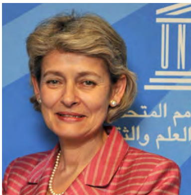
by Irina Bokova , Director-General of UNESCO

UNESCO is the United Nations agency mandated to promote physical education and sport through concerted, collaborative and participatory action to support the rounded development of every individual.