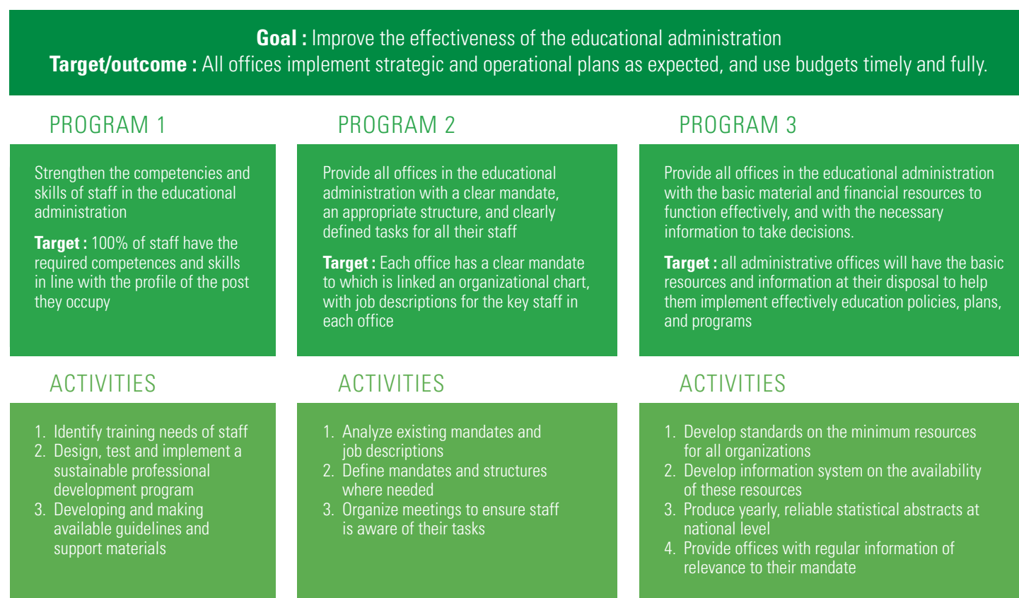
FIGURE 3. PROGRAM ON EFFECTIVENESS OF ADMINISTRATION

Figure 3 partially illustrates how activities link to programs to help achieve a goal. The example assumes a country where significant efforts are needed to improve the effectiveness with which the education system is managed. The figure demonstrates how various programs are needed to achieve this overall goal. These programs link respectively to the competencies of the individual officers, the organization of the administration, and the resources that they have at their disposal. One particular difficulty with the design of such a program is that targets are hard to identify – firstly because issues such as ‘competencies’ or ‘clear mandates’ are not easily measurable, and secondly because information on such issues is not regularly collected. The implication is that, at times, new data will need to be collected during the plan’s implementation in order to focus on new priorities.