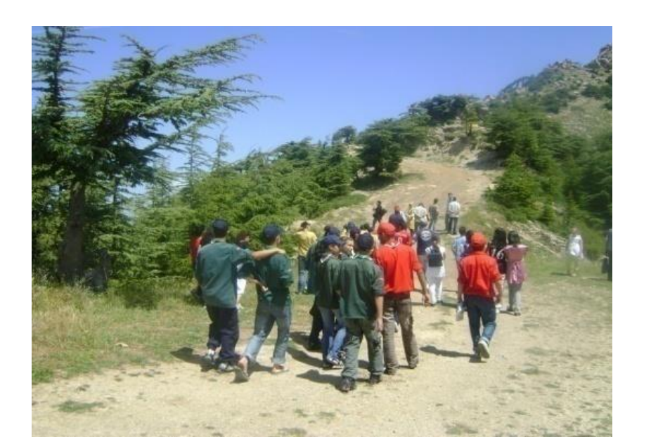
Djurdjura Biosphere Reserve