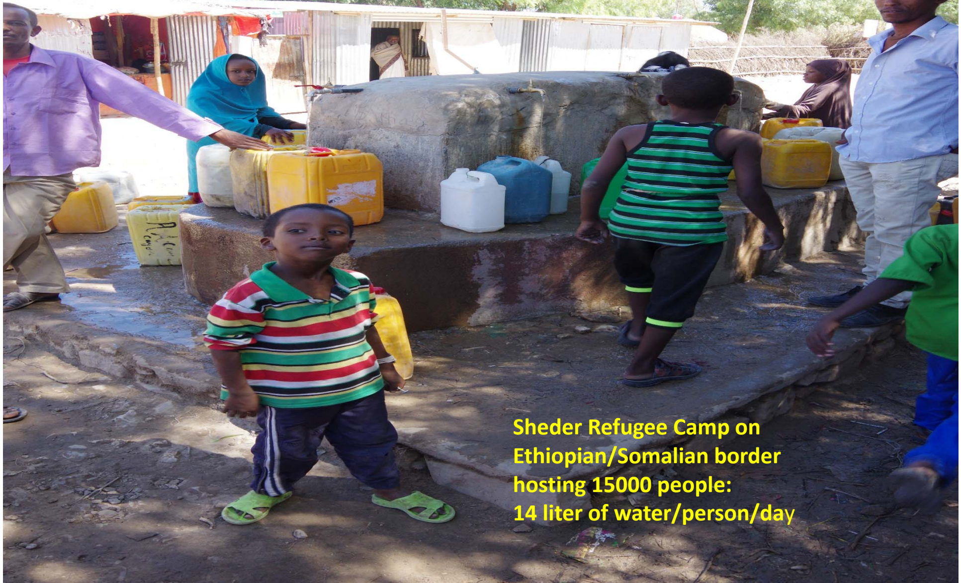
Sheder Refugee Camp on Ethiopian/Somalian border hosting 15000 people: 14 liter of water/person/day