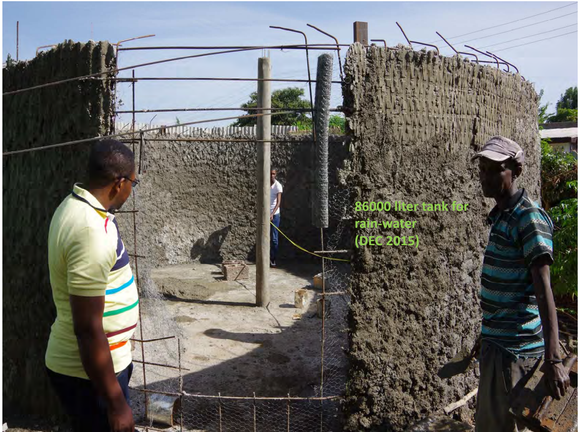
86000 liter tank for rain-water (DEC 2015)