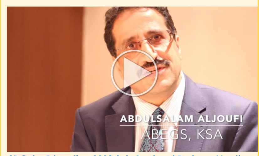
SDG 4 – Education 2030 Sub-Regional Partners Meeting Two GCC & Yemen partners meetings were convened to reach a common approach for SDG4 implementation. Read more