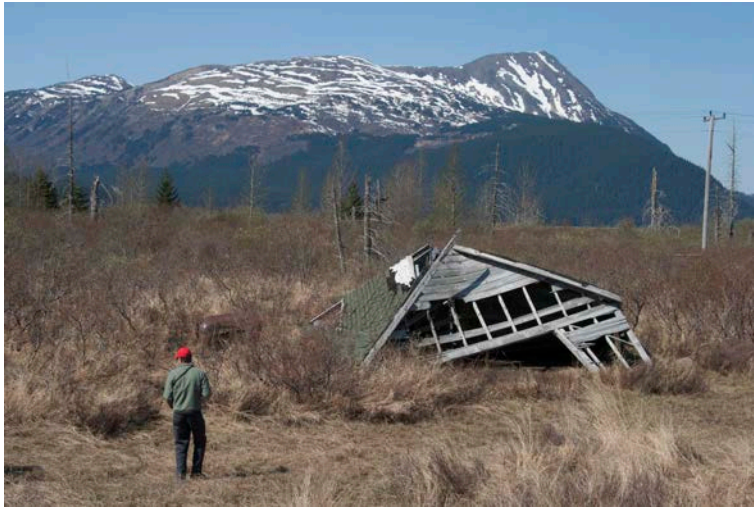
Coseismic subsidence produced in the Alaska 1964 Earthquake (Portage Garage, Alaska)

IGCP-596 “Climatic change and biodiversity patterns in the Mid-Palaeozoic (Early Devonian to Late Carboniferous)