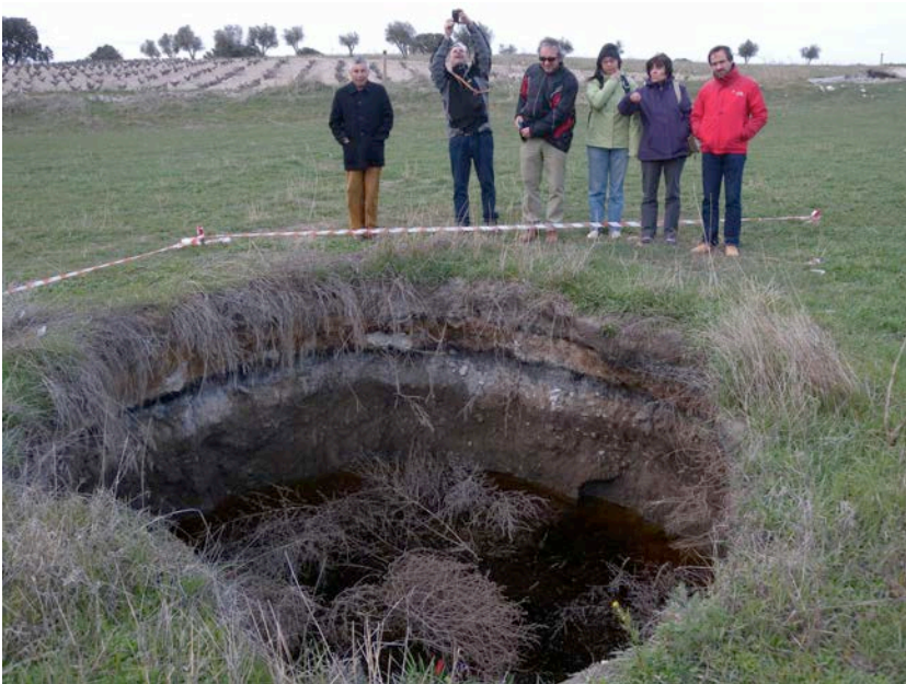
Members of the Spanish National Committee at the Annual Meeting in Tablas de Daimiel (Ciudad Real, March 2014). Colapse of Quaternary sediments on karstified Pliocene carbonates due to the rise of freatic table since 2009.

Finally and due to the new UNESCO policies on Earth Sciences, the Chairman of the Committee has started contacts with the National Committee on Geoparks; as a first result, he has been appointed as Assessor Member of this Committee.