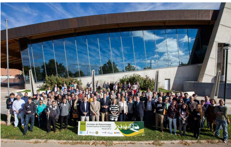
Participants at the XXX Spanish Palaeontological Society Meeting and Annual Spanish IGCP 596 Symposium in Teruel (Spain, October 2014).