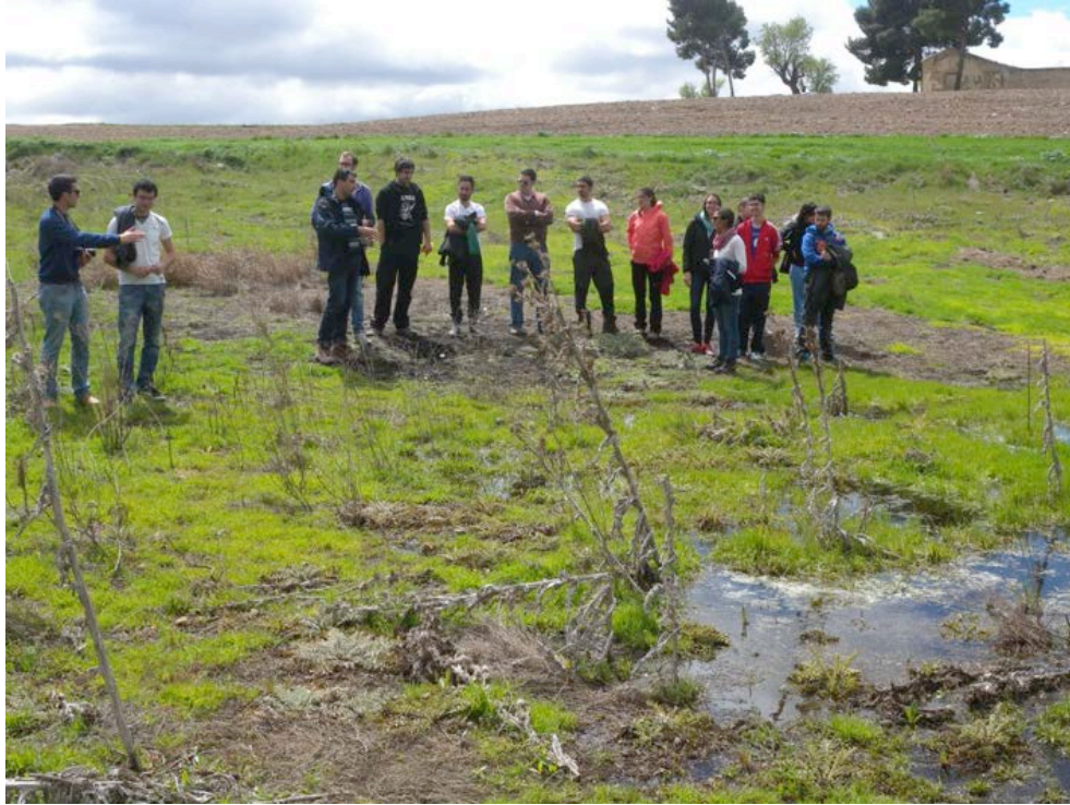
Students of the Escuela de Organización Industrial visiting the “Ojos del Guadiana” springs. After 35 years, groundwater appeared in the highest springs of the Guadiana Valley in spring 2014, with near 0 TU of tritium content.

The MINECO CGL2011-30302-C02-01 project website ( http://www.igme.es/ProPaleoTD/default.htm ) is also used to give about the activities of the IGCP-618 Spanish Group.