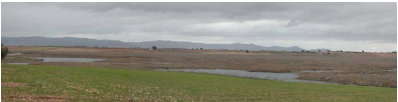
Groundwater appearance in the Guadiana Valley near the “motilla de Zuacorta” (“Motilla”: Bronze Age settlement).