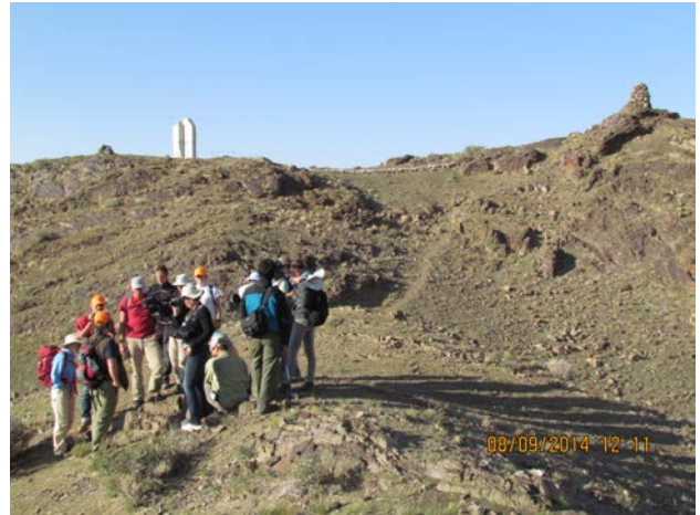
Fieldwork participants in the Devonian of the Baruunhuurai Terrane, Altai Gobi dessert, Mongolia .