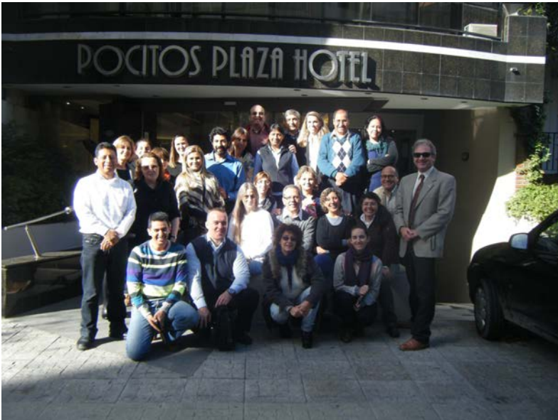
Participants of the Capacity Building Workshop on preparing IGCP Projects for Latin American leaders held in Montevideo (Uruguay, June 2014).