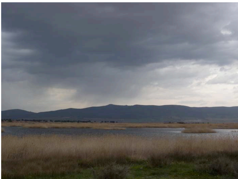
General view of Tablas de Daimiel (Ciudad Real, March 2014). In foreground view of the non-flooding relic carbonates relief, which forms an island; flooded area with parts covered by vegetation and others free (tablas and tablazos). Background shows carbonate relics and alluvial fans at the foothill of the Montes de Toledo palaeozoic relief.