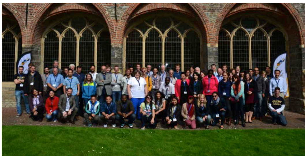
Group photo (September 2014) of the 2 nd Deep-Water Circulation Congress in Ghent (Belgium).

During 2014 we have been working to update the web page related to the IGCP-619 Project http://www.contourites.org/