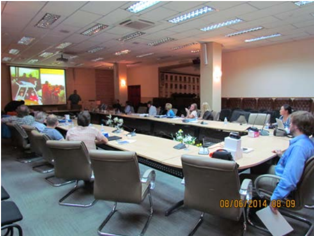
Technical session IGCP 596/580 joint meeting and field workshop in Ulaanbaatar, Mongolia (August 2014).

Next year the SWG will organise a Special Symposium in connection with the XXXI Annual Meeting of the Spanish Paleontological Society that will take place in Baeza. Besides, it is the intention to participate, at least, in the Joint SDS-IGCP 596 to be held Brussels and to attend the Strati2015 Conference in Graz.