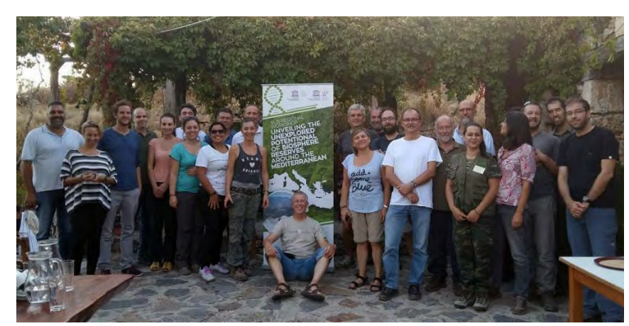
▲ ©UNESCO - Family Photo International workshop on Unveiling the unexplored potential of Biosphere Reserves. Around the Mediterranean

The objective of the workshop was primarily to facilitate the exchange of experiences and good practices among biosphere reserves having common issues to address - such as climate change, tourism development and seasonal migrations, water resources management, etc. The workshop aimed to strengthen knowledge and skills of key biosphere reserves' stakeholders with a view to enhancing their managerial and communication capacities in addressing the current emerging challenges faced by island and