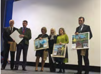
inuaguration ceremony

BIYEARLY NEWSLETTER • http://www.unesco.org/venice