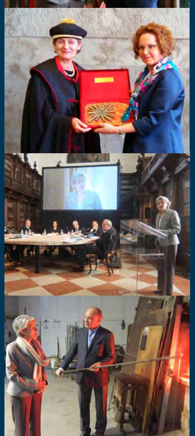
Municipality of Venice; University Ca' Foscari of Venice; Fondazione Giorgio Cini onlus; Archimede Seguso glass factory; UNESCO

The visit was an opportunity to mark the longstanding cooperation with Italy and to express UNESCO's support to its government and people after the country was struck by a series of powerful earthquakes – causing human casualties and considerable damage to heritage, notably in Amatrice and Norcia. In Venice, the Director-General opened an international conference at the Fondazione Cini on the future of the lagoon city and the sustainable management of its heritage, entitled "Sustainability of local commons with a global value: the case of Venice and its lagoon".