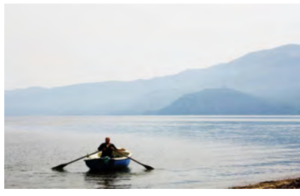
© UNESCO / IUCN/ Aleksandra Nikodinovic - Fisherman

The training course "Nature Management for the Proposed Extension of the World Heritage Property: Natural and Cultural Heritage of the Ohrid Region" was held in Tushemisht, Albania, on 6-7 December 2016.