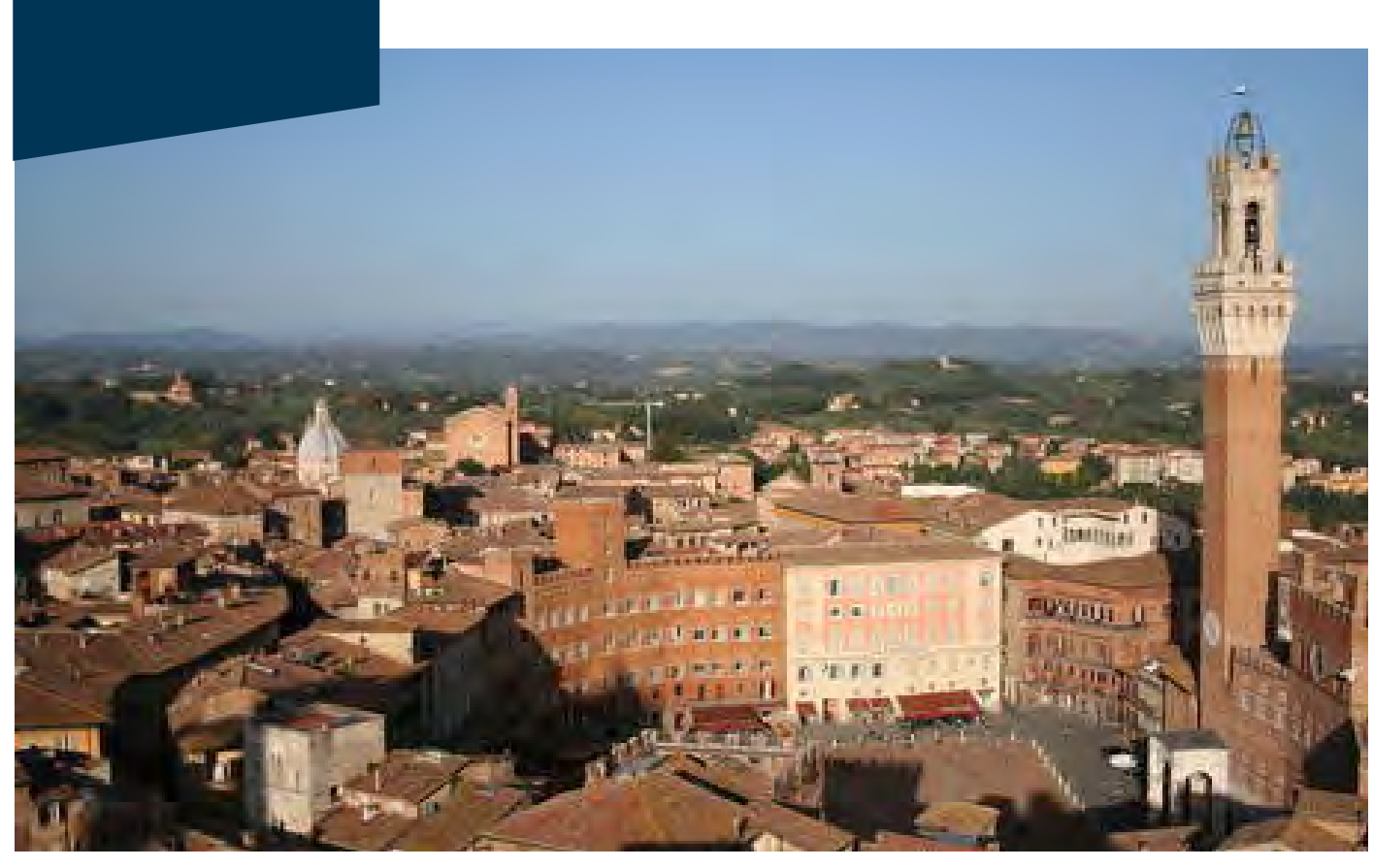
© Massimo Catarinella - View of Piazza del Campo (Campo Square), the Mangia Tower (Torre del Mangia)