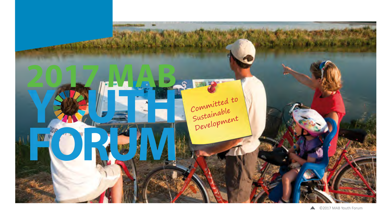
2017 MAB Youth Forum commits to Sustainable Development

Po Delta Biosphere Reserve, Italy. 18-23 September 2017. Young people are the future of biosphere reserves and must be given a voice in shaping their territory and defining their engagement in the Man and the Biosphere (MAB) Programme of UNESCO.