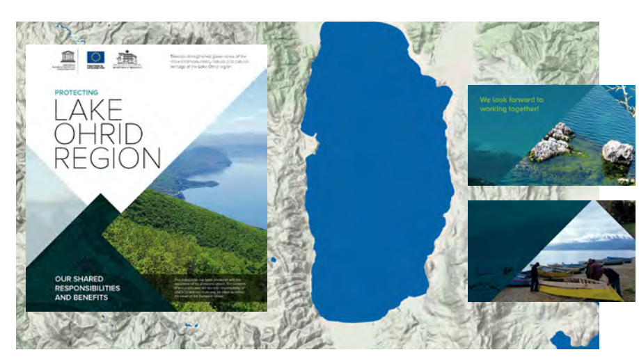
C Protecting Lake Ohrid - our shared responsibilities and benefic

Region" was cited as a model for World Heritage upstream processes aimed at supporting World Heritage nomination efforts by national and local authorities. The Lake Ohrid project was highlighted for its strong capacity-building components for integrated management and its interlinkages of natural and cultural heritage conservation. In cooperation with the Advisory Bodies (ICCROM, ICOMOS and IUCN) capacity building activities related to integrated management and other relevant thematic areas. such as collaborative management. >>full story