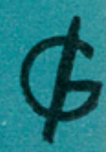
(Examples of Priority Projects)

U.S.A. - PHILIPPINES A gift of $10,000 from the National Education Association furnished a Teachers' Pavilion at the Manuel Quezon Tubercular Institute in Manila.