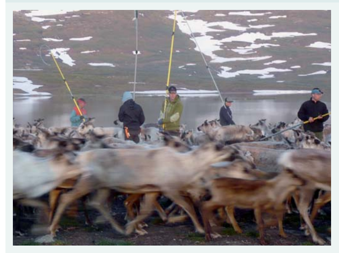
Sami herders marking reindeer calves in a temporary corral near Staloluokta, Laponian Area World Heritage Site, Sweden. The use of a long pole and noose to capture the calves has been adopted recently in some parts of the Sami territory, replacing the traditional hand-thrown lasso.

The knowledge of snow and ice Roué, Marie