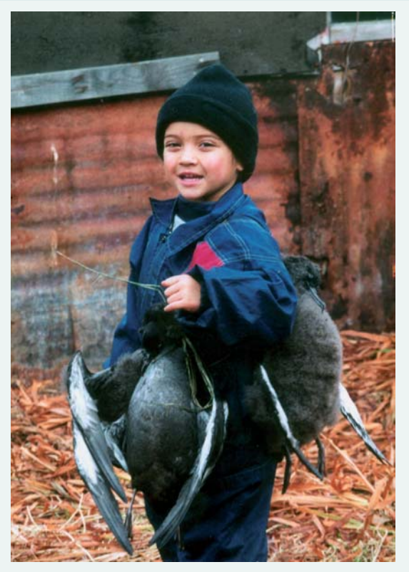
Rakiura Māori children learn how to work the birds from an early age. Maintaining the abundance of the birds is not just about maintaining biodiversity and the ecological integrity of the breeding island ecosystems. It is also about nurturing Rakiura cultural identity, kinship and connection to their ancestral places, sustaining their bio-economy. Sustainable birding allows them to continually update and adapt their Traditional Ecological Knowledge, partly by learning from science.