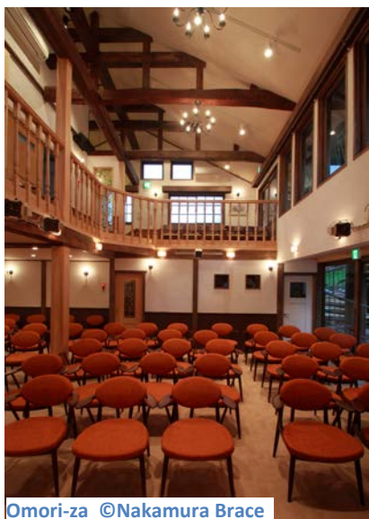
Omori-za