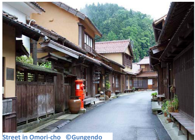
Street in Omori-cho

Cultural Heritage site in 2007 for its preservation of ancient wooden buildings using traditional skills and materials. Omori-cho had been dying a slow death since the silver mines closed in 1923. Now an influx of young people, most of whom moved there after the earthquake, are bringing revival.