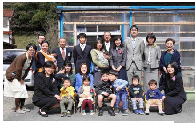
Graduation Ceremony of day care center @Gungendo