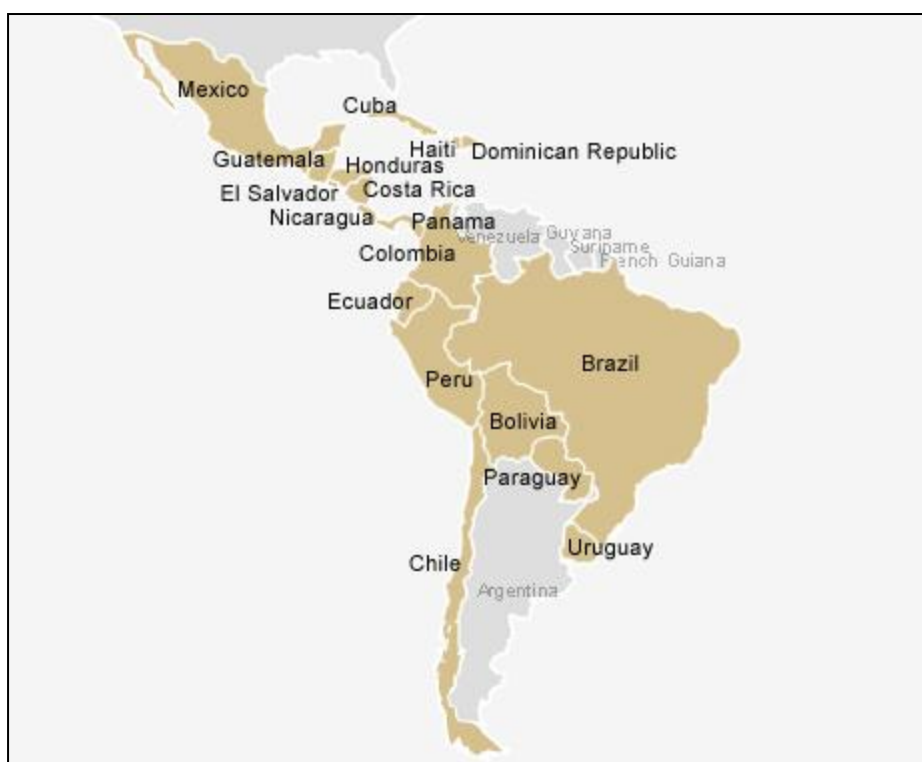
Latin American countries with active Joint Programmes as part of the MDG-F thematic window on Democratic Economic Governance

Out of the 11 countries that are part of the DEG thematic window, seven are located in Latin America, two in Europe, one in Asia and one in Africa: