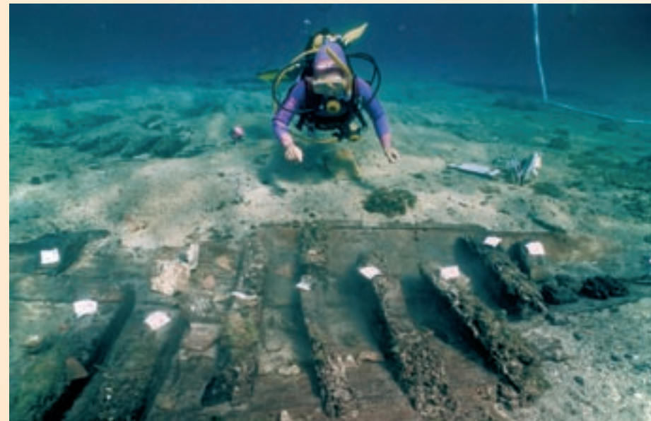
Italy, wreck located in Porto San Paolo, III. Century A.D.

Information shared between States Parties or UNESCO shall be kept confidential and reserved to the competent authorities as long as the disclosure of such information might endanger the preservation of underwater cultural heritage.