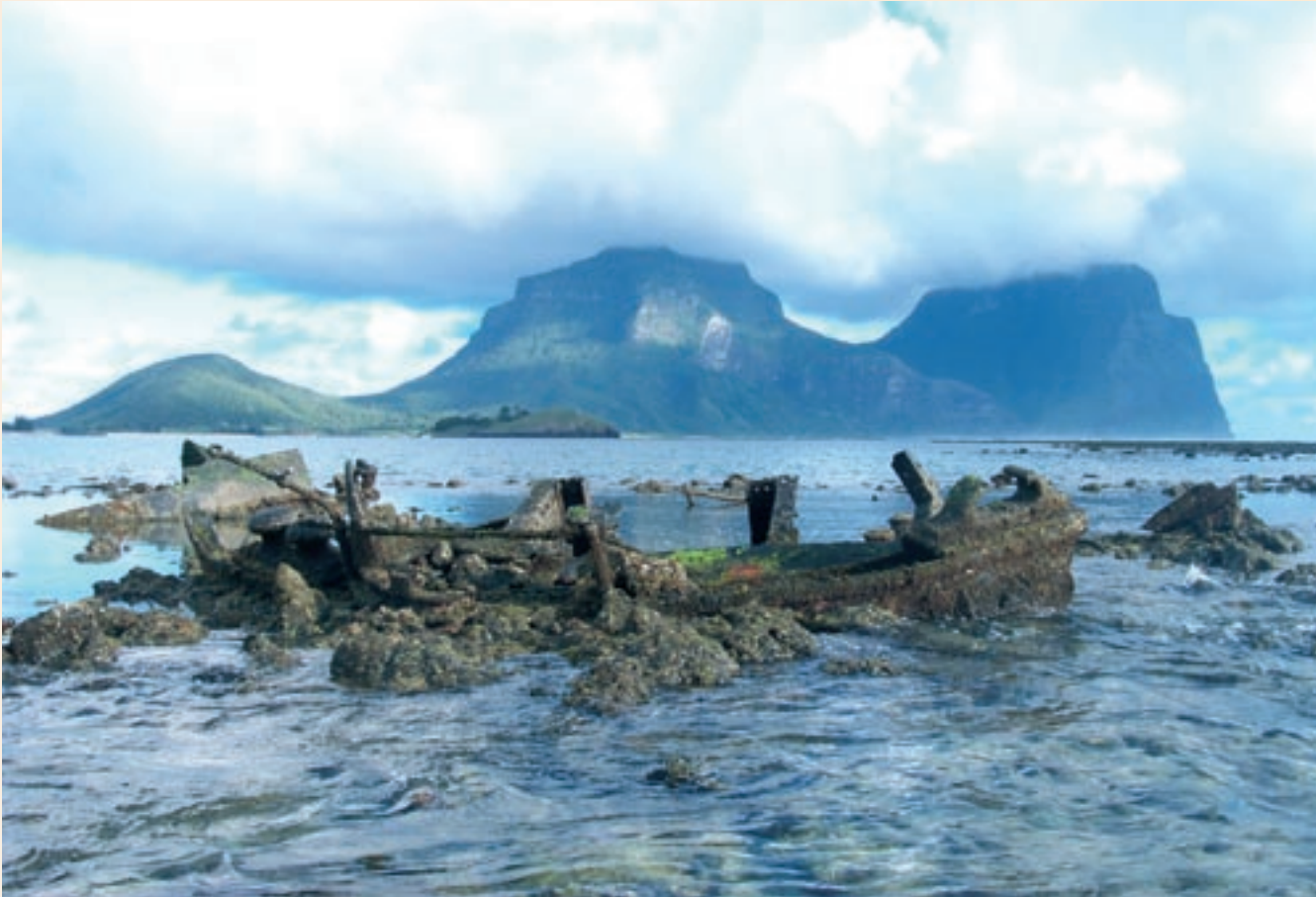
T. Smith © UNESCO. Wreck of Jacque del Mar , touching the water surface.