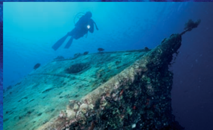
Wreck of the Umbria , Wingate Reef, Port Sudan.

The 2001 Convention regulates that it has to be applied in conformity with other international law, including UNCLOS.