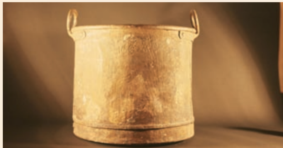
France, Copper cauldron, wreck of the Dorothee , 1693, Villefranche-sur-Mer, excavation by M. L'Hour.

• The Pharos of Alexandria and the palace of Cleopatra , in Egypt, were driven into the sea by a series of earthquakes in the fourteenth century. Today, they lie 6 to 8 metres under the waters of the bay of Alexandria. Underwater archaeologists and other scientists have carried out several excavations to explore and save the ruins. Thousands of objects (statues, sphinxes, columns and blocks) superimposed from Pharaonic, Ptolemaic and Roman periods have been recovered and partly presented to the public in major exhibitions, each drawing thousands of visitors. The rest of the ruins will be left in the bay, and the construction of an underwater museum in cooperation with UNESCO is being considered in order to preserve the relics in situ .