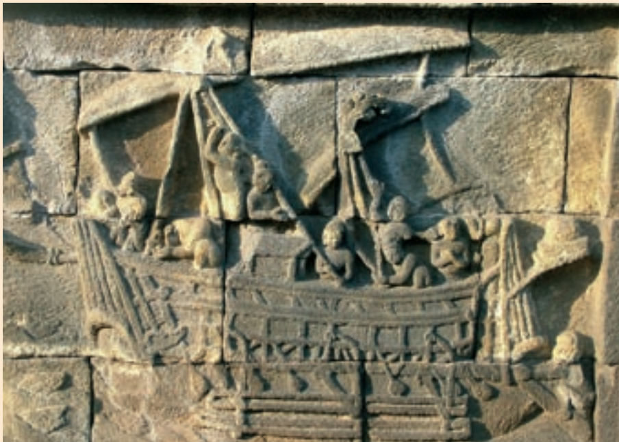
Ancient seafaring – fresco on the walls of the temple of Borobudur, Indonesia.

In recent years, underwater cultural heritage has attracted increasing attention from both the scientific community and the general public. To scientists, it represents an invaluable source of information on ancient civilizations and historic seafaring. To the public at large, it offers an opportunity to further develop leisure diving and tourism.