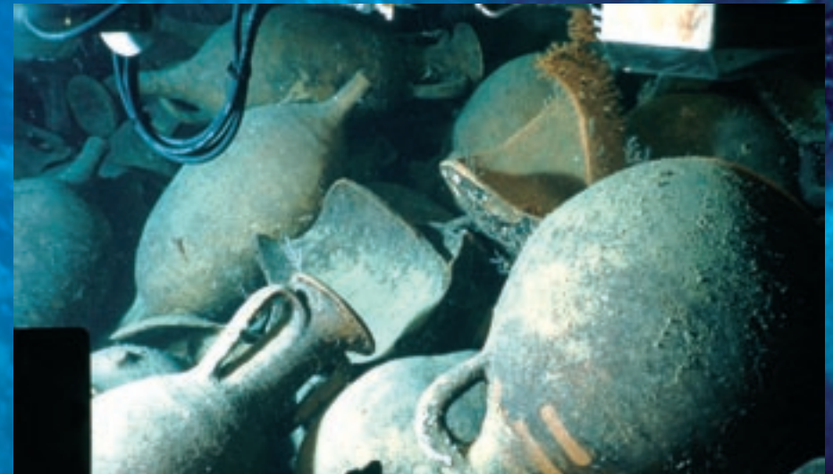
France, Amphorae at great depth, Arles 4, 1 st century A.D.

How can you call this planet earth, when it is quite clearly water?