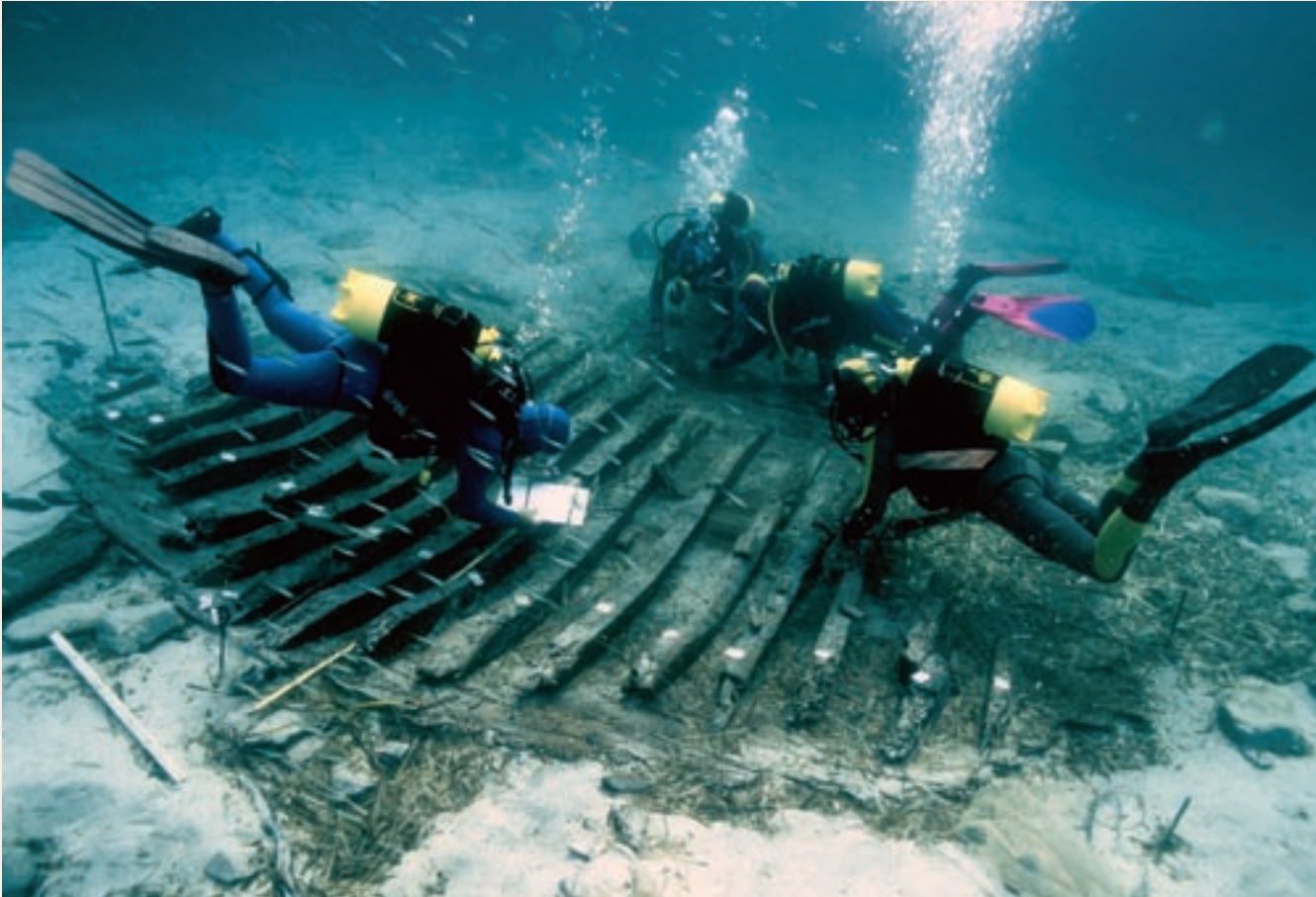
E. Trainito © UNESCO. Italy, wreck located in Baia Salinedda, III. Century A.D.