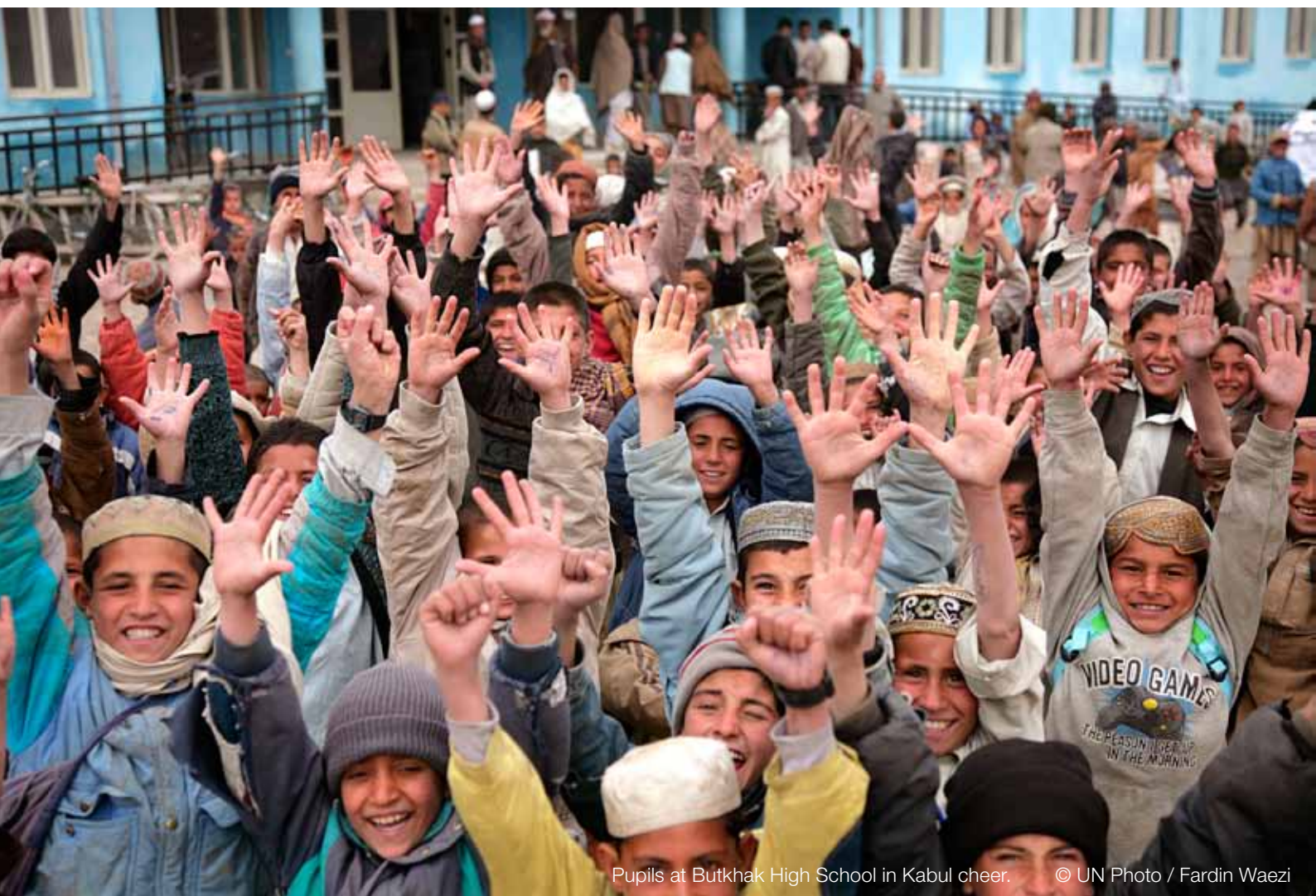
Pupils at Butkhak High School in Kabul cheer.

Throughout the 20th century, Afghanistan's education system tended to impose a militant national ideology on students. There is movement towards more equitable, non-ideological education provision, which could strengthen the social contract between state and citizen. A key question concerns centralization versus decentralization: Central-level curriculum oversight is essential to emphasizing a united national history. Equity across provinces requires central-level control too. Protection of education from attack, on the other hand, is best negotiated at