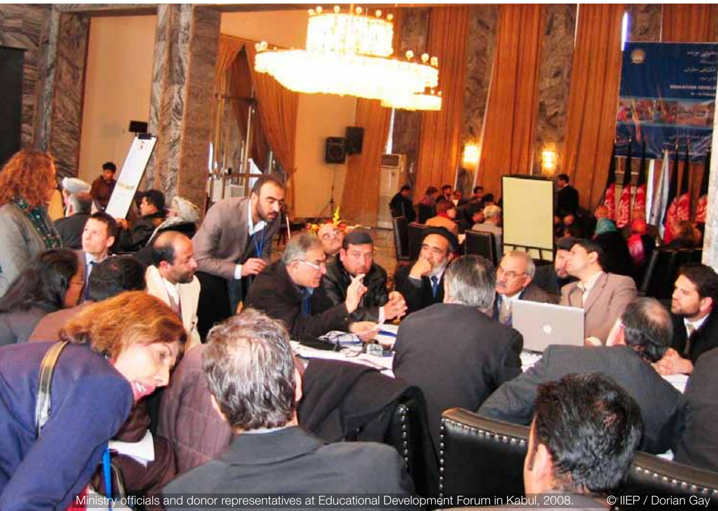
Ministry officials and donor representatives at Educational Development Forum in Kabul, 2008.

is a priority?' The development of the national education plan helped the government to prioritize more strategically.