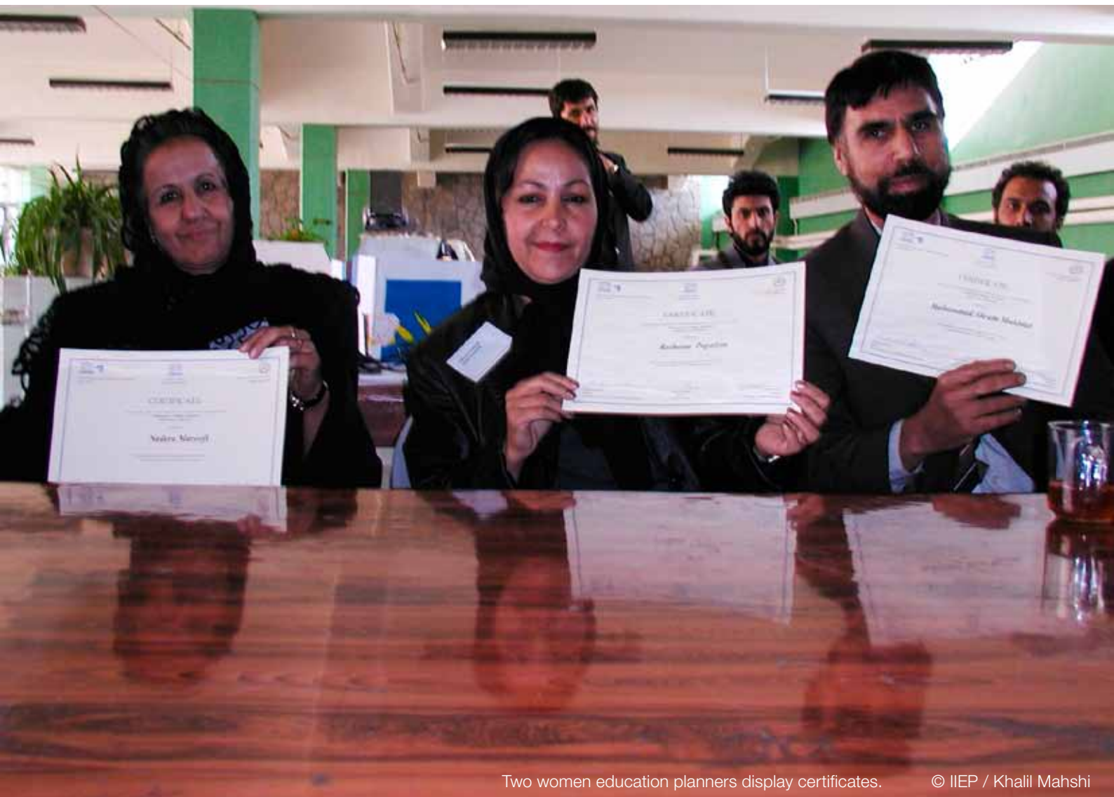
Two women education planners display certificates.

Agency collaboration with the Ministry on policy documents led to capacity development and enabled donor coordination; learning throughout the process was more important than perfect products.