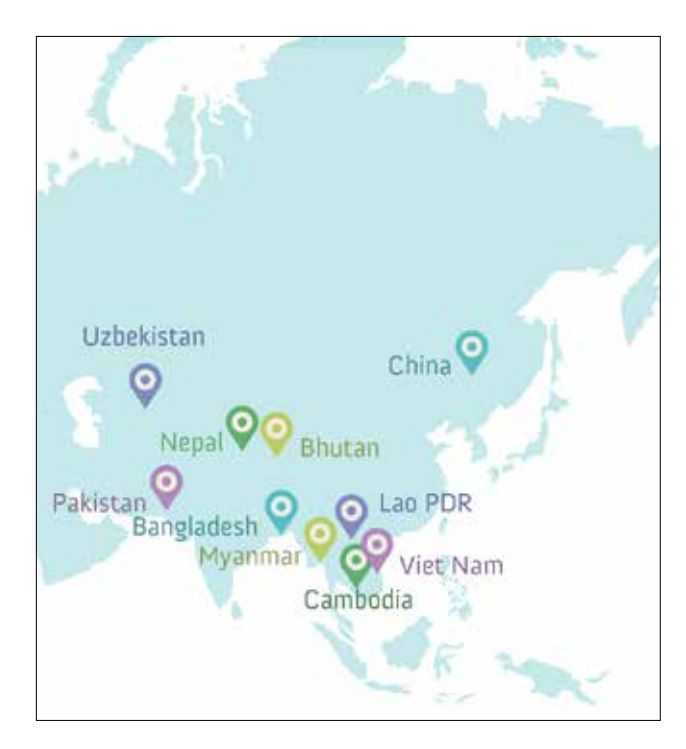
Figure 2: Countries of the Regional Synthesis Report on School Finance in the Asia-Pacific Region

that cannot be overcome easily in many situations. Greater responsibility, authority with accountability and transparency involve a change process that is introduced gradually, linking devolution of tasks, functions and roles with capacity enhancement, and demonstration of skills and capability in action.