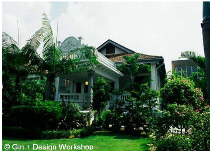
733 Mountbatten Road (Singapore) wins the Jury Commendation for Innovation Award of Excellence in the 2008 UNESCO Asia-Pacific Heritage Awards for Culture Heritage Conservation

The 2008 Heritage Awards Jury Commendation for Innovation was awarded to 733 Mountbatten Road (Singapore). The Jury Commendation recognizes newly-built structures which demonstrate outstanding standards for contemporary architectural design which are well integrated into historic contexts. The 2008 Jury Commendation submissions include five projects (a commercial building, residential buildings and an educational institution) from four countries in the region.