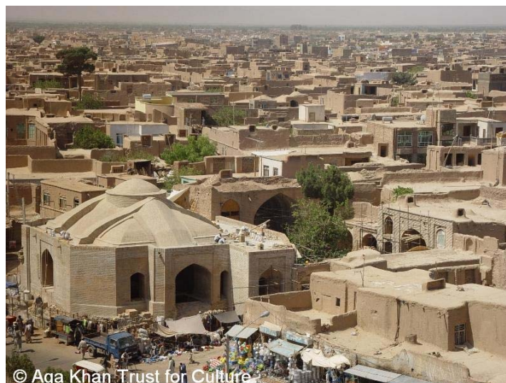
Herat Old City (Afghanistan) wins the Award of Excellence in the 2008 UNESCO Asia-Pacific Heritage Awards for Culture Heritage Conservation

Six Honourable Mentions were also announced. They are Béthanie in Hong Kong SAR, China, the Archiepiscopal Palace in Goa, India, the Craigie Burn Bungalow in Matheran, India, Bach 38 in Rangitoto Island, Auckland, New Zealand, the Amphawa Canal Community in Amphawa District, Samut Songkhram Province, Thailand and the Crown Property Bureau Building in Chachoengsao Province, Thailand.