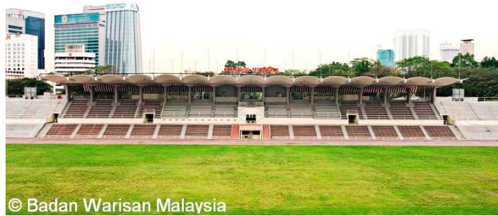
Stadium Merdeka (Kuala Lumpur, Malaysia) wins the Award of Excellence in the 2008 UNESCO Asia-Pacific Heritage Awards for Culture Heritage Conservation

The 2008 Heritage Awards Jury Commendation for Innovation was awarded to 733 Mountbatten Road (Singapore). The Jury Commendation recognizes newly-built structures which demonstrate outstanding standards for contemporary architectural design which are well integrated into historic contexts. The 2008 Jury Commendation submissions include five projects (a commercial building, residential buildings and an educational institution) from four countries in the region.