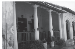
Old Houses in the Galle Fort, Galle, Sri Lanka