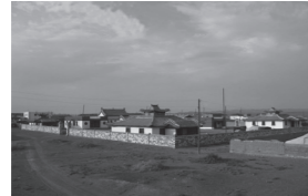
Sangiin Dalai Monastery, South Gobi Aimaq, Mongolia