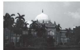
Prince of Wales Museum, Mumbai, Maharashtra, India