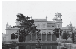
Chowmahalla Palace, Hyderabad, Andhra Pradesh, India