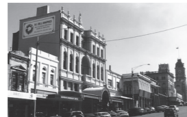
Ballarat Mechanics' Institute, Melbourne, Victoria, Australia