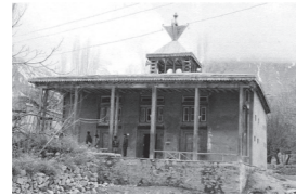
Gulabpur Khanqah, Skardu, Gilgit-Baltistan, Pakistan