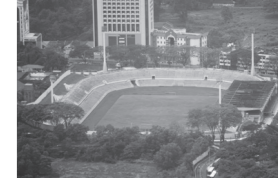
Stadium Merdeka, Kuala Lumpur, Malaysia