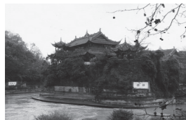
Fu'long Taoist Temple, Dujiangyan City, Sichuan Province, China