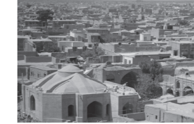
Herat Old City, Afghanistan