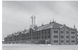
Red Brick Warehouse, Yokohama, Japan