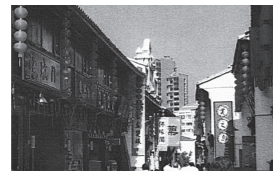
North Xinjiao Street, Taizhou, Zhejiang, China