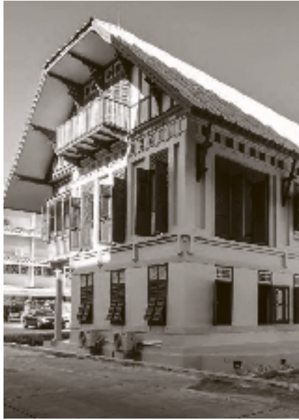
2014 Award of Merit : Phraya Si Thammathirat Residence, Bangkok, Thailand