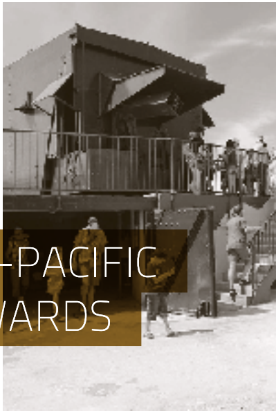
2014 Honourable Mention : Rottneest Island World War II Coastal Defences, Rottneest Island, Western Australia