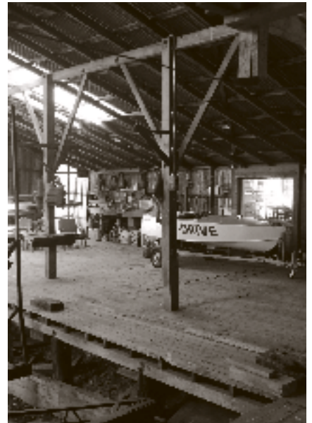
2014 Award of Merit : Frankton Boatshed, Queenstown, New Zealand