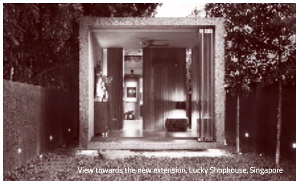
View towards the new extension, Lucky Shophouse, Singapore

3.4 The submission must demonstrate that no structures of heritage significance were altered or cleared from the site for the purpose of the project submitted for the Award for New Design in Heritage Contexts.