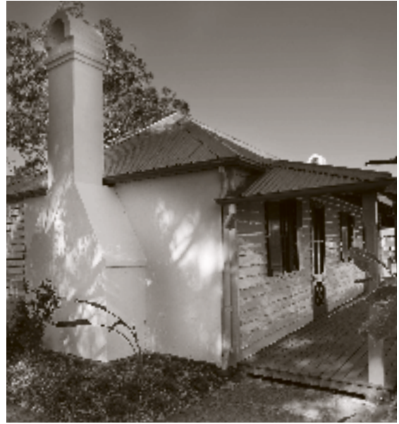
2014 Award of Merit : Exeter Farm, Glenwood, New South Wales, Australia