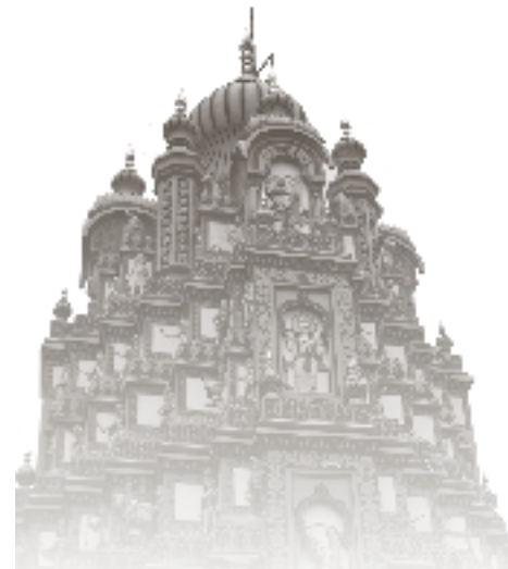
2014 Award of Merit : Shri Sakhargad Niwasini Devi Temple Complex, Kinhai Village, Maharashtra, India