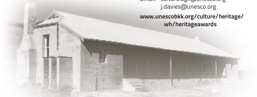
2014 Honourable Mention : Cape Inscription Lighthouse Keepers' Quarters, Shark Bay, Western Australia, Australia

www.unescobkk.org/culture/heritage/wh/heritageawards