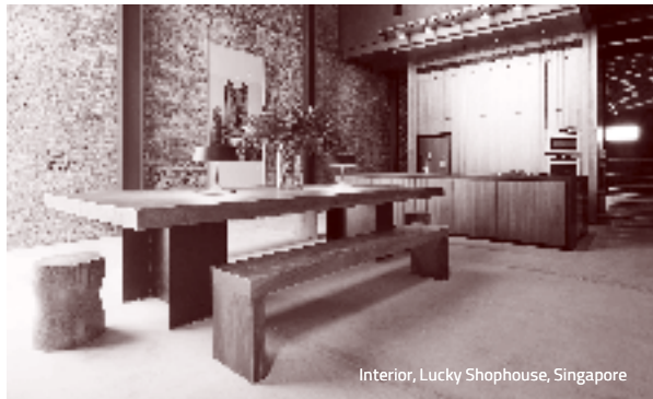
Interior, Lucky Shophouse, Singapore