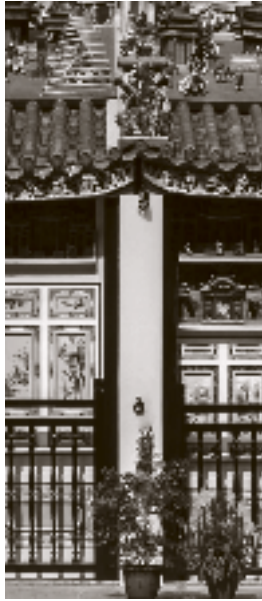
2014 Award of Merit : Wak Hai Cheng Bio, Singapore