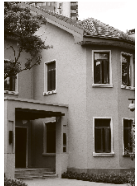
2014 Honourable Mention : Nanjing Yihe Mansions, Jiangsu Province, China