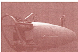
M24 Midget Submarine Wreck, Sydney, Australia