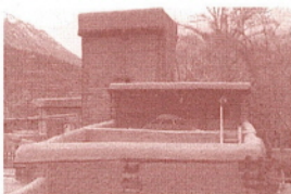
Ali Gohar House, Ganish, Hunza, Pakistan