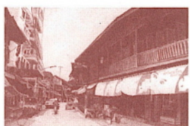
Samchuk Community, Suphanburi Province, Thailand