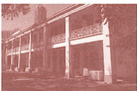
Former Royal Air Force Officers' Mess, Hong Kong SAR, China