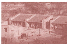
Maosi Ecological Demonstration Primary School, Qingyang, Gansu Province, China