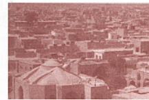
Herat Old City, Afghanistan