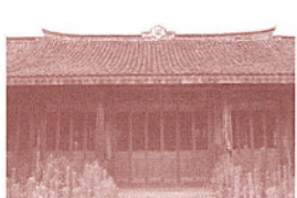
Heritage Buildings, Cicheng Historic Town, Zhejiang Province, China