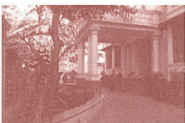
YWCA Lady Willingdon Hostel, Mumbai, India