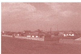
Sangiin Dalai Monastery, South Gobi Aimaq, Mongolia