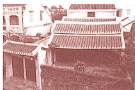
Tang Family Chapel, Hoi An, Viet Nam