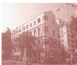
YMCA Students Branch, Mumbai, India