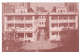
Huai Hai Lu 796, Shanghai, China