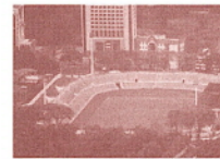
Stadium Merdeka, Kuala Lumpur, Malaysia