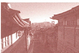
Hanok Regeneration in Bukchon, Seoul, Republic of Korea