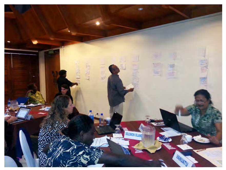
Figure 3: Consensus workshop: PILNA Steering Committee meeting, Nadi, Fiji, 18 August 2015