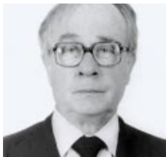
Carlos Chagas Filho

• TWAS Founding Fellow Carlos Chagas Filho died earlier this year after a long illness. Chagas, one of Latin America's most accomplished and honoured scientists, was born in Rio de Janeiro and educated in Brazil and France. In 1945, soon after receiving his doctorate, he founded the Institute of Biophysics at the Federal University of Rio de Janeiro, and then served as the institute's director for the next 20 years. Under Chagas's leadership, the institute emerged as one of the most respected scientific research facilities in the developing world — a centre of excellence that served as a model for others. In appreciation of his endless contributions, the