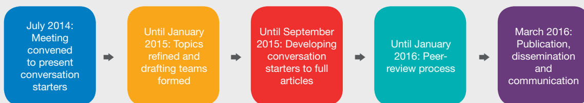
Figure 1. Development phases of the oral reading assessments recommendations

The 20-month process that culminated in the development of these recommendations can be summarised in Figure 1 .