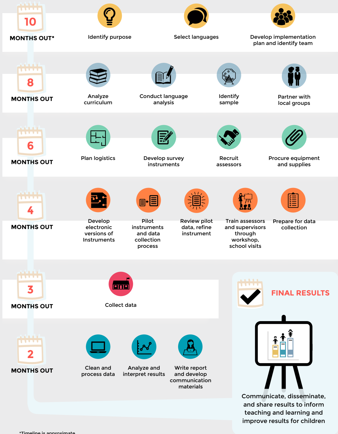
Figure 2. The Early Grade Reading Assessment Timeline