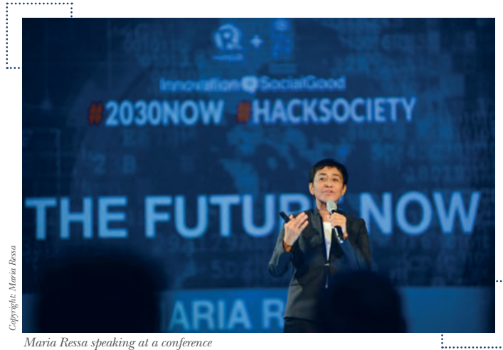
Maria Ressa speaking at a conference

“They attack your physicality, your sexuality. When you are denigrated, and stripped of dignity in this way, how can you maintain your credibility? All of these things work together for a single purpose and that’s to prevent journalists from doing their jobs,” Ressa says.