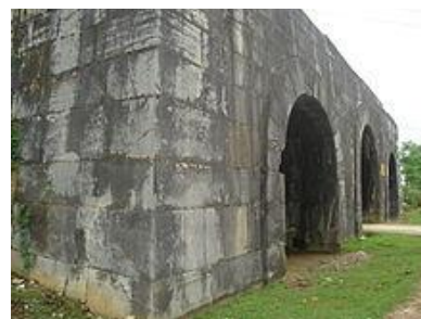
Cultural site inscribed in 2011

The 14th -century Ho Dynasty citadel, built according to the Feng Shui principles, testifies to the flowering of neo-Confucianism in late 14th century Viet Nam and its spread to other parts of east Asia. According to these principles it was sited in a landscape of great scenic beauty on an axis joining the Tuong Son and Don Son mountains in a plain between the Ma and Buoï rivers. The citadel buildings represent an outstanding example of a new style of south-east Asian imperial city.