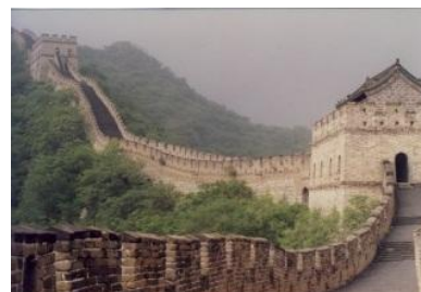
Cultural site inscribed in 1987

In c. 220 B.C., under Qin Shi Huang, sections of earlier fortifications were joined together to form a united defence system against invasions from the north. Construction continued up to the Ming dynasty (1368–1644), when the Great Wall became the world's largest military structure. The Great Wall runs across North China like a huge dragon. It winds its way from west to east, across deserts, over mountains, through valleys till at last it reaches the sea. It's the longest wall on the earth, also one of the wonders in the world. Its historic and strategic importance is matched only by its architectural significance.