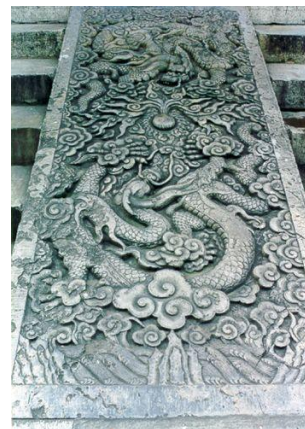
© UNESCO Cultural site inscribed in 2008

Project objectives: Through educational activities, the hands on work, and the scientific research during the project, the project aims to find a way to establish a model of sustainable development of World Heritage Site. Moreover, the project aims to enhance the understanding of World Heritage protection, to address challenges posed by excessive tourism at the site, and to promote the ancient Chinese philosophy of the Confucianism.