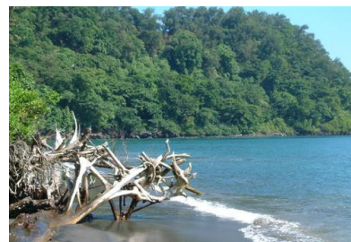
Natural site inscribed in 1991

This national park, located in the extreme south-western tip of Java on the Sunda shelf, includes the Ujung Kulon peninsula and several offshore islands and encompasses the natural reserve of Krakatoa. In addition to its natural beauty and geological interest – particularly for the study of inland volcanoes – it contains the largest remaining area of lowland rainforests in the Java plain. Several species of endangered plants and animals can be found there, the Javan rhinoceros being the most seriously under threat.