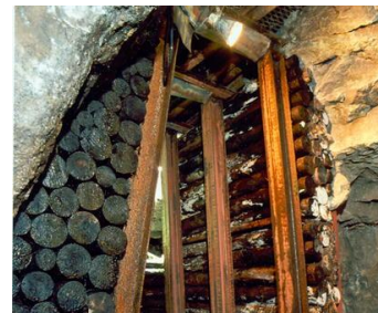
Cultural site inscribed in 2007

The Iwami Ginzan Silver Mine in the south-west of Honshu Island is a cluster of mountains, rising to 600 m and interspersed by deep river valleys featuring the archaeological remains of large-scale mines, smelting and refining sites and mining settlements worked between the 16th and 20th centuries. The site also features routes used to transport silver ore to the coast, and port towns from where it was shipped to Korea and China. The mines contributed substantially to the overall economic development of Japan and south-east Asia in the 16th and 17th centuries, prompting the mass production of silver and gold in Japan. The mining area is now heavily wooded. Included in the site are fortresses, shrines, parts of Kaidô transport routes to the coast, and three port towns, Tomogaura, Okidomari and Yunotsu, from where the ore was shipped.