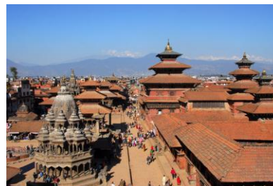
Cultural site inscribed in 1979

The cultural heritage of the Kathmandu Valley is illustrated by seven groups of monuments and buildings which display the full range of historic and artistic achievements for which the Kathmandu Valley is world famous. The seven include the Durbar Squares of Hanuman Dhoka (Kathmandu), Patan and Bhaktapur, the Buddhist stupas of Swayambhu and Bauddhanath and the Hindu temples of Pashupati and Changu Narayan.