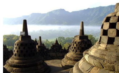
Cultural site inscribed in 1991

This famous Buddhist temple, dating from the 8th and 9th centuries, is located in central Java. It was built in three tiers: a pyramidal base with five concentric square terraces, the trunk of a cone with three circular platforms and, at the top, a monumental stupa. The walls and balustrades are decorated with fine low reliefs, covering a total surface area of 2,500 m 2 . Around the circular platforms are 72 openwork stupas, each containing a statue of the Buddha. The monument was restored with UNESCO's help in the 1970s.