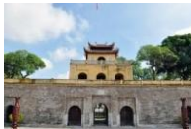
Cultural site inscribed in 2010

The Thang Long Imperial Citadel was built in the 11th century by the Ly Viet Dynasty, marking the independence of the Dai Viet. It was constructed on the remains of a Chinese fortress dating from the 7th century, on drained land reclaimed from the Red River Delta in Hanoi. It was the centre of regional political power for almost 13 centuries without interruption. The Imperial Citadel buildings and the remains in the 18 Hoang Dieu Archaeological Site reflect a unique South-East Asian culture specific to the lower Red River Valley, at the crossroads between influences coming from China in the north and the ancient Kingdom of Champa in the south.