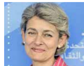
DR. MASOUMEH EBTEKAR Vice-President of the I.R. of Iran Head of the Department of Environment